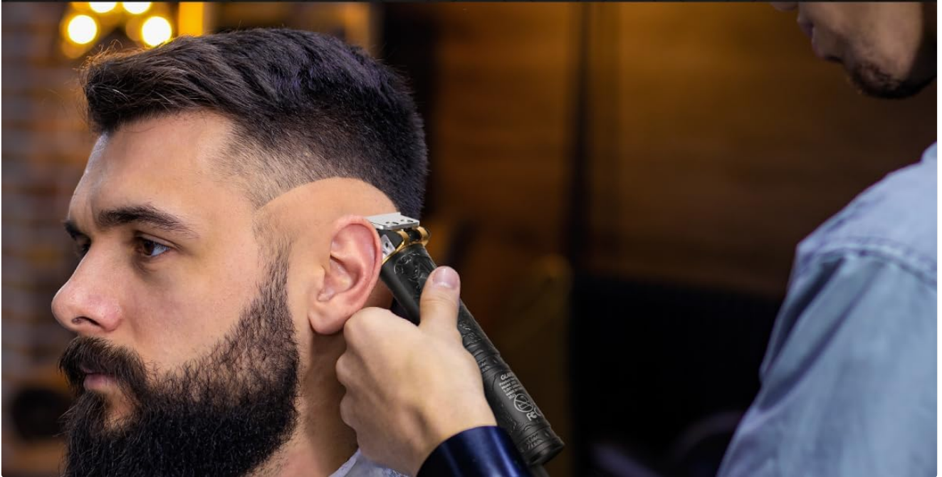
Image: A professional barber using the GLAKER hair clipper to style a client's hair, showcasing its ergonomic design and precision.