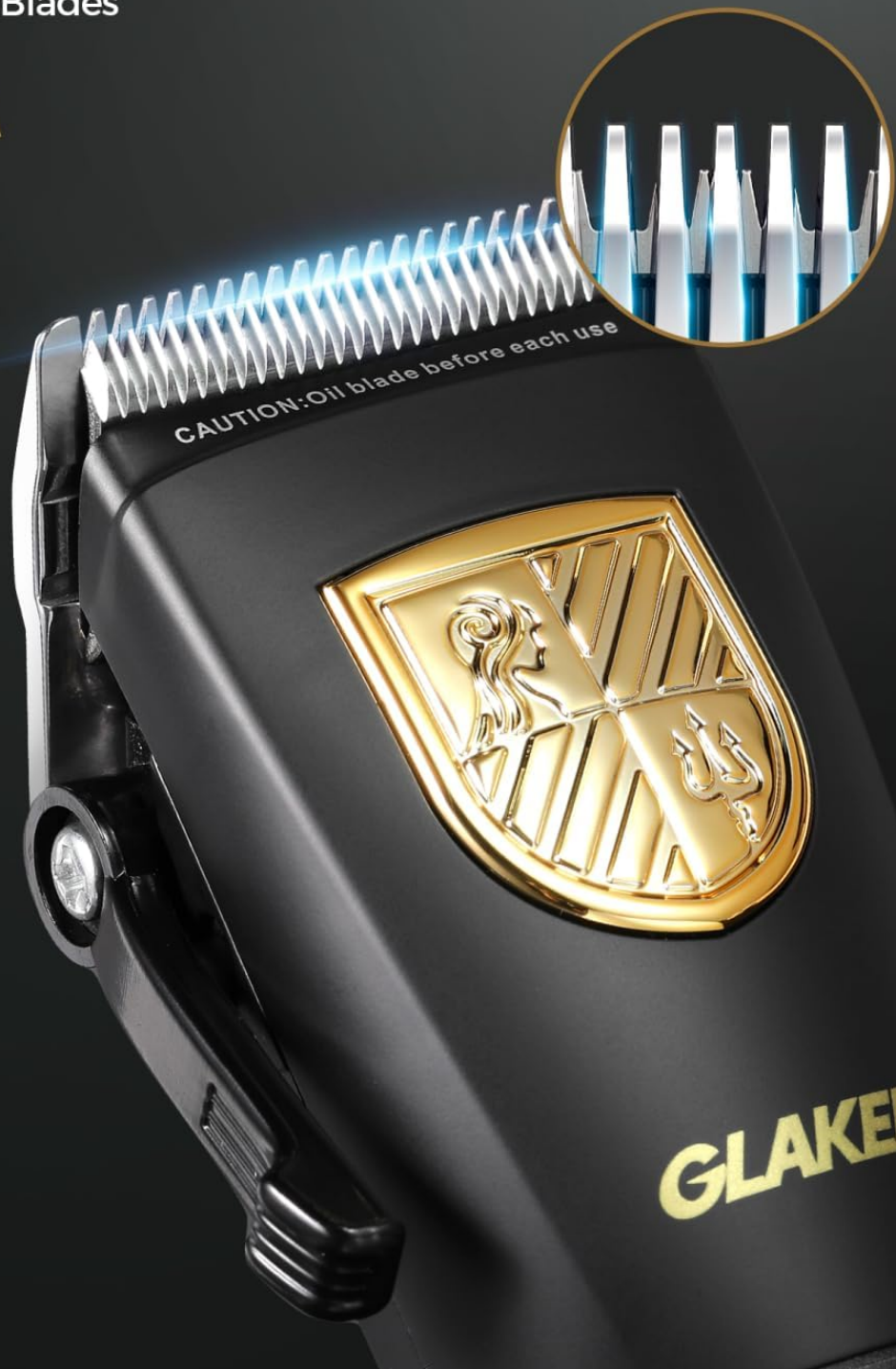
Image: A close-up shot of the sharp, high-performance blades of the GLAKER hair clipper.