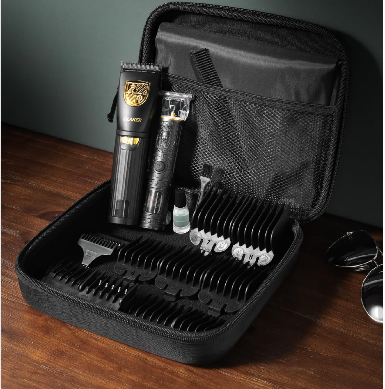
Image: The GLAKER grooming kit components organized within its dedicated storage case, emphasizing portability and protection.