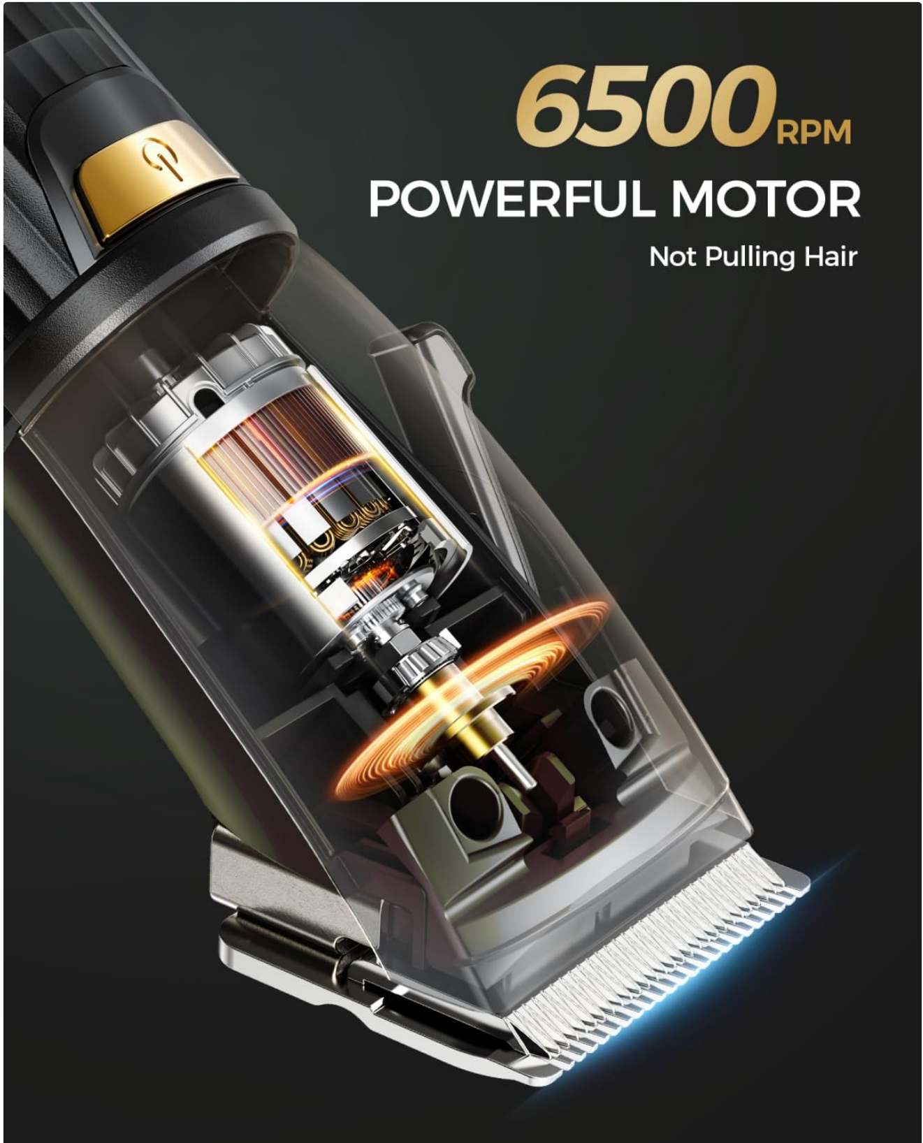
Image: Detailed view of the GLAKER clipper's powerful 6500 RPM motor, emphasizing its cutting capability.