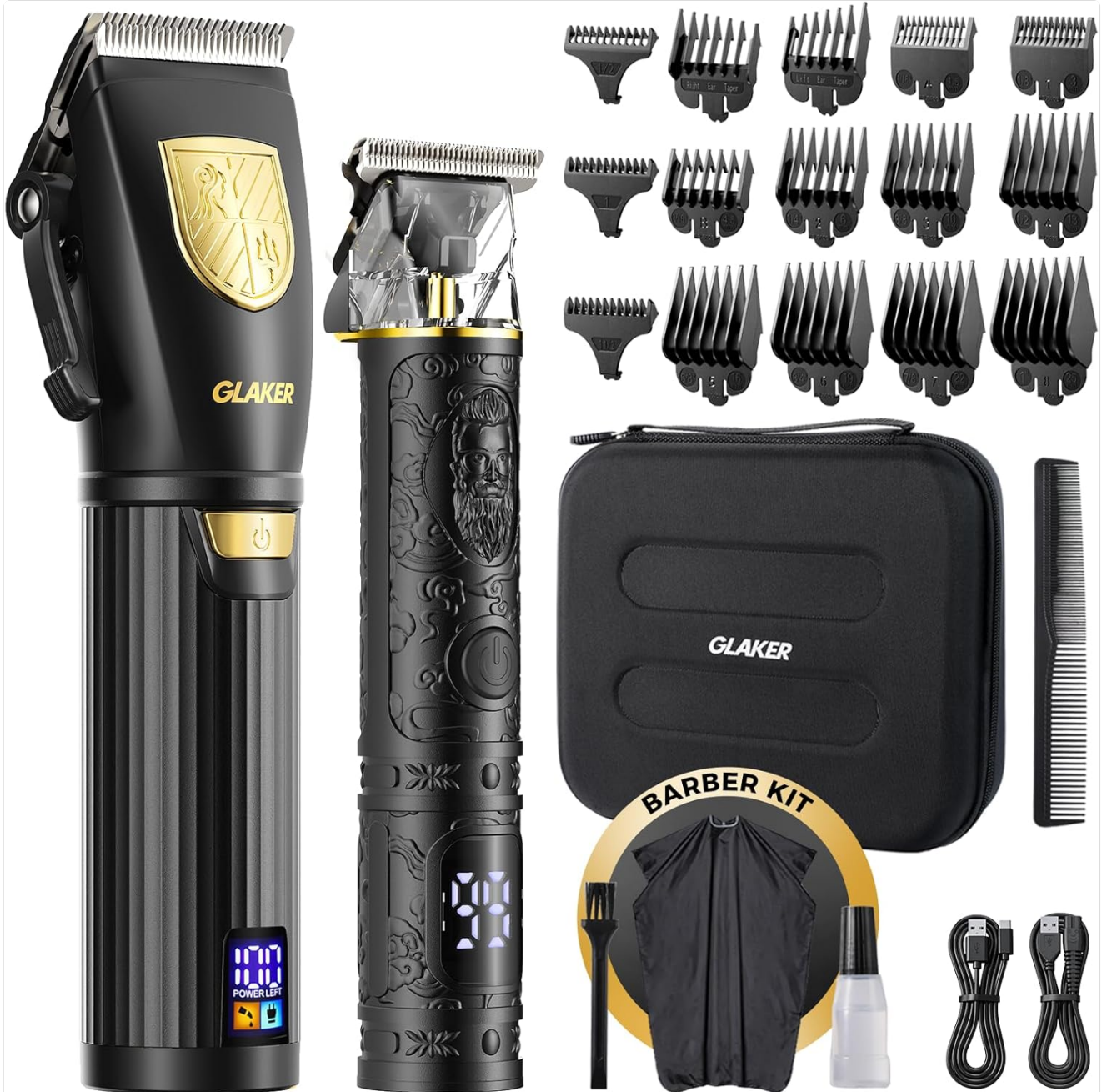
Image: The complete GLAKER Hair Clippers and Trimmer Kit, including the main clipper, detail trimmer, multiple guide combs, and a storage case.