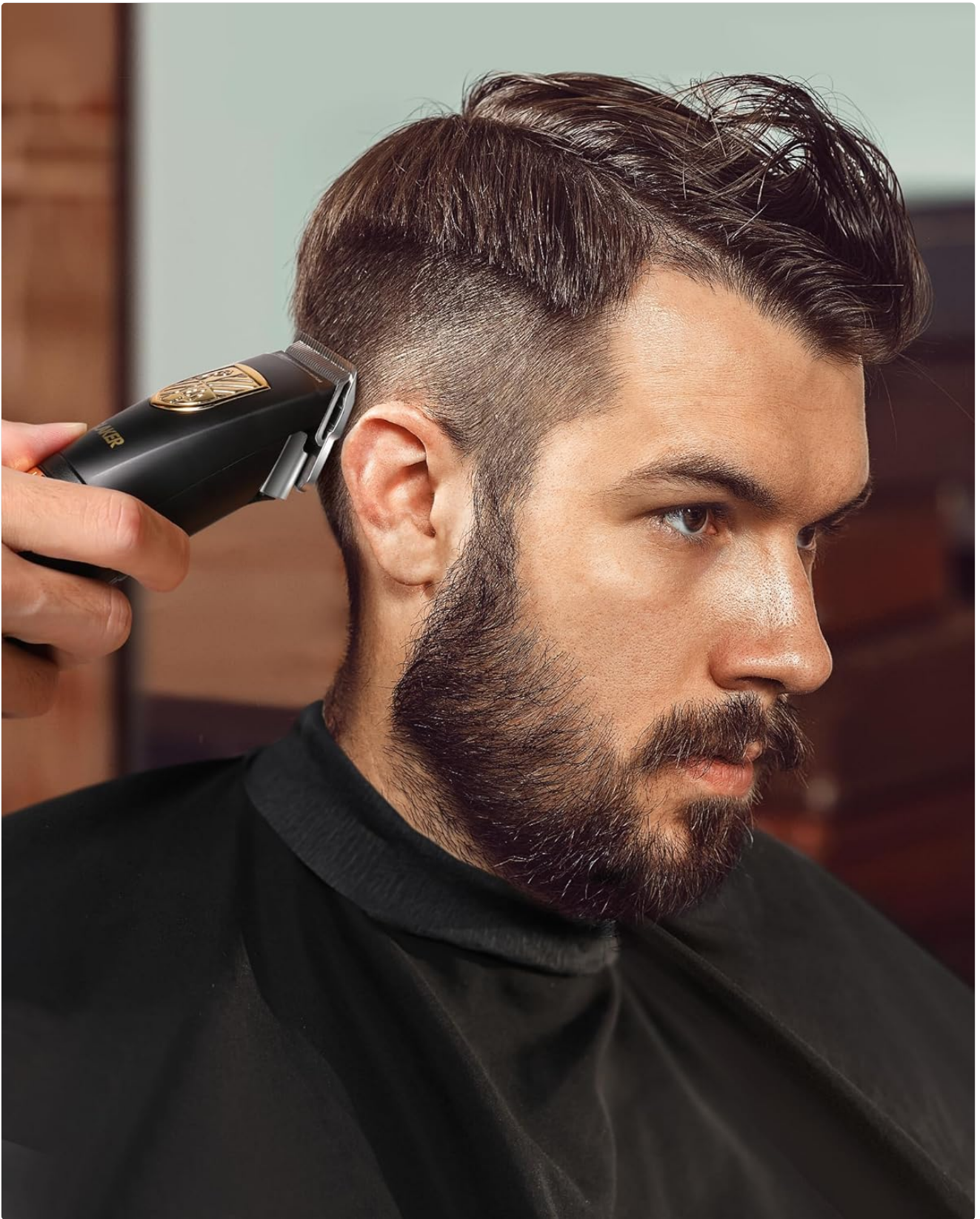
Image: A man demonstrating self-haircutting with the GLAKER hair clipper, highlighting its ease of use for personal grooming.