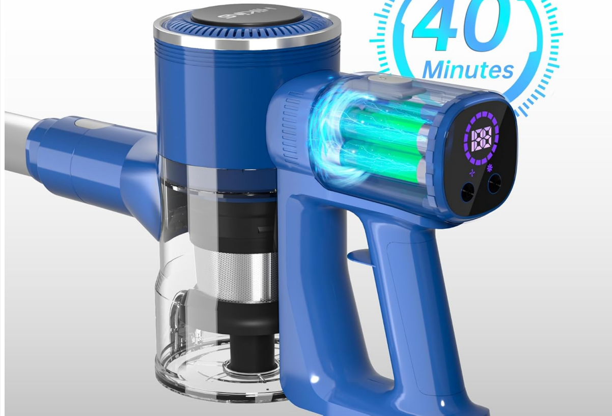
Image: A close-up of the vacuum's main unit, displaying battery charge level and indicating a charging time of approximately 4-5 hours for up to 40 minutes of runtime.