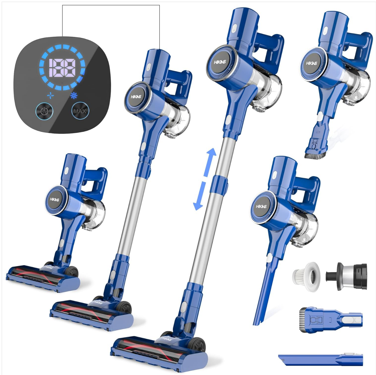
Image: All components of the HiKiNS Cordless Stick Vacuum Cleaner, including the main unit, various attachments, and charging cable.