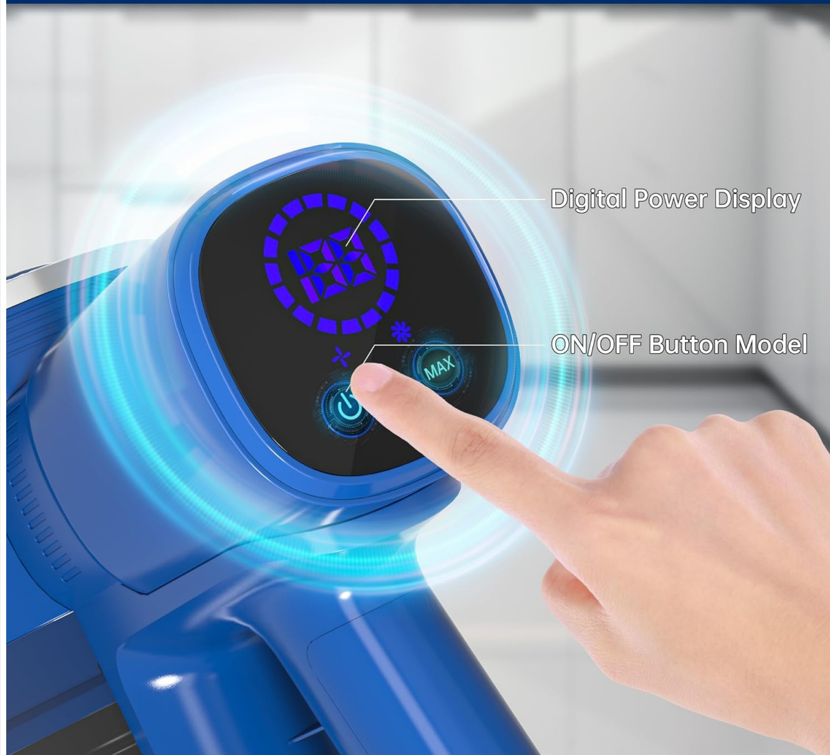
Image: A detailed view of the vacuum's smart touchscreen display, indicating the digital power display and the ON/OFF button for operation.