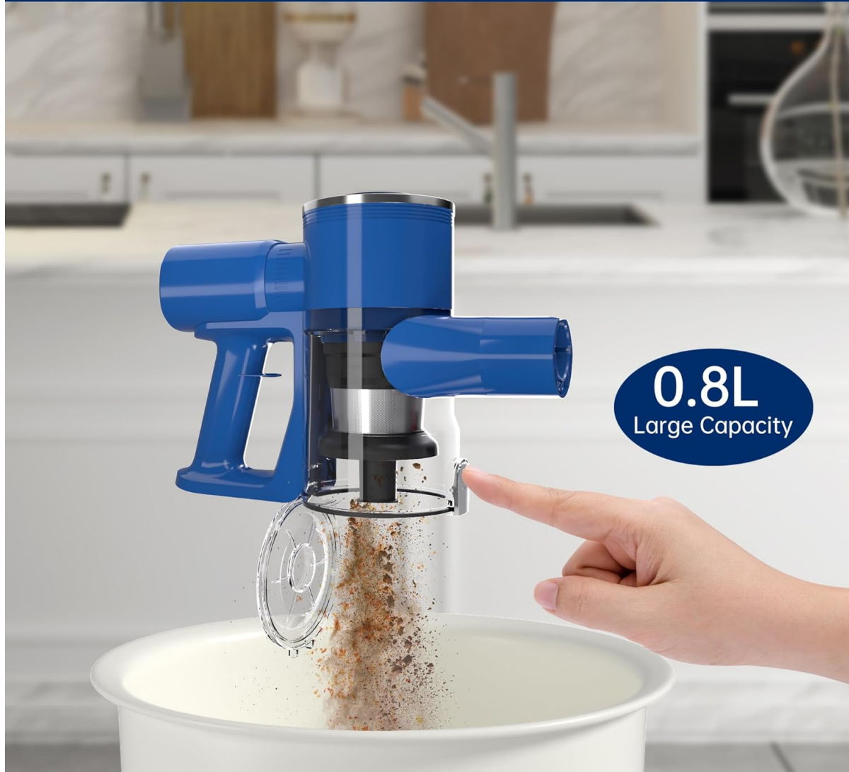
Image: A hand demonstrating the one-click release mechanism to empty the 0.8L large capacity dust bin into a waste container.