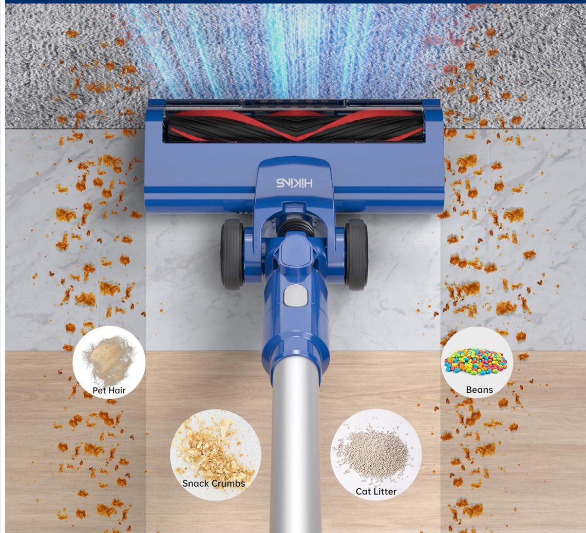
Image: The vacuum cleaner head effectively picking up various types of debris from a floor surface, highlighting its 12000Pa suction power.