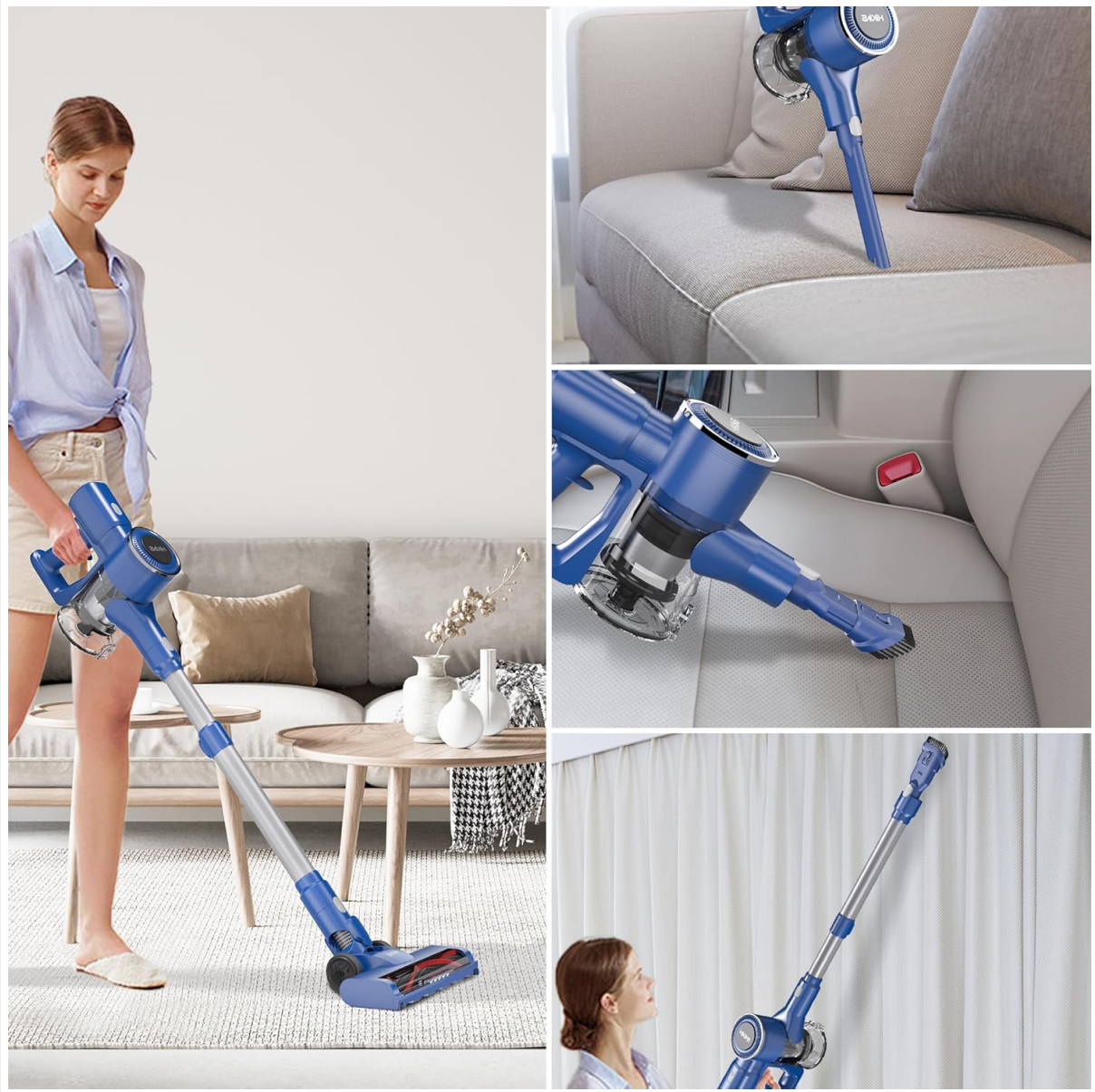
Image: A collage showing the vacuum in different configurations: as a stick vacuum for floors, a handheld vacuum for upholstery, and with an extended wand for high-reach areas like curtains.