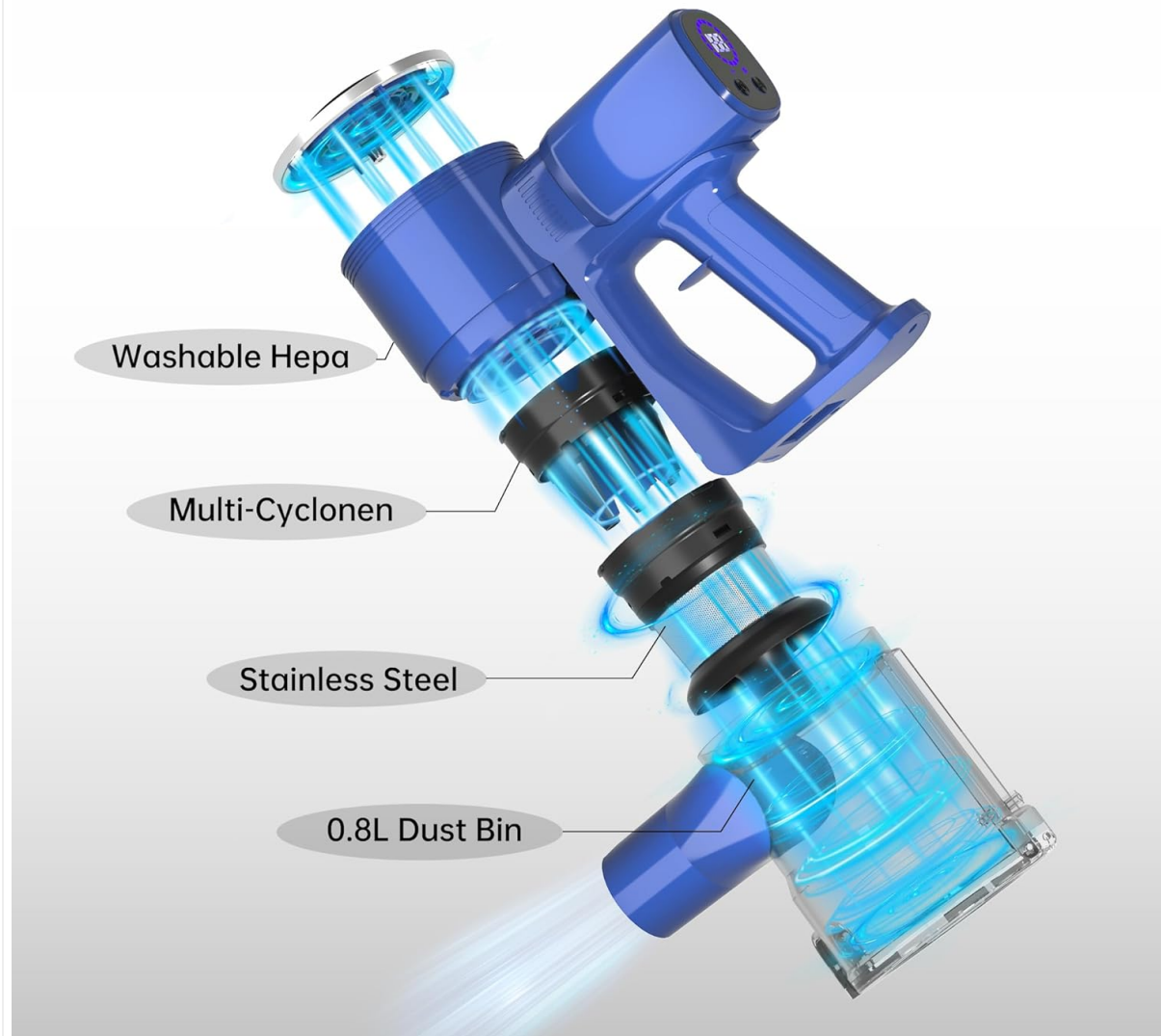
Image: An illustration showing the internal components of the vacuum's filtration system, detailing the washable HEPA filter, multi-cyclone separation, stainless steel filter, and the 0.8L dust bin.