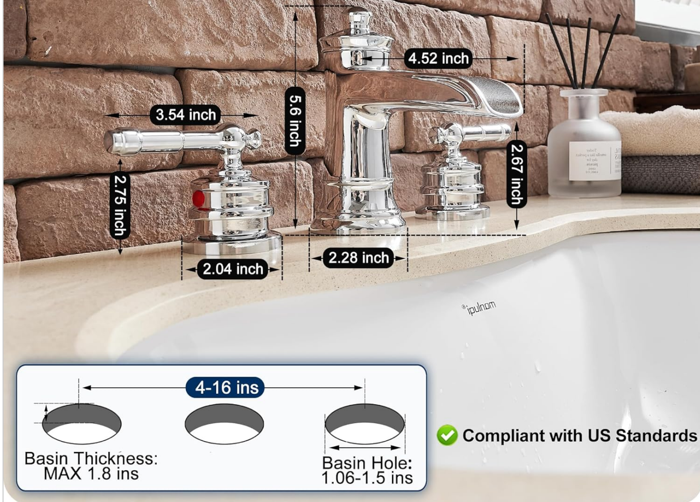
Image: Visual guide for DIY installation, including dimensions and compliance with US standards for 3-hole sinks.