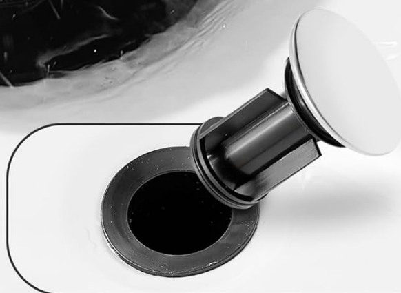
Image: Detailed view of the pop-up drain, emphasizing its design for easy cleaning and prevention of water accumulation.