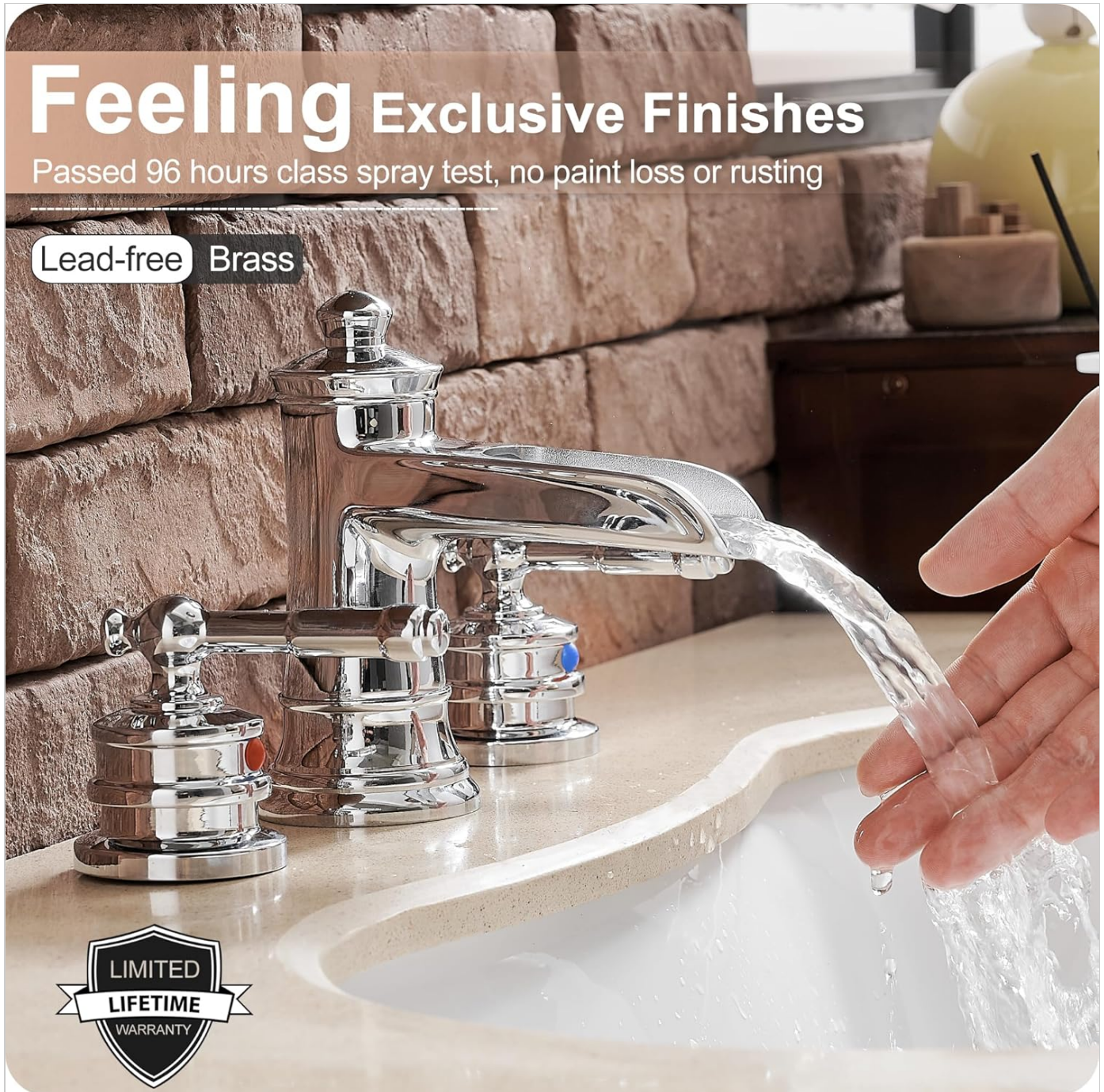
Image: Showcases the exclusive finish of the faucet, emphasizing its resistance to corrosion and ease of cleaning.

Video: Highlights the spout's 3-layer metal filter design, contributing to water quality and ease of maintenance.