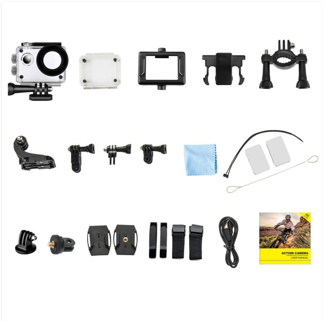
Image: A comprehensive display of all accessories included with the AUSEK 4K Action Camera, such as various mounts, straps, cables, and the waterproof case, alongside the camera itself and the user manual.