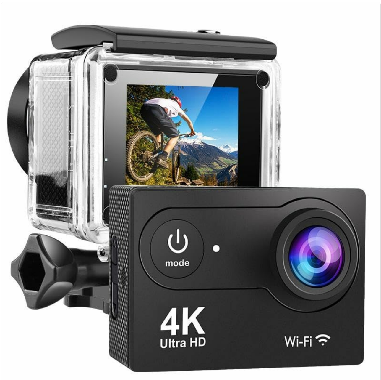
Image: The AUSEK UltraHD 4K Action Camera, shown with its transparent waterproof housing and a separate view of the camera itself, highlighting its compact design and 4K Ultra HD and Wi-Fi capabilities.