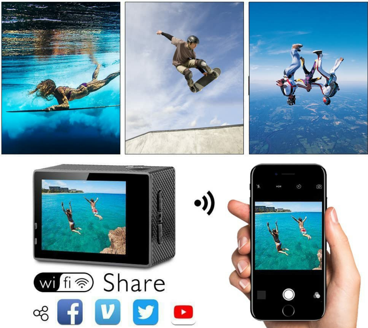
Image: An illustration showing the AUSEK 4K Action Camera's Wi-Fi sharing capability, allowing users to instantly review and share videos and photos on social media via a mobile phone. Examples of shared content include underwater footage, skateboarding, and skydiving.

Real-time review videos/photos on mobile and instantly share on social media