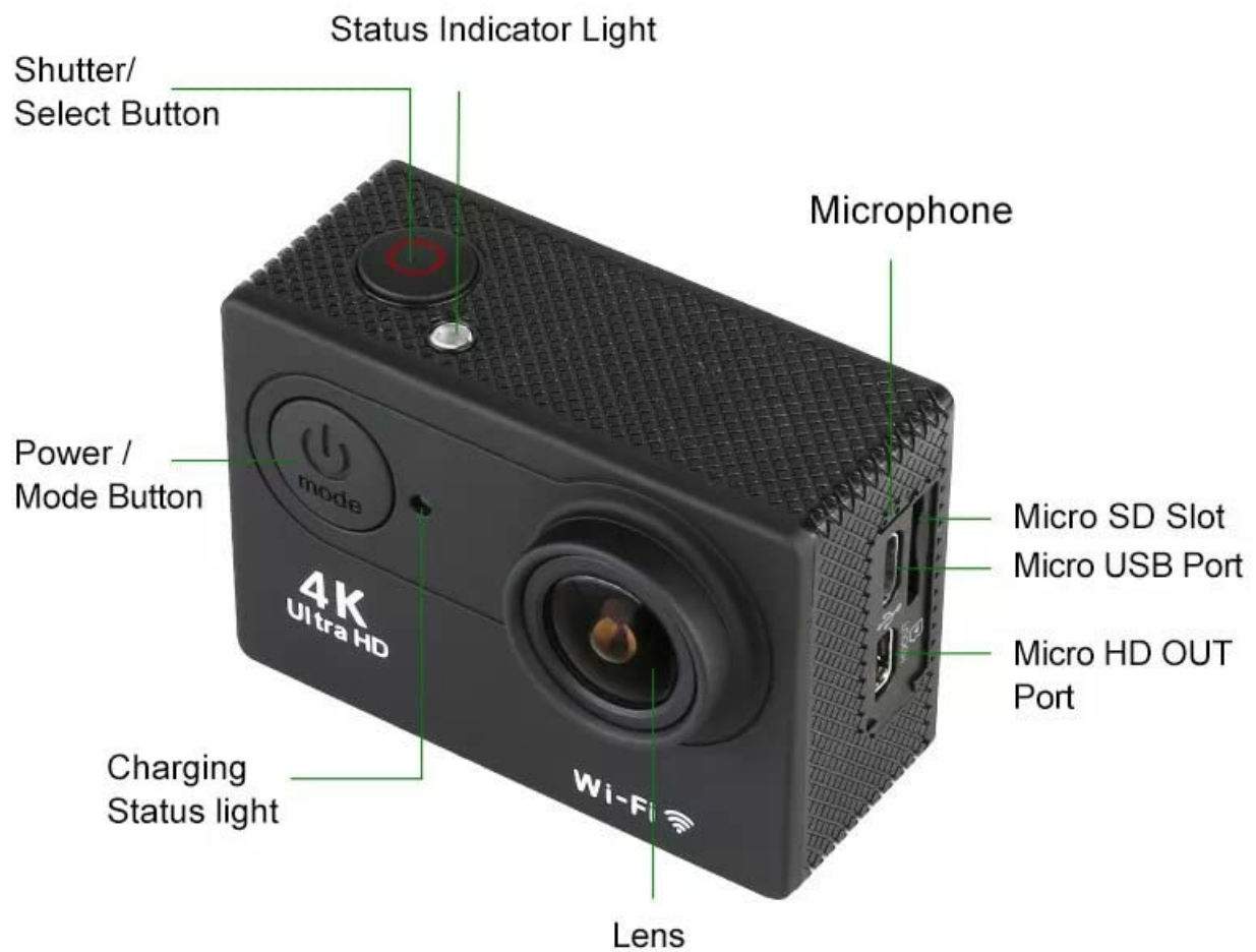
Image: A detailed diagram of the AUSEK 4K Action Camera, labeling its various components including the Power/Mode Button, Shutter/Select Button, Status Indicator Light, Microphone, Lens, Charging Status Light, Micro SD Slot, Micro USB Port, and Micro HD OUT Port.