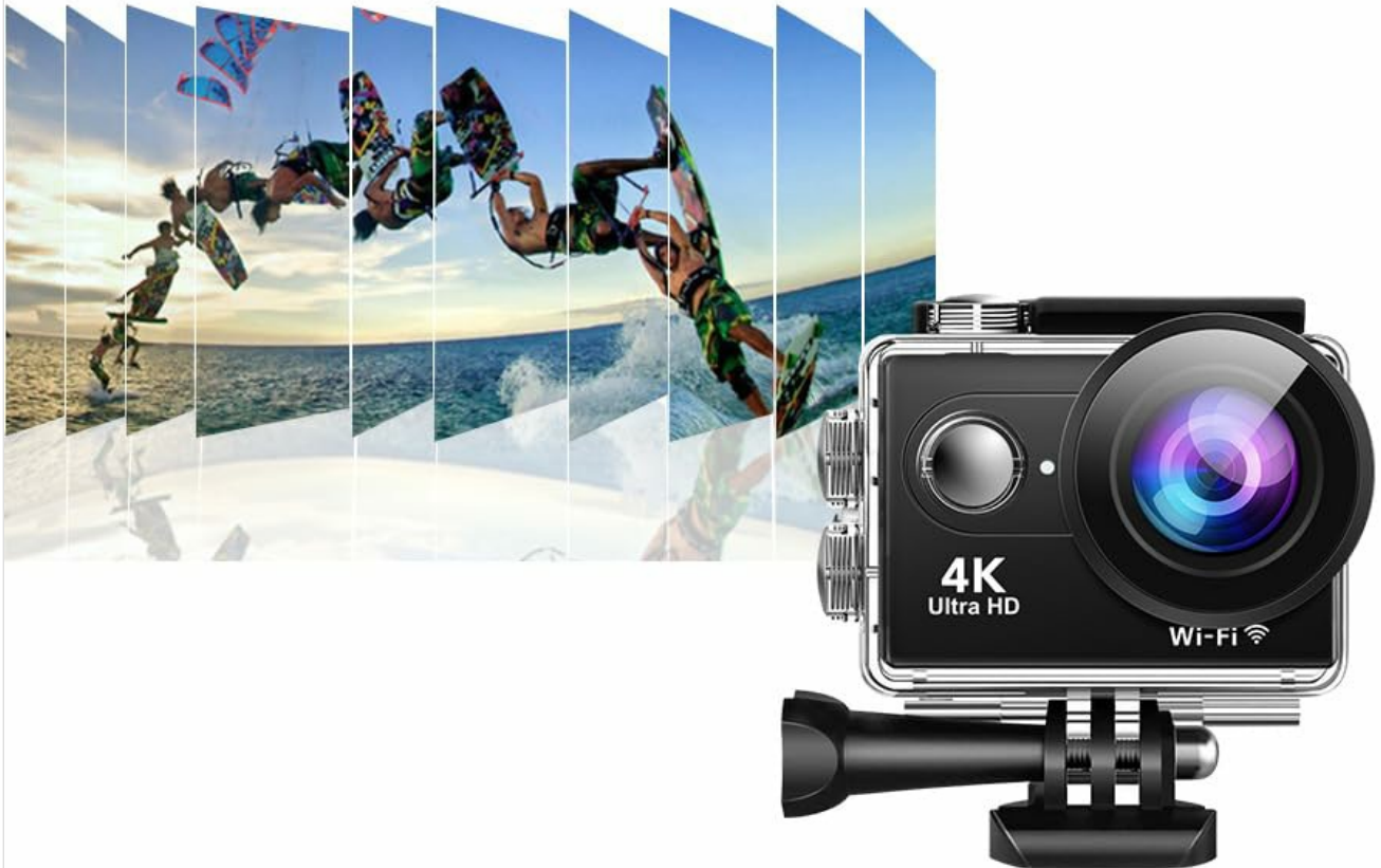
Image: An illustration showcasing the multiple photo shooting modes available on the AUSEK 4K Action Camera, including Timed Snapshot (3s/5s/10s/20s), Auto Snapshot (3s/10s/15s/20s/30s), and Drama Shot (3P/S, 5P/S, 10P/S), with a visual representation of burst photography.

Timed Snapshot (3s/5s/10s/20s) Auto Snapshot (3s/10s/15s/20s/30s) Drama Shot (3P/S,5P/S,10P/S)