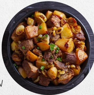
STEAK & POTATO ROAST