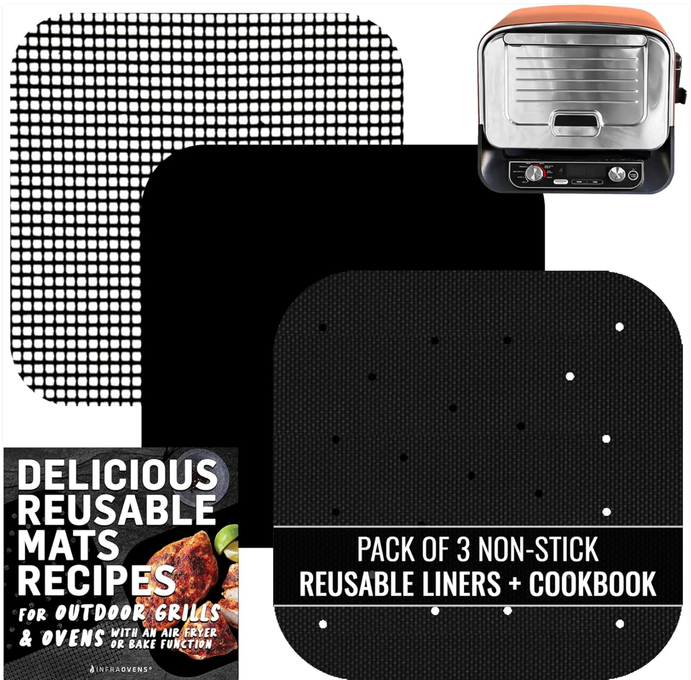
Image: The complete set of INFRAOVENS reusable liners, including the perforated mat, solid liner, mesh mat, and recipe booklet, alongside a Ninja Woodfire Outdoor Oven.