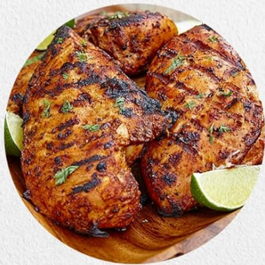
MARINATED BBQ CHICKEN

CONTAINS RECIPES AND INSTRUCTIONS TO MAKE AMAZING MEALS USING YOUR REUSABLE MATS