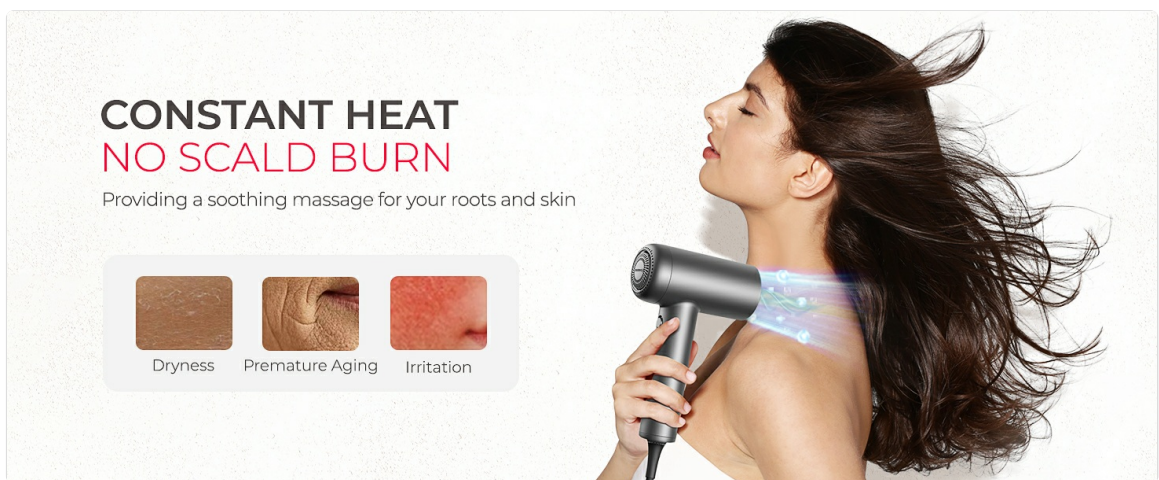
Image: A woman showcasing hair with increased smoothness, shine, and volume due to negative ion technology.