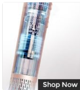
Image: A visual representation of the hair dryer's closed filter design.