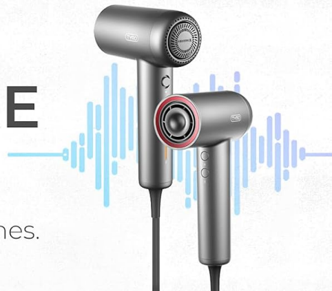
Image: Close-up view of the hair dryer's handle, showing the power button and heat/speed adjustment controls.

Brushless motor minimizes noise to 69 dB , providing a quieter drying experience for you and your loved ones.