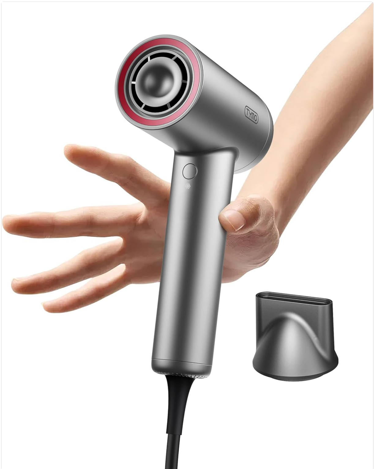
Image: The TYMO AIRHYPE Lite Ionic Hair Dryer in its sleek silver design.