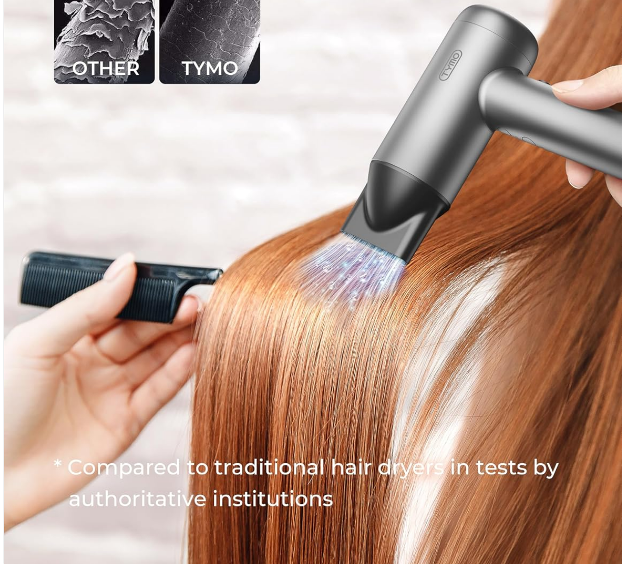
Image: The hair dryer with the concentrator nozzle attached, ready for use.