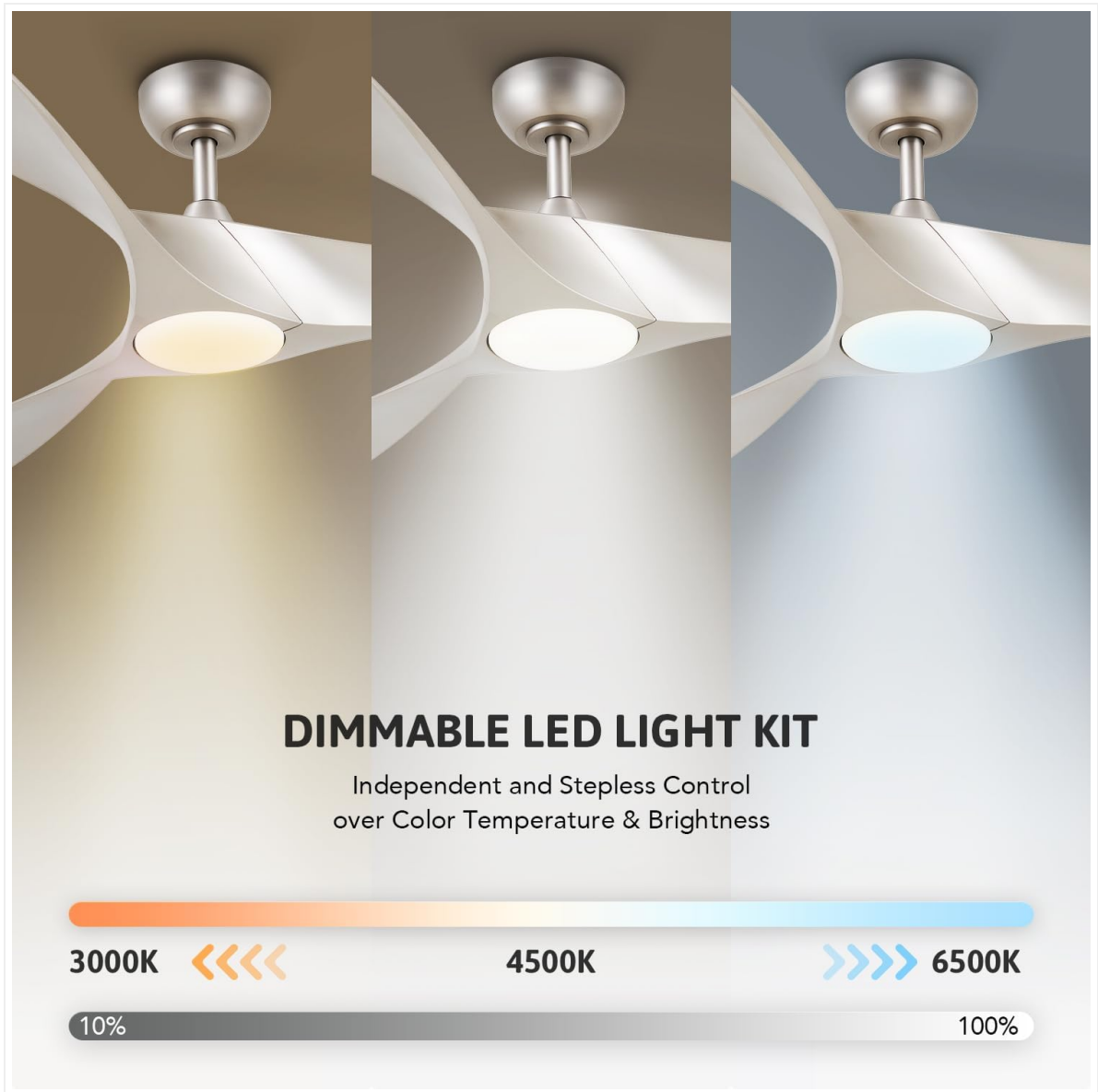
Figure 5.3: Stepless dimming and color temperature adjustment.