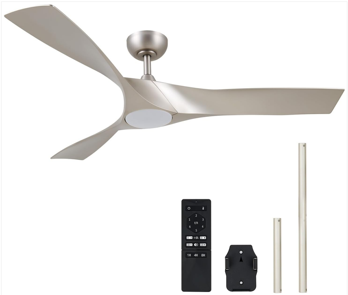
Figure 2.1: Overview of the VONLUCE 52-inch Ceiling Fan components, including the motor, three ABS blades, remote control, and two downrod options.