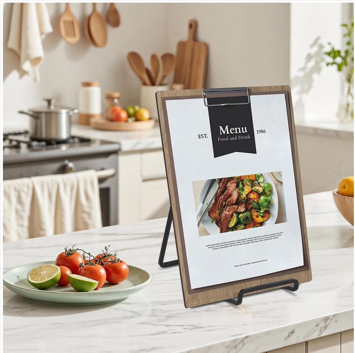
Image: The display stand holding a menu board on a kitchen countertop, demonstrating its practical application.