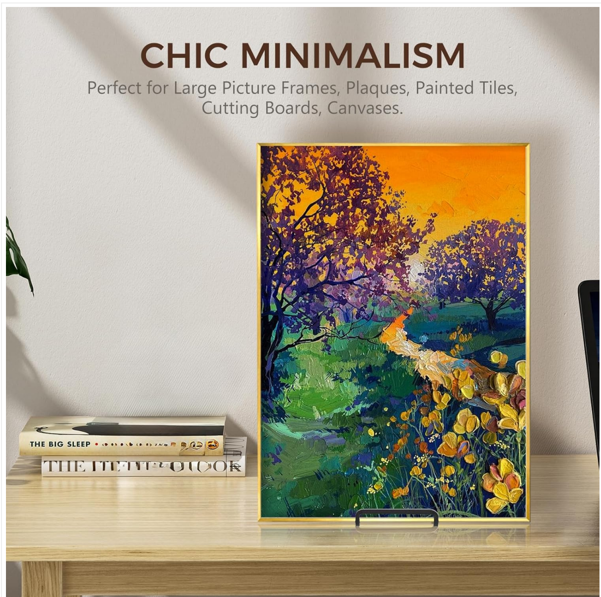
Image: A painting displayed on the stand, illustrating its use for various art pieces.