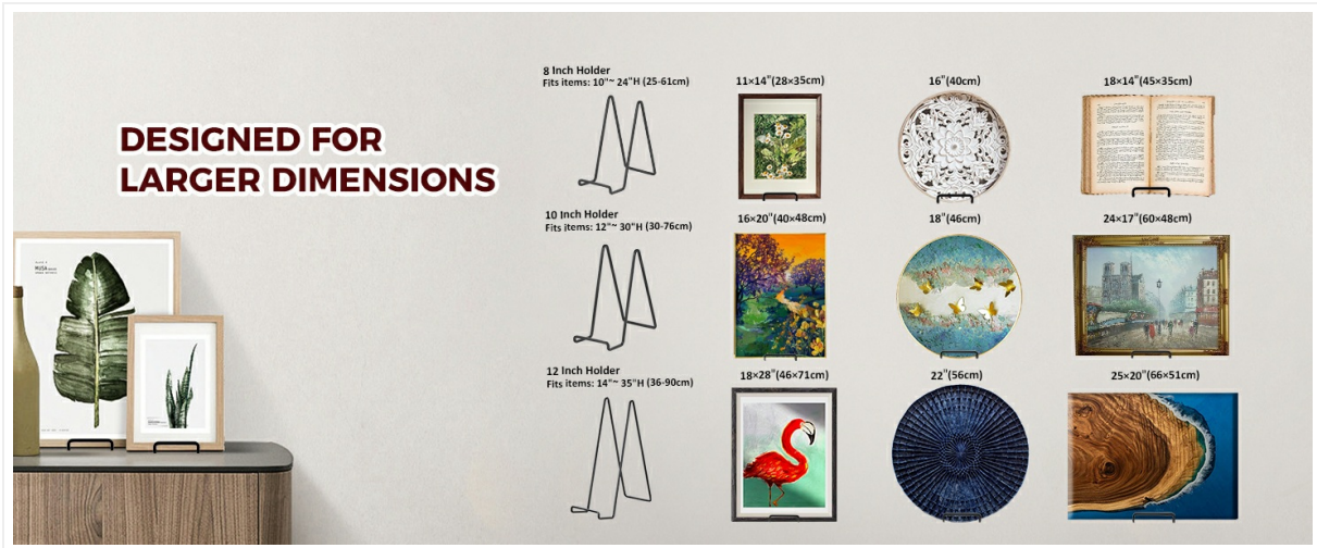
Image: A visual comparison of various display stand sizes, showing the range of items they can accommodate.