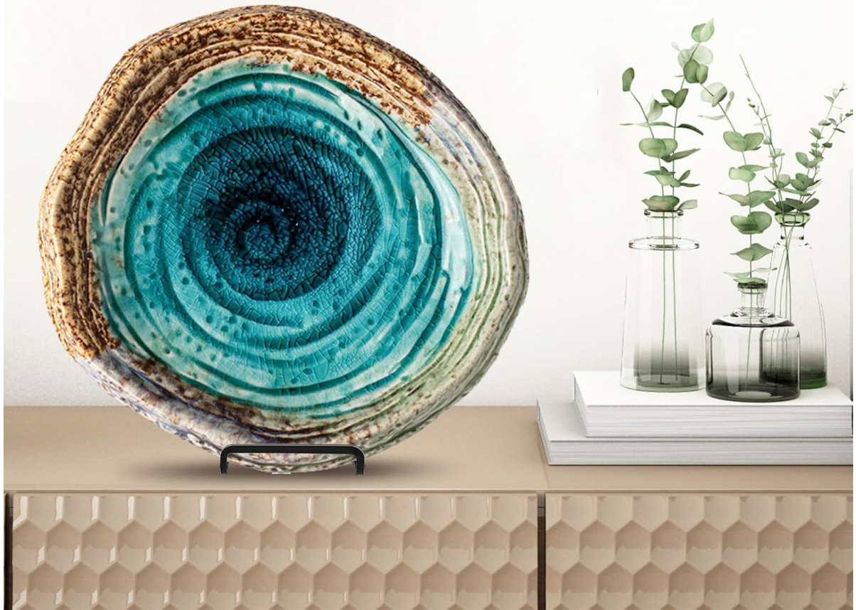
Image: A decorative platter displayed on the stand, highlighting its use for larger, heavier items.

Ideal for 12" ~ 30" Large Heavy Plates, Platters