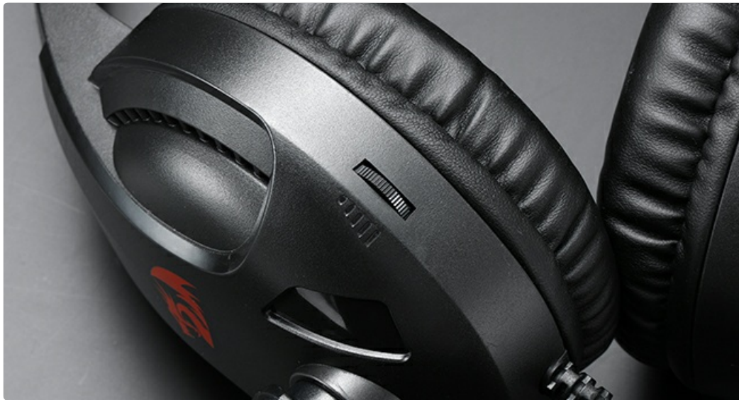
Image: Close-up view of the volume control wheel located on the left earcup of the Redragon H211 headset.