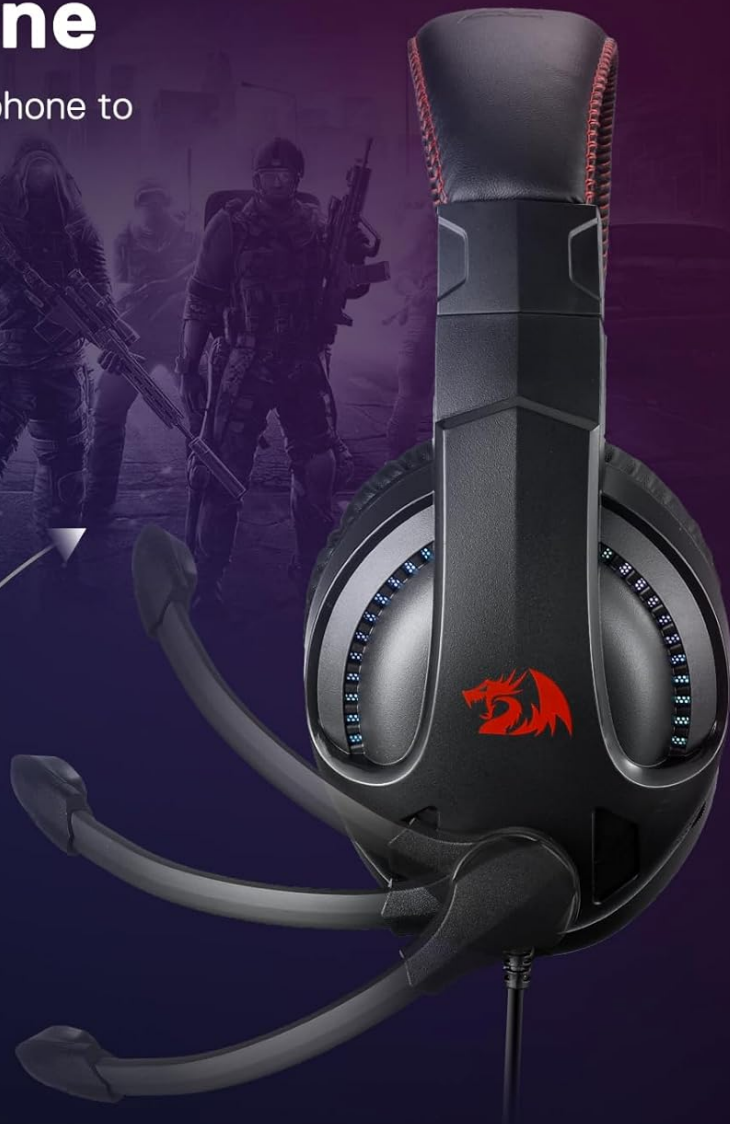
Image: Illustration showing the 120-degree adjustable noise-cancelling microphone of the Redragon H211 headset, designed to pick up voice clearly.