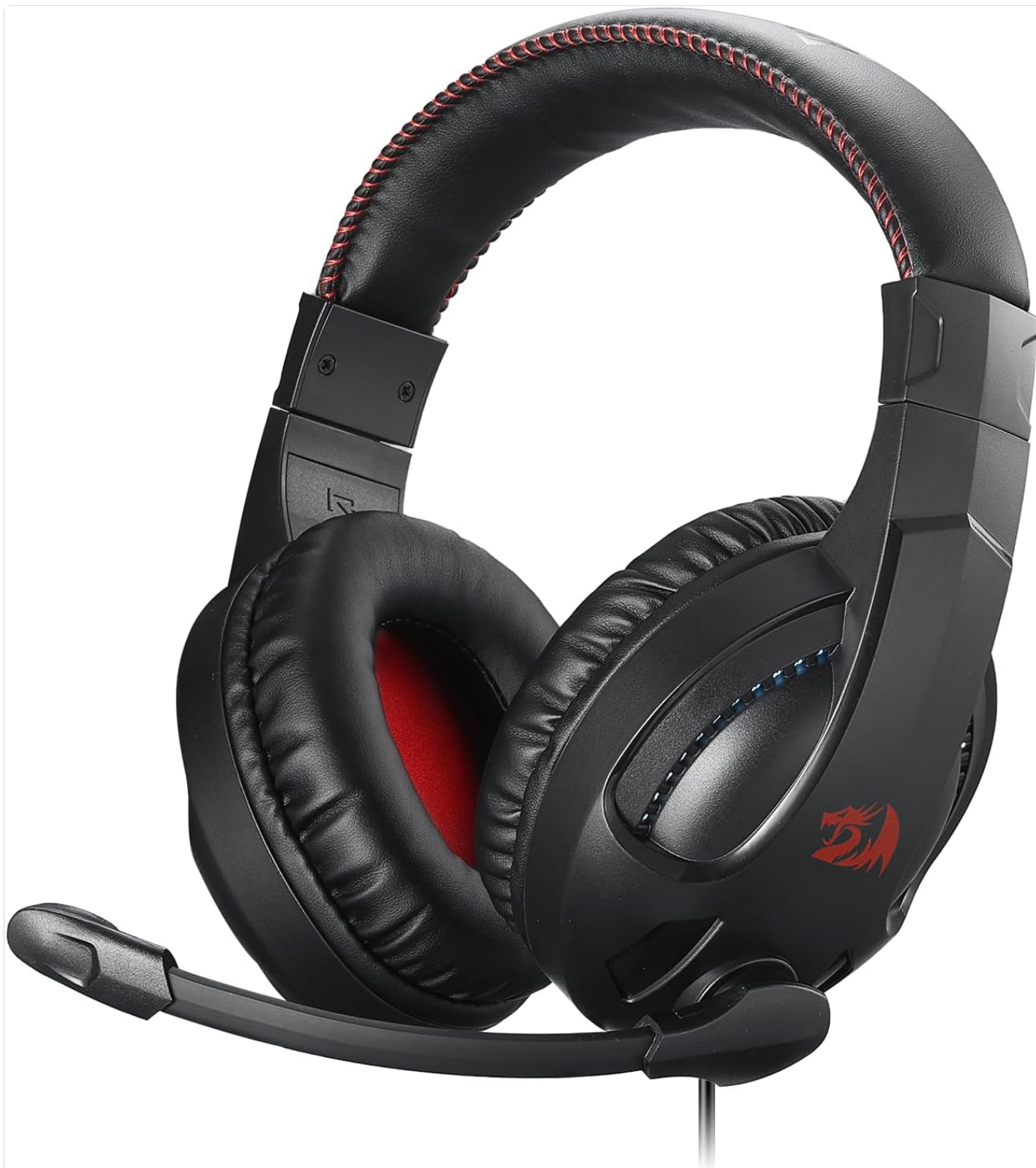
Image: The Redragon H211 Cronus Black Wired Gaming Headset, showcasing its design and features.