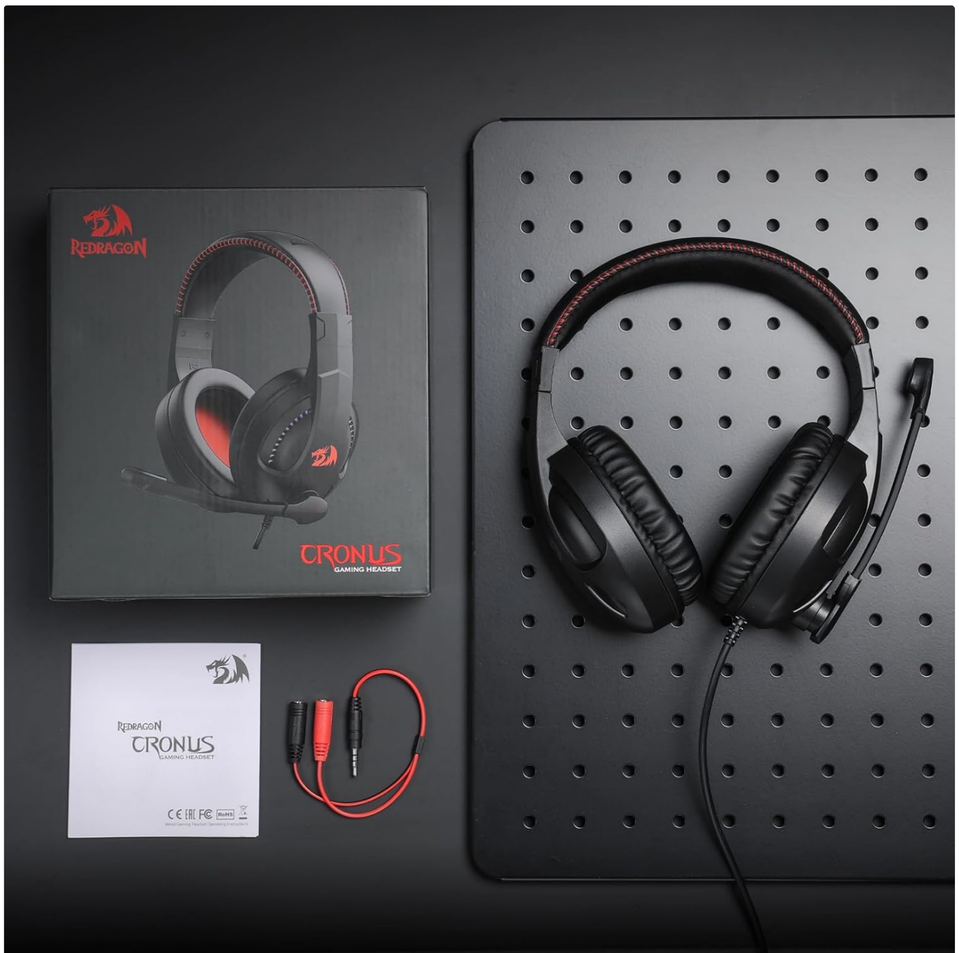
Image: Contents of the Redragon H211 Cronus Gaming Headset package, including the headset, user manual, and audio splitter cable.