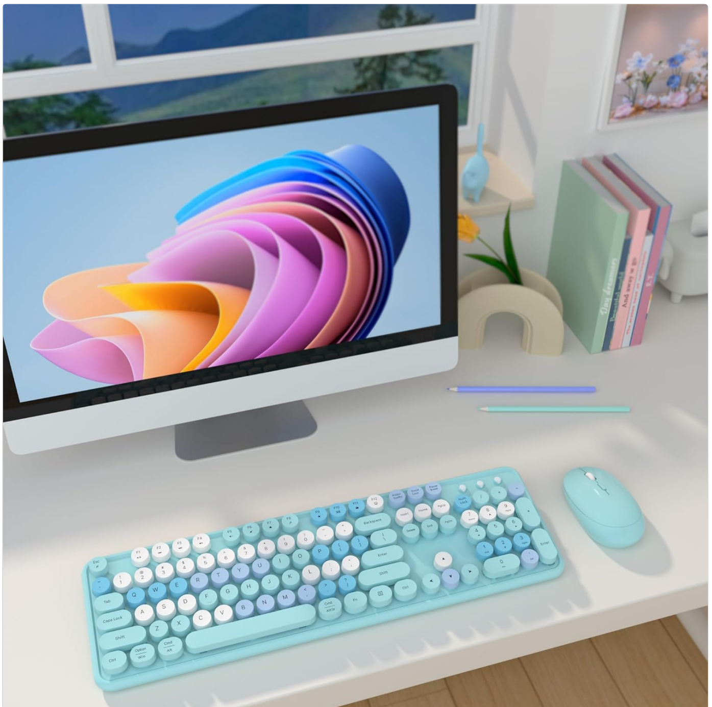
Image: The NEOBELLA wireless keyboard and mouse combo positioned on a desk, ready for use with a computer monitor.