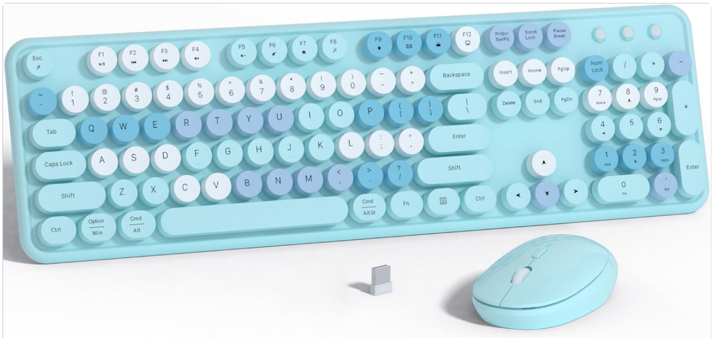
Image: The NEOBELLA Wireless Keyboard and Mouse Combo, showcasing its blue and colorful round keycaps and matching mouse.

Thank you for choosing the NEOBELLA Wireless Computer Keyboard and Mouse Combo. This manual provides detailed instructions for setting up, operating, maintaining, and troubleshooting your new wireless peripheral set. Please read this manual thoroughly before use to ensure optimal performance and longevity of your product.