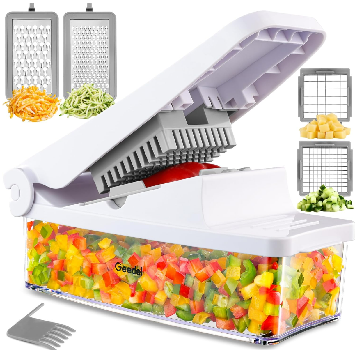
Image: Overview of the Geedel Vegetable Cutter and its included blades and container.