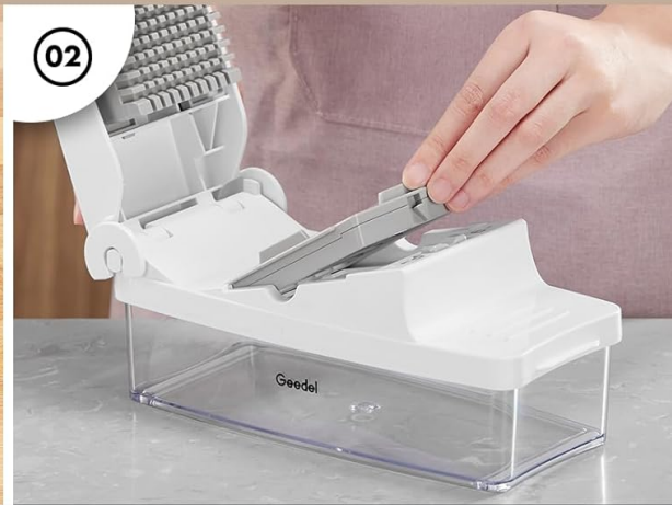
Choose desired blade