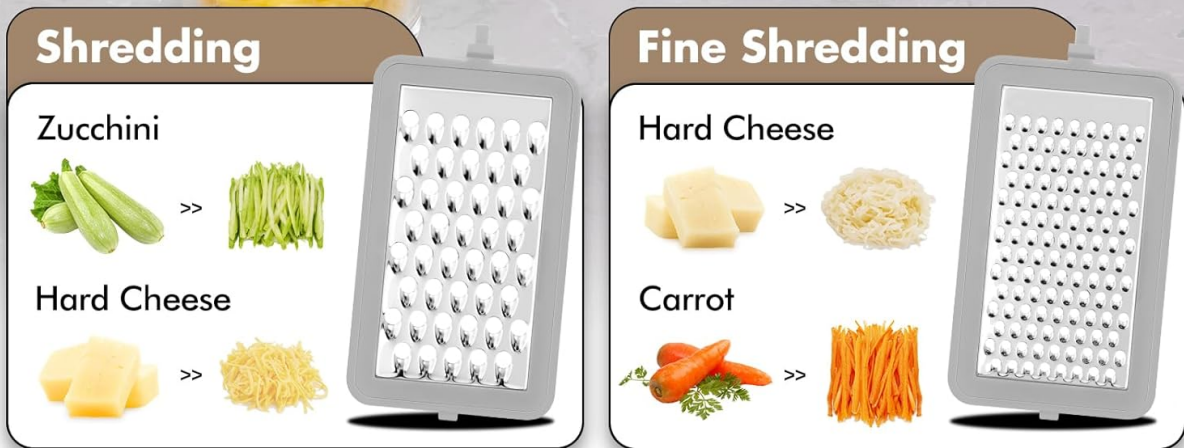
Image: Illustrates the results from the coarse grater (shredding) and julienne (fine shredding) blades.