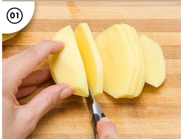
Pre-cut the ingredients