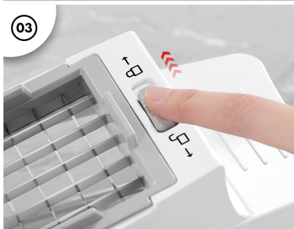
Lock the blade