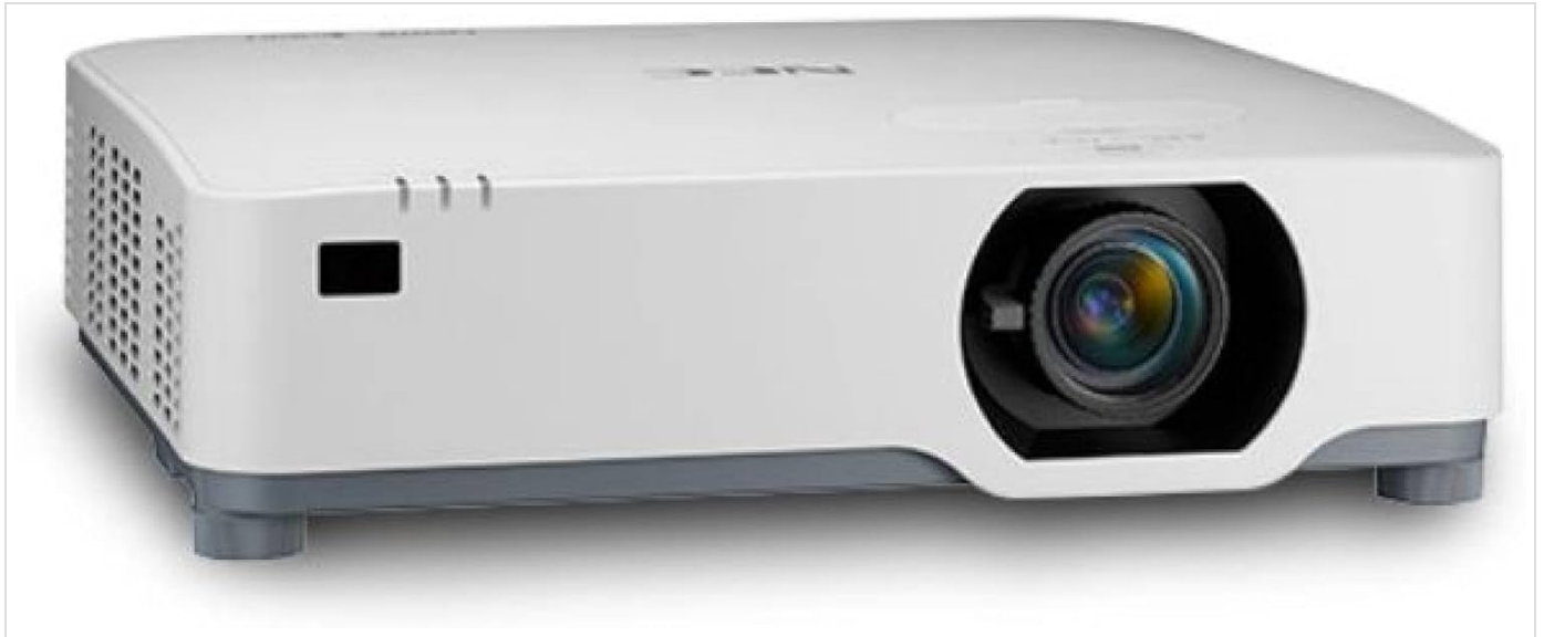
A white NEC Sharp NP-P547UL LCD Projector, viewed from the front-right, showing the lens and ventilation grilles. This image illustrates the general appearance of the projector.

Choose a location that provides the desired screen size and optimal viewing angles.