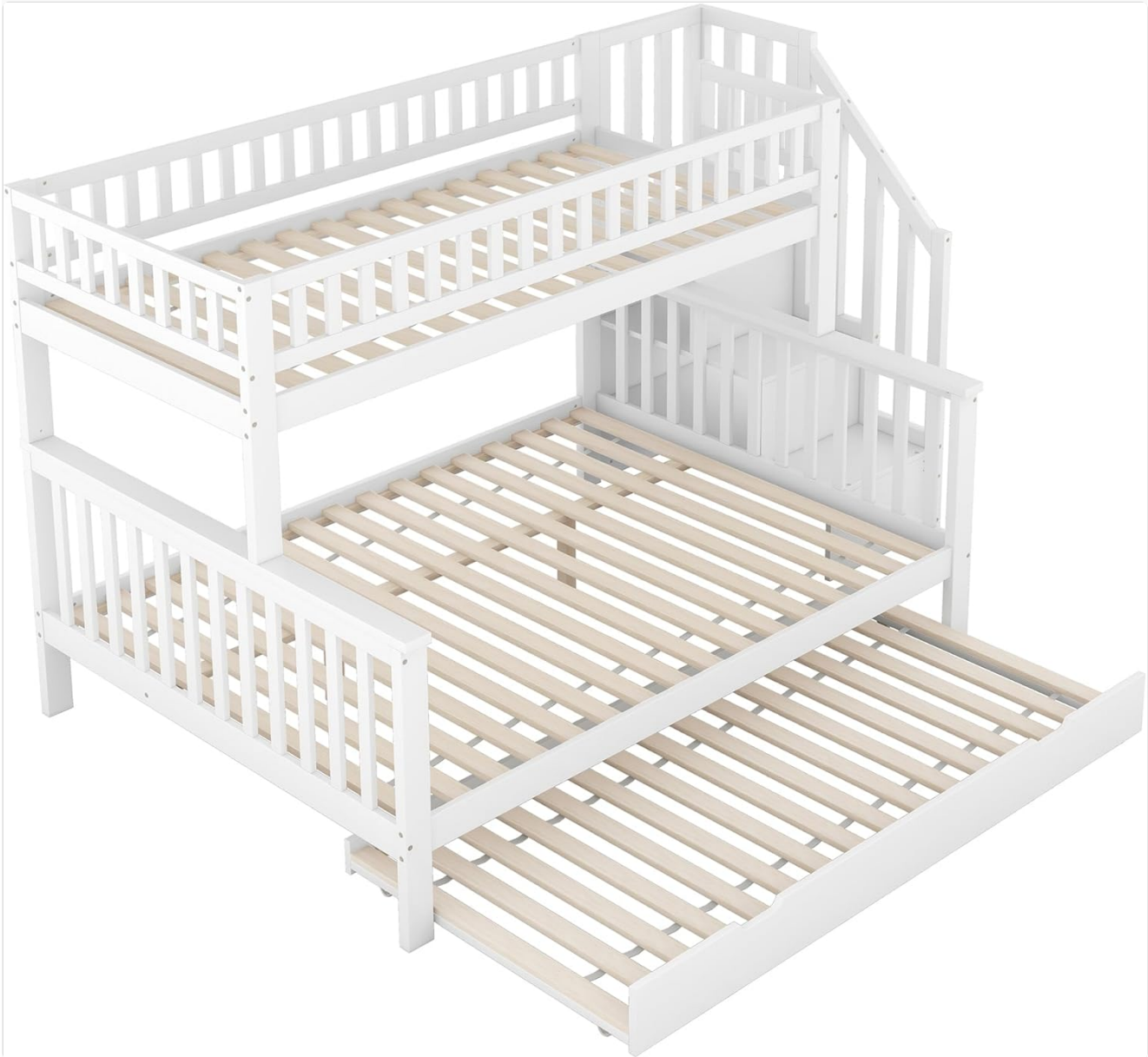
Figure 4: The trundle bed extended from beneath the lower bunk.