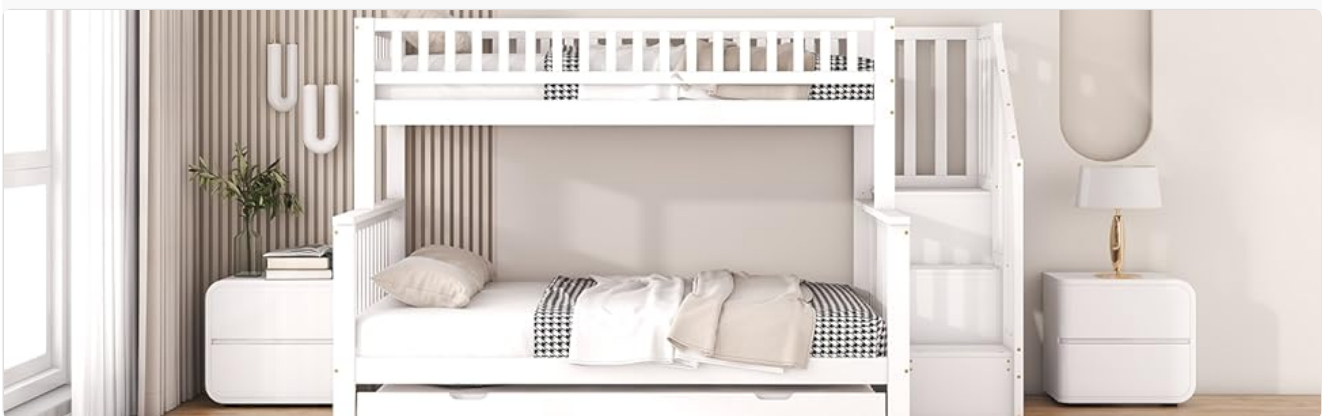
Figure 3: Overview of the bunk bed structure, illustrating the assembly stages.