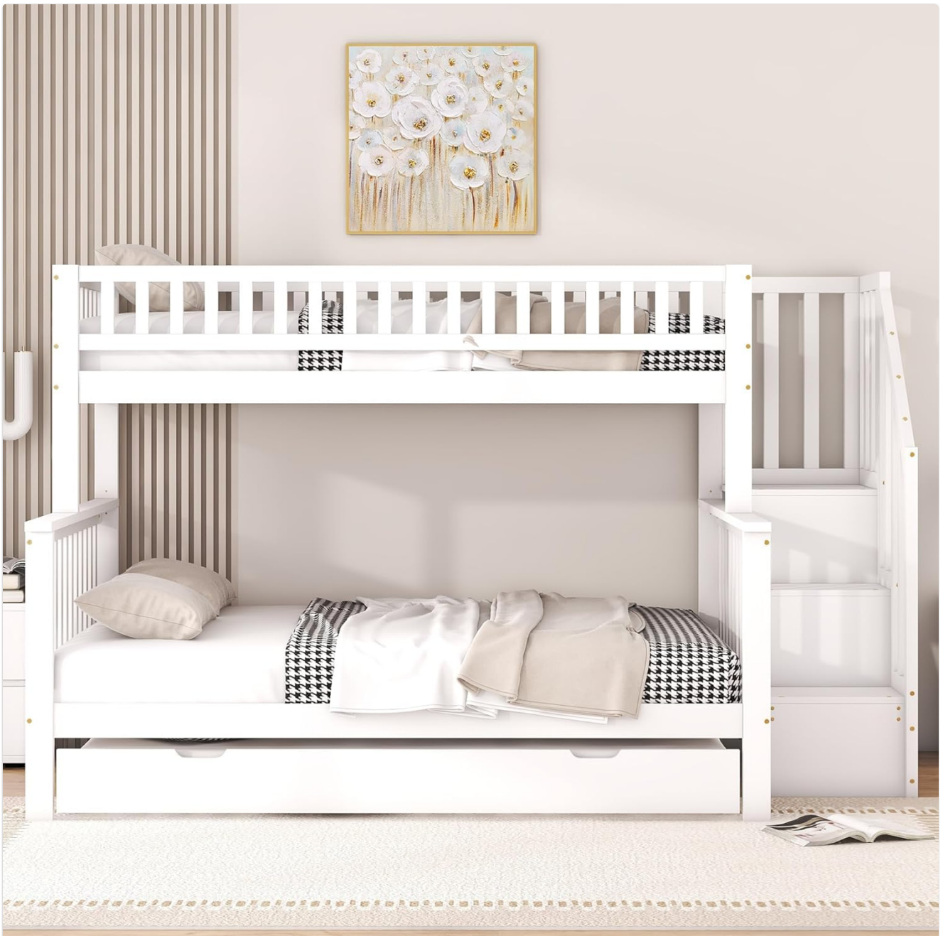
Figure 1: Overall view of the Moimhear Bunk Bed with trundle bed and integrated stairs.