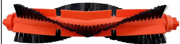
Image: Instructions for restoring bent main brush bristles using hot water.