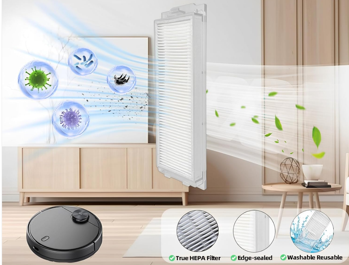
Image: The HEPA filter, designed for high-efficiency particle capture.

Effectively blocks 99.9% of dust, pollen, pet fur dander and any airborne particles as small as 0.1 micrometers