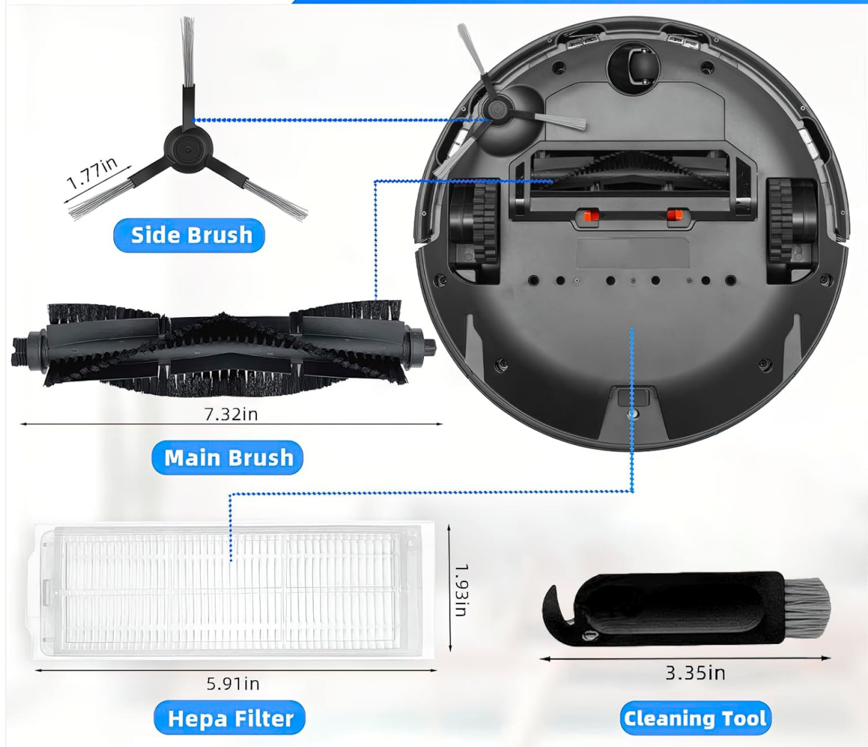
Image: Dimensional overview and compatibility with WYZE Robot Vacuum WVCR200S.