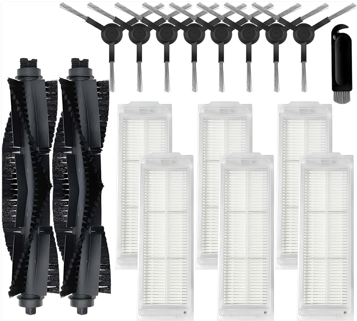
Image: Overview of the HUIZHEN WVCR200S Replacement Accessories Kit components.