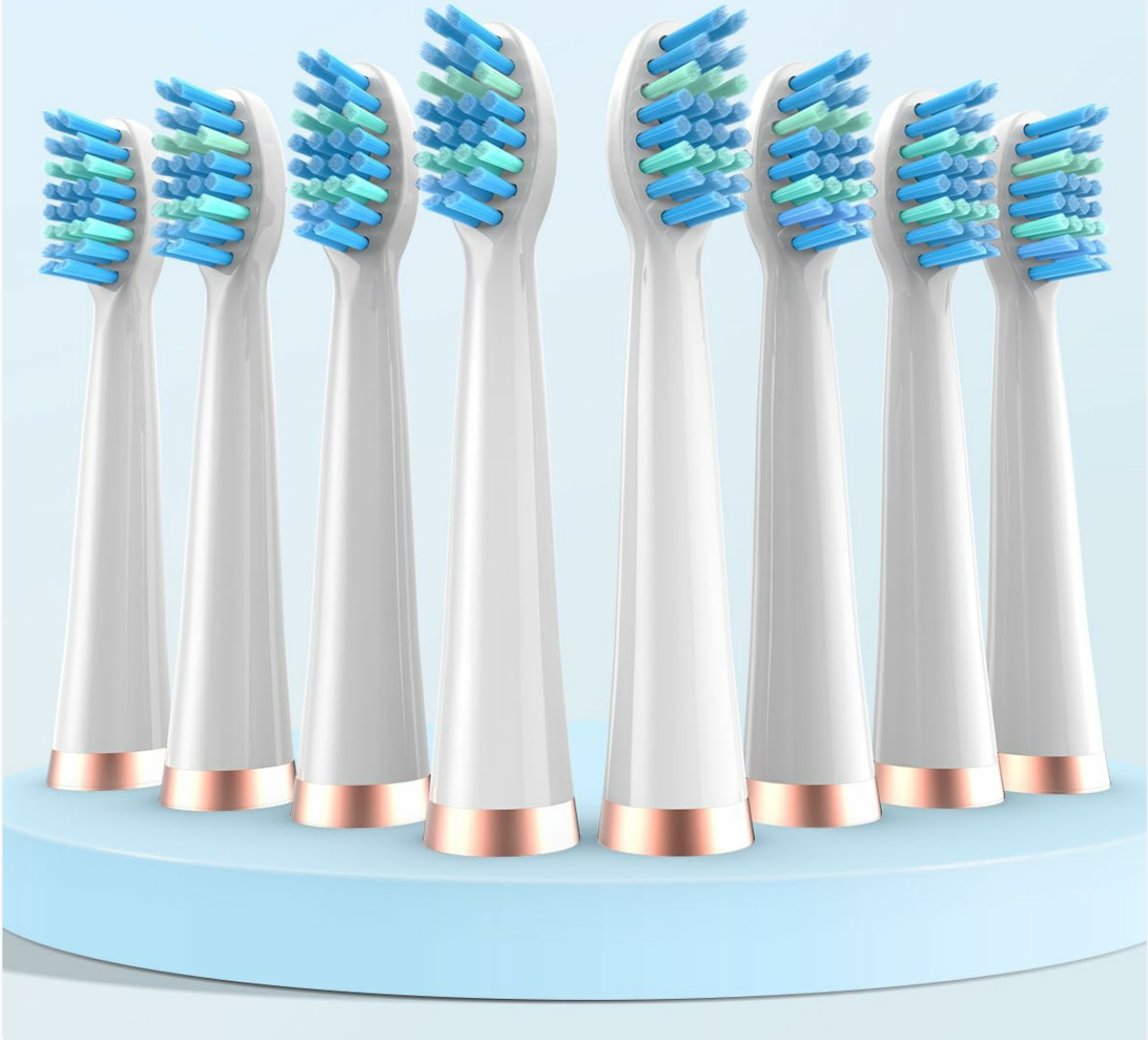
Image: A set of eight replacement brush heads, designed to last for 24 months of regular use.

Dentist suggested changing toothbrush head every 3 months