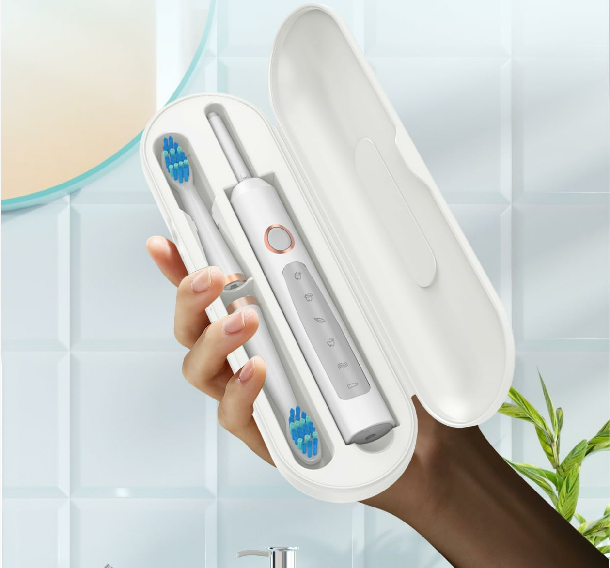
Image: The Coulux electric toothbrush and two brush heads neatly stored within its compact travel case, highlighting its portability.