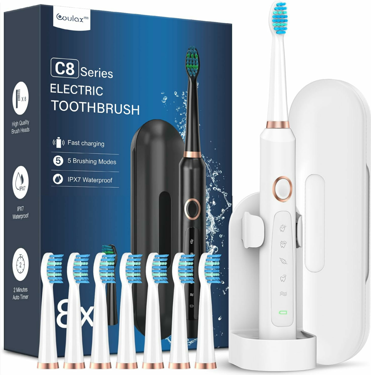
Image: The Coulax Sonic Electric Toothbrush, including the main unit, 8 replacement brush heads, and a protective travel case.