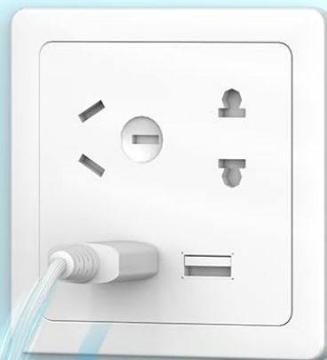
Image: The electric toothbrush connected to a power source for charging, illustrating various charging options like PC, power bank, and phone charger.