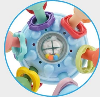
6 Shapes Rings Shape Cognition