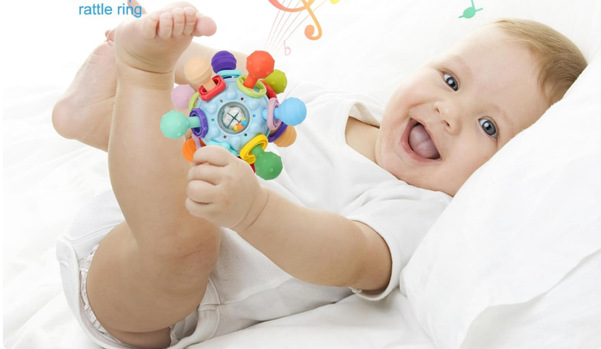
Image: An infant interacting with the toy, showcasing how the multi-shaped rattle ring, 360-degree rotating transparent ball, and twistable components create engaging sounds and movements.