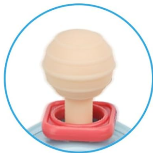
Multi shaped rattle ring