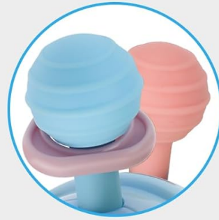
2 Textured Surface Soothe Gums