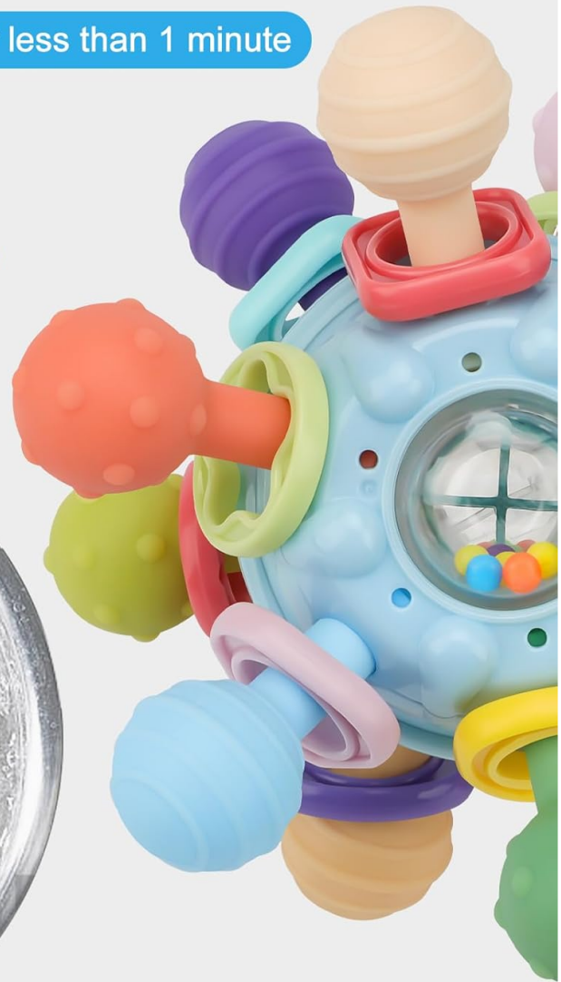
Image: Visual guide to cleaning and disinfecting the toy, illustrating safe methods such as boiling in water for a short duration, steam cleaning, and UV sterilization.