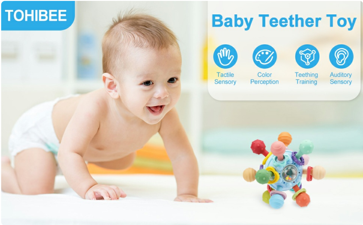
Image: An infant happily playing with the toy, emphasizing the product's adherence to safety standards as indicated by the visible test reports.