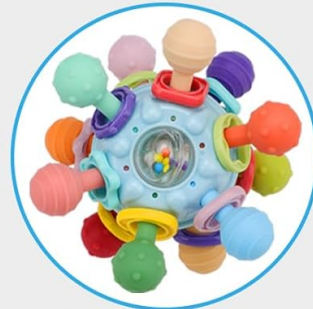
12 Bright Colors Color Recognition