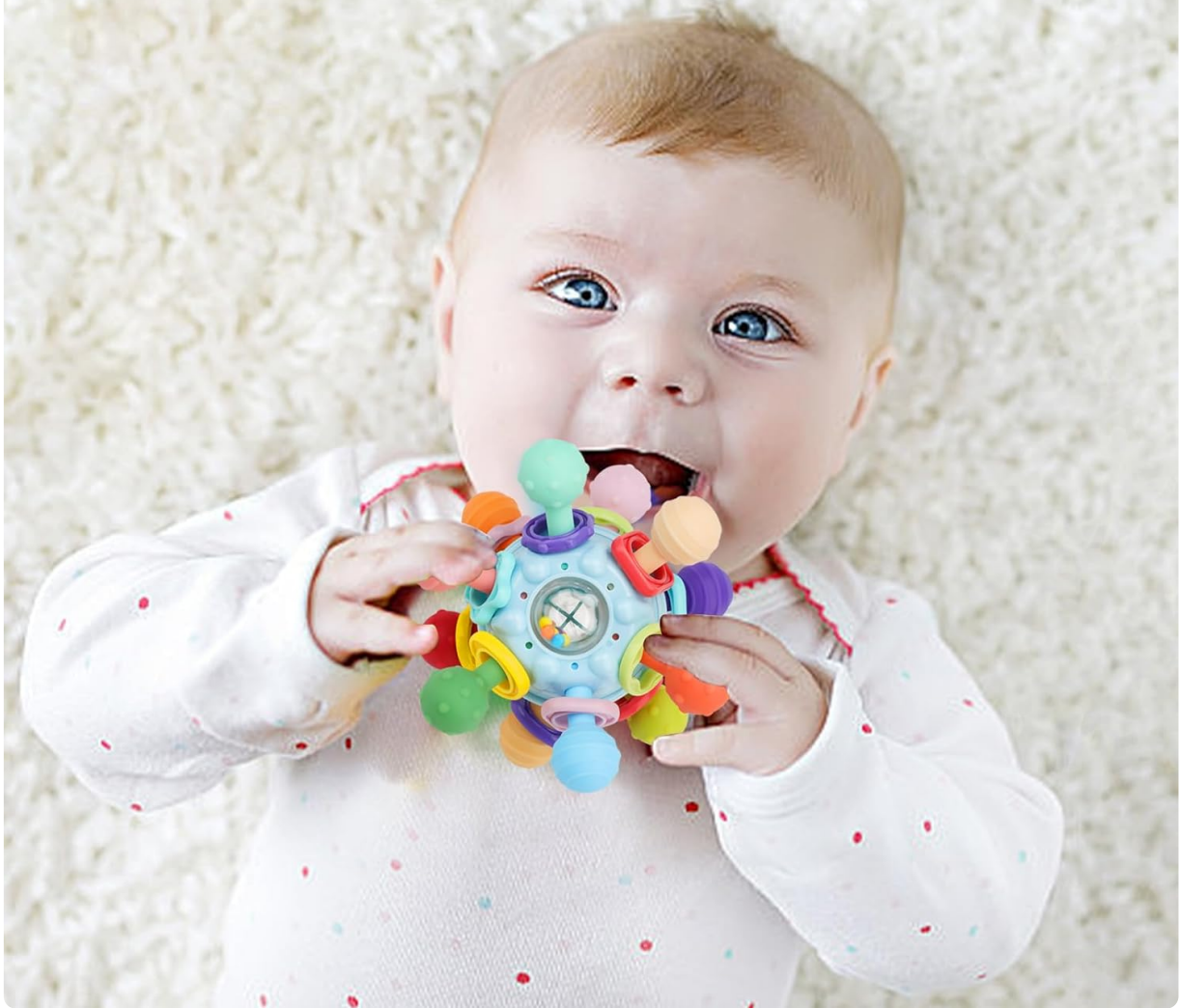
Image: An infant engaging with the teether toy, illustrating how it meets the biological and emotional needs of a baby's oral stage.

Your browser does not support the video tag.