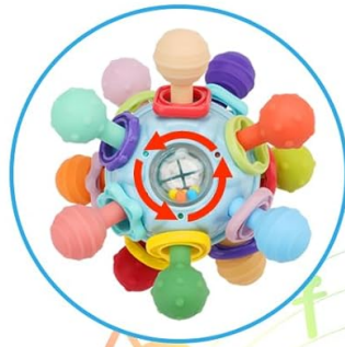
360° rotating transparent ball