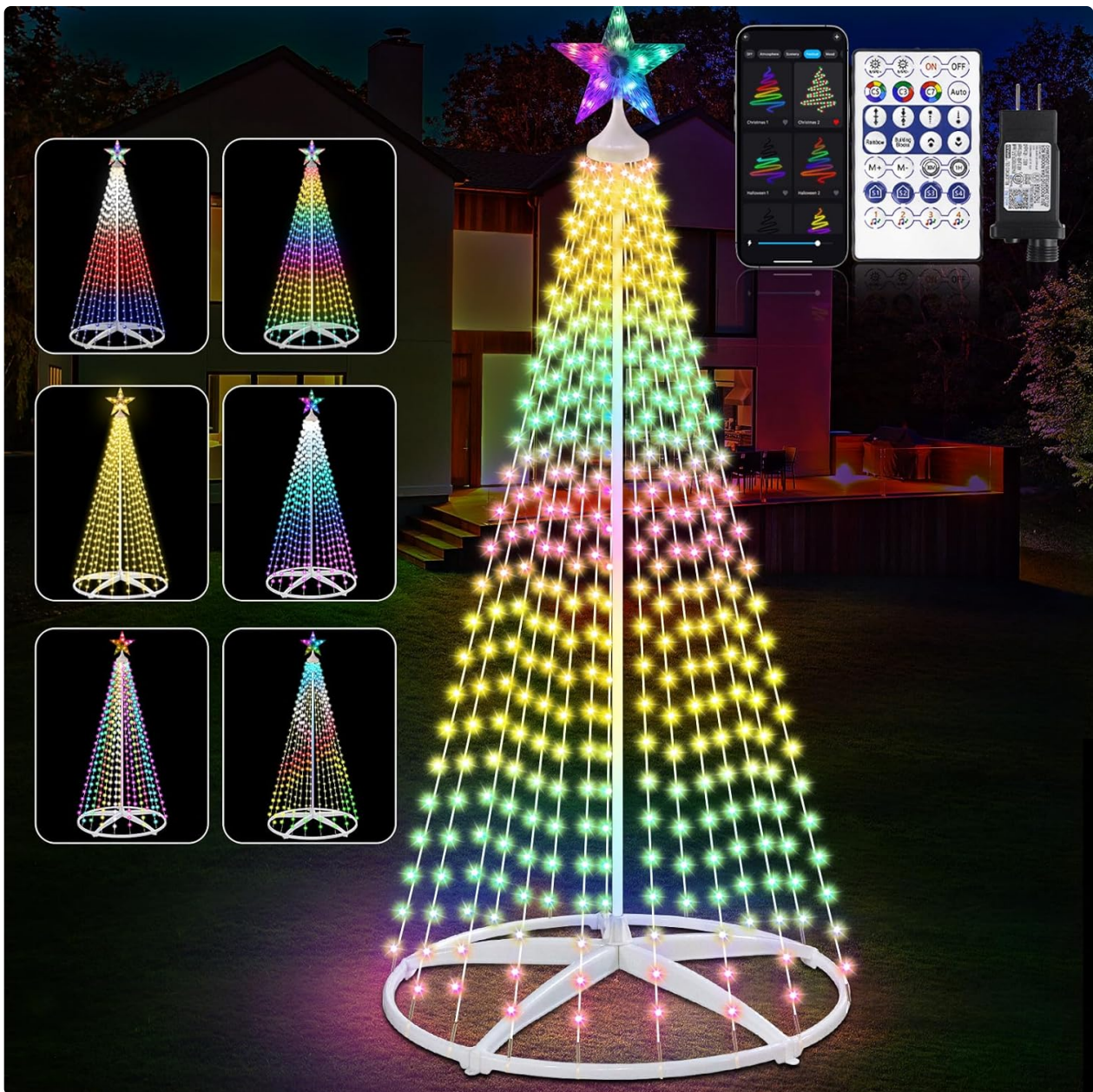
Figure 1: AMIPEPE Smart LED Christmas Cone Tree Light in operation.