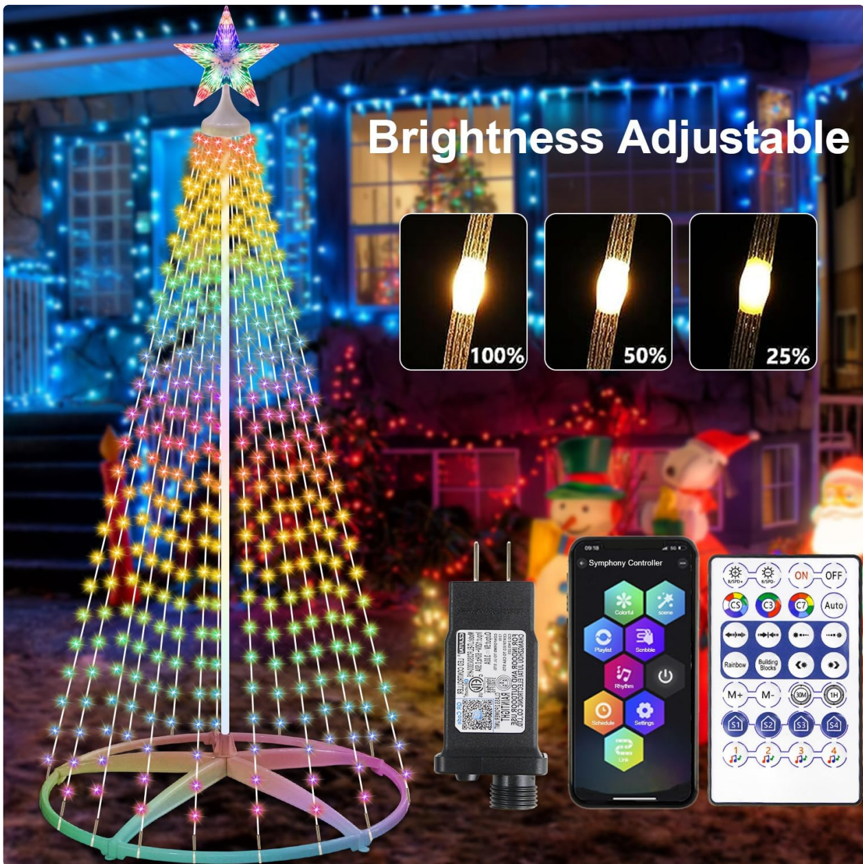
Figure 2: Included components of the LED Cone Tree Light.