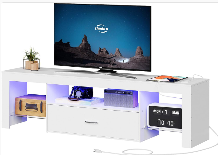
Figure 1: Front view of the HOOBRO LED TV Stand in white, with a television on top and various media devices and decor items in the open

The HOOBRO LED TV Stand (Model WT14UDDS01) is designed to accommodate televisions up to 65 inches, offering a modern aesthetic with practical features. It includes integrated LED lighting with multiple color and mode options, a built-in power strip with AC outlets and USB ports, and various storage solutions.