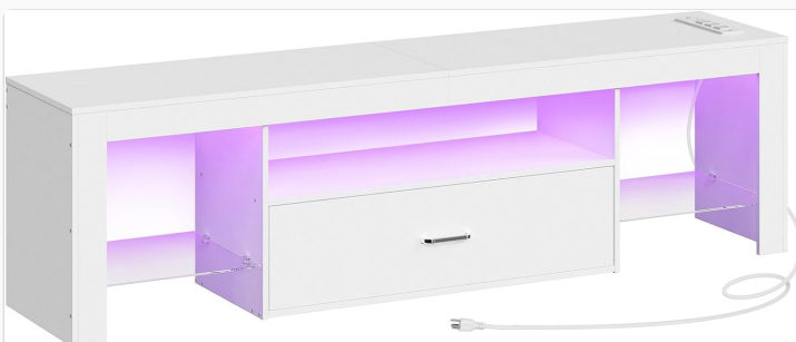
Figure 4: Angled view of the TV stand with purple LED lighting, emphasizing its storage compartments.