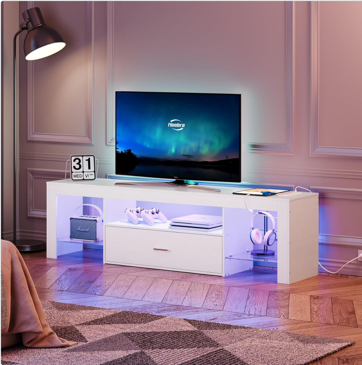
Figure 2: The TV stand in a living room, illuminated by blue LED lights, showcasing its modern design and functionality.