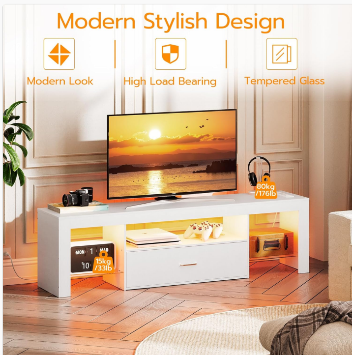
Figure 3: The TV stand with orange LED lights, highlighting the open storage areas and central drawer.