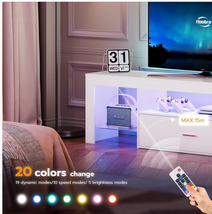
Figure 5: The LED light strip and its remote control for managing colors and modes.