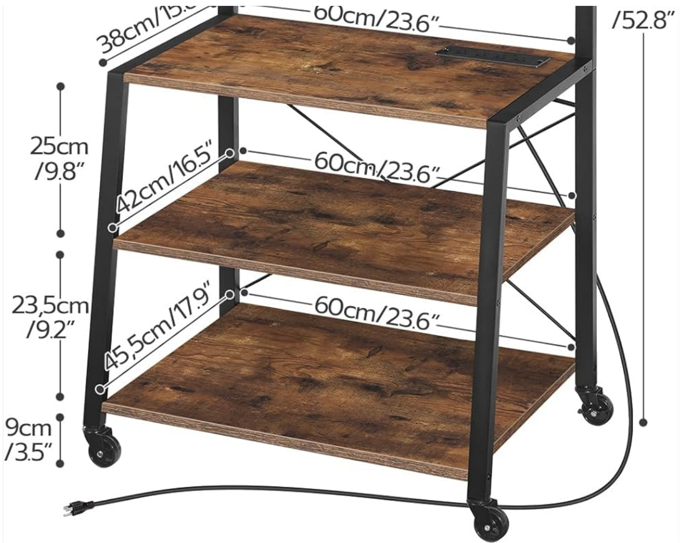
Image 8.1: Detailed dimensions of the TV stand, including shelf heights and overall height with the TV mount.