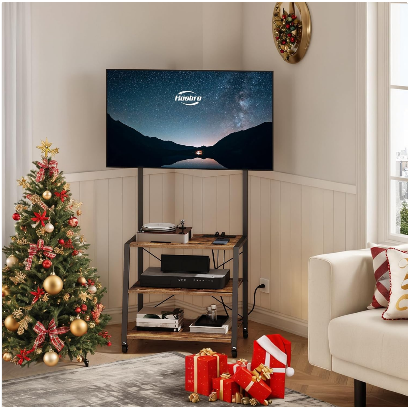
Image 1.1: The HOOBRO Rolling TV Stand in a living room, showcasing its design and functionality with a TV mounted and items on shelves.