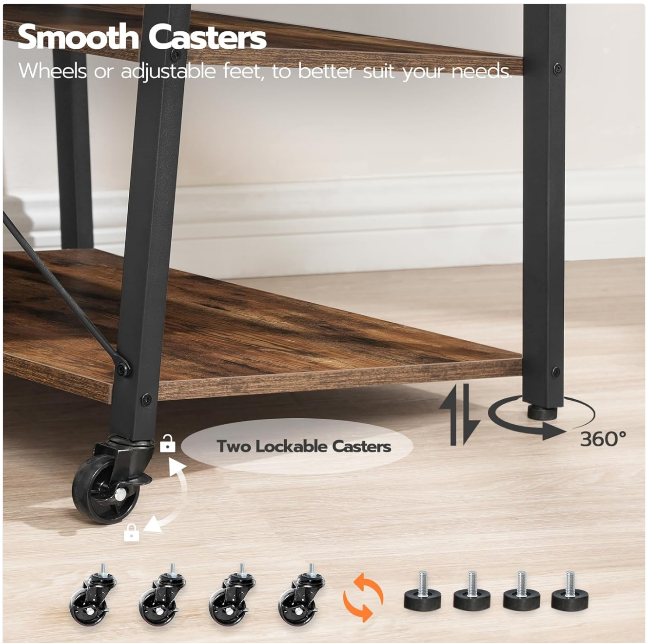
Image 4.1: Detail of the smooth casters and adjustable feet, highlighting the two lockable casters.