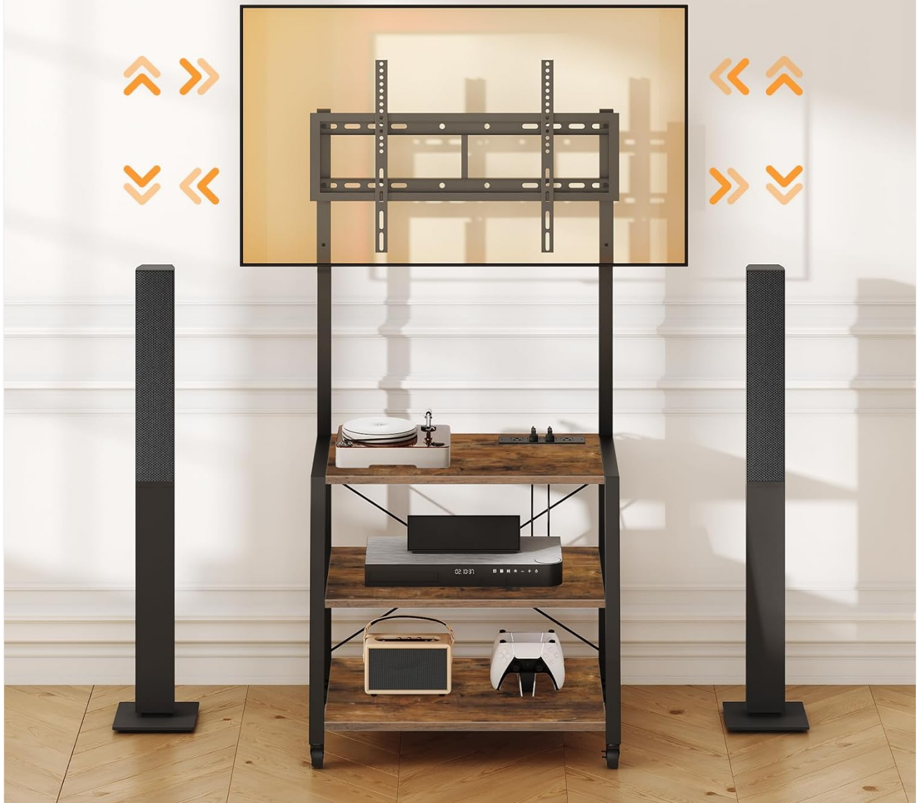
Image 4.3: Illustration of the adjustable TV mount, showing how it can be moved left, right, up, and down to fit various TV sizes.

Adjusting the mount left and right or up and down to fit all sizes of TVs.