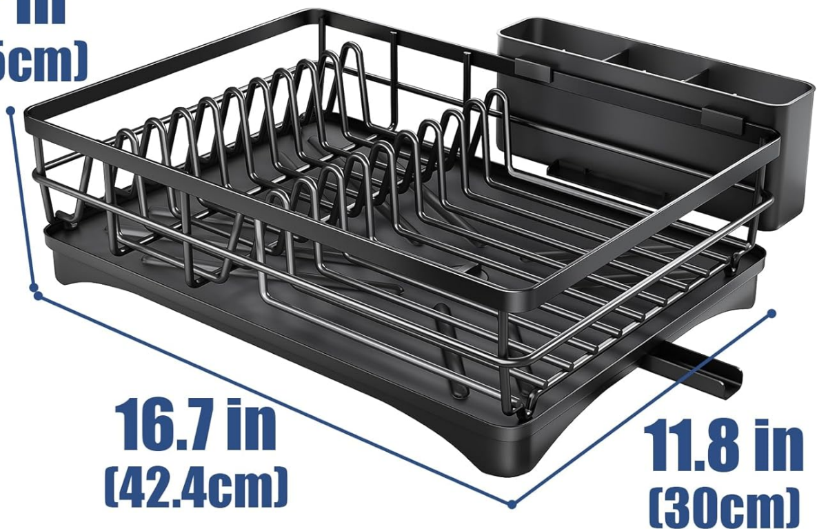
Figure 8.1: Product dimensions and sink compatibility.