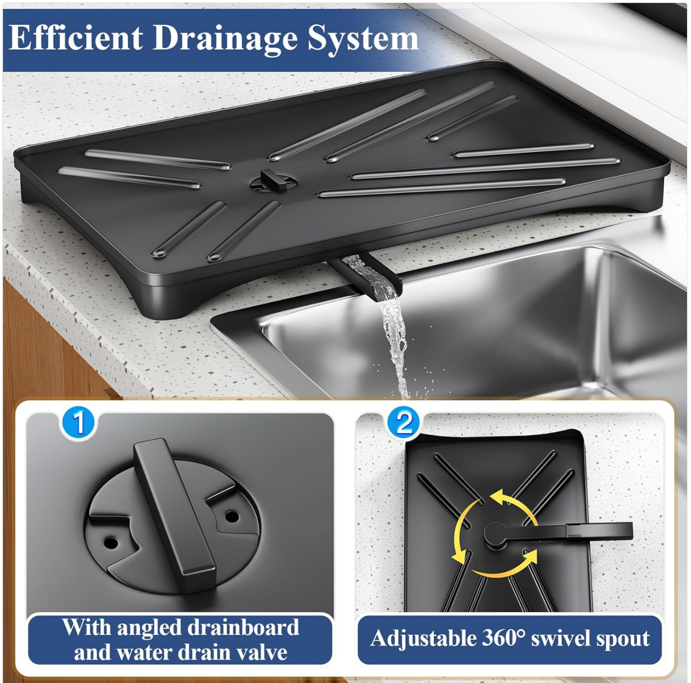
Figure 5.2: Detail of the efficient drainage system.