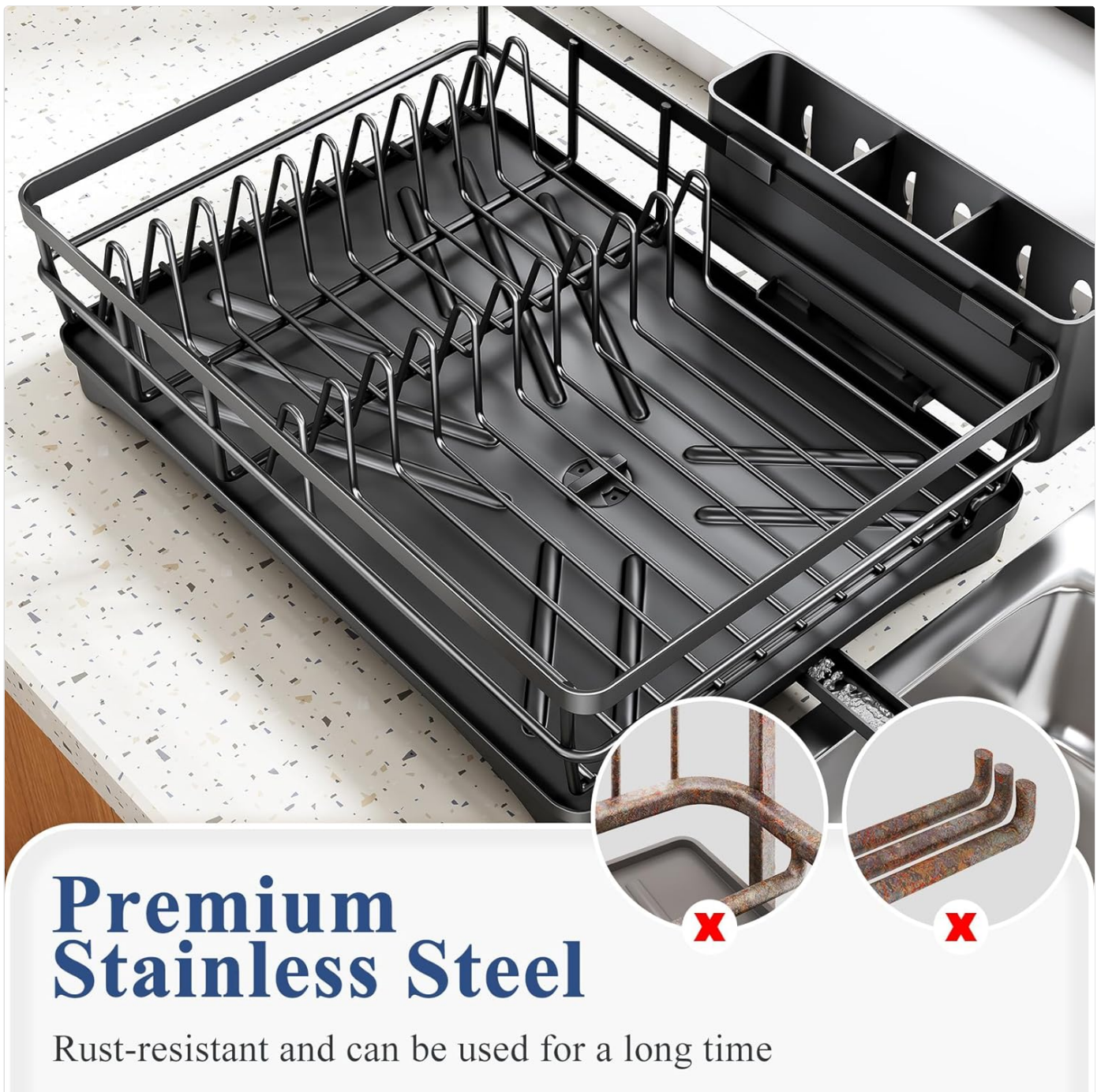
Figure 6.1: The rust-resistant premium stainless steel construction ensures durability and ease of maintenance.