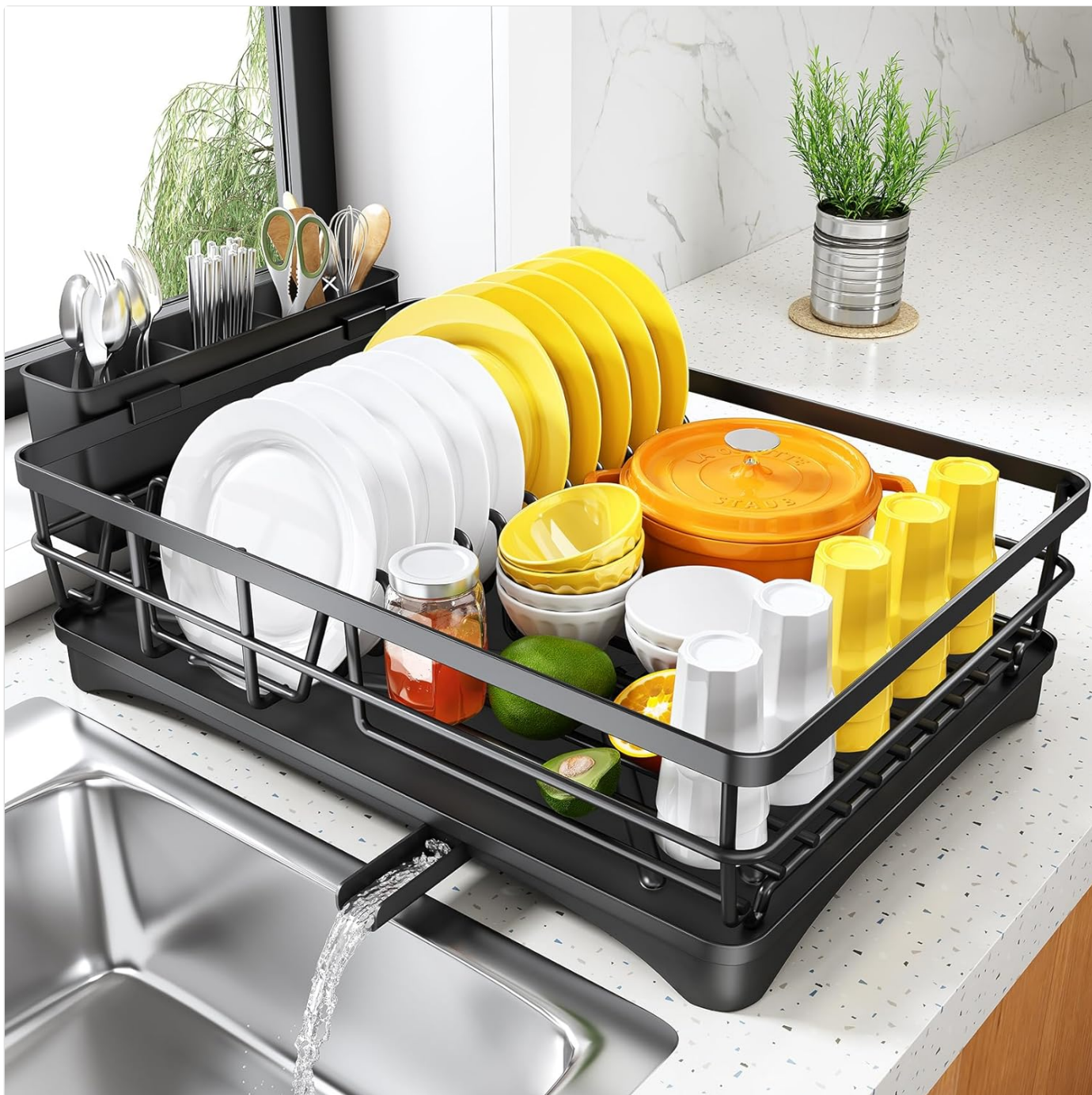
Figure 4.1: Fully assembled SNTD Dish Drying Rack in use.