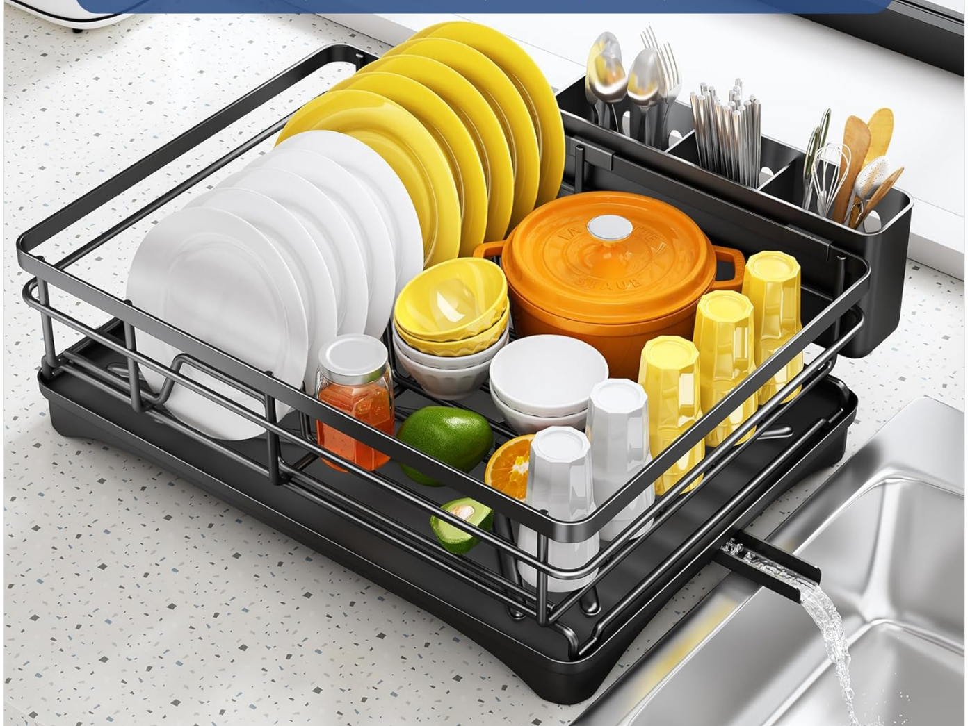
Figure 5.1: Demonstrating the large capacity and organization of the dish rack.