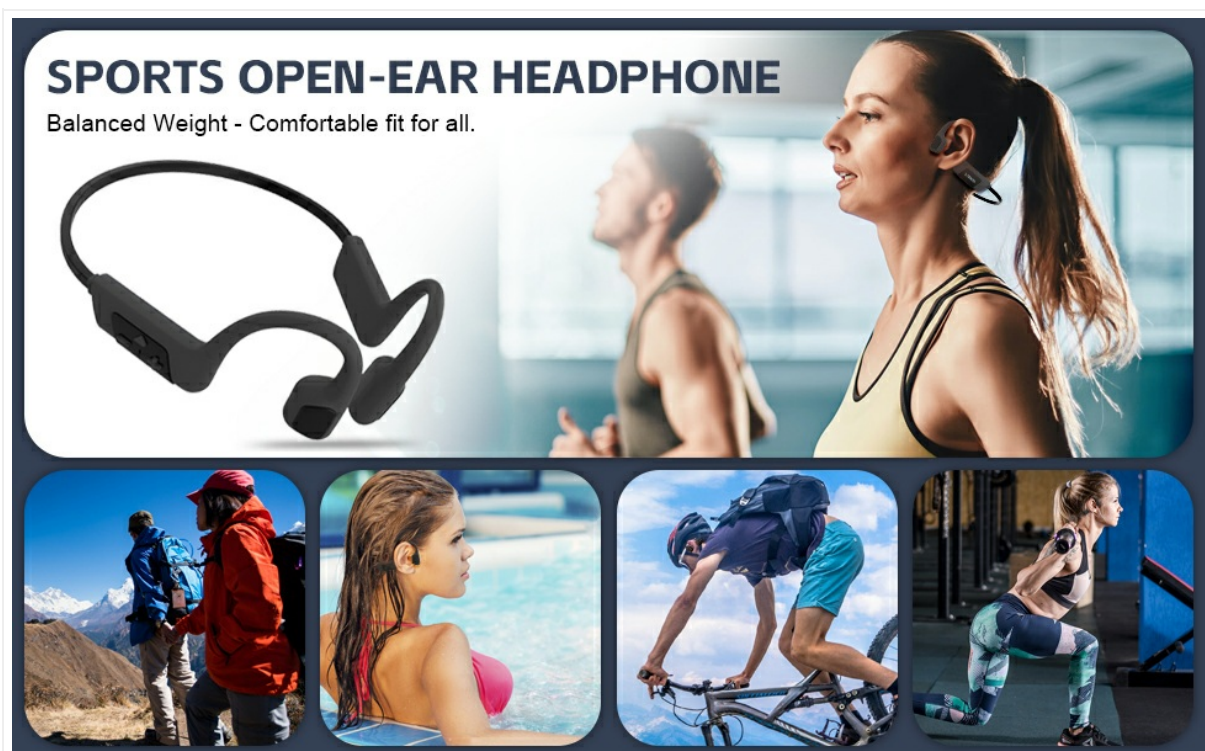
Image: A person wearing the LOBKIN X7 headphones during a workout, demonstrating the open-ear design.

Place the headphones around the back of your head with the transducers resting on your cheekbones, just in front of your ears. The flexible band should rest comfortably on your neck. Adjust for a secure and comfortable fit.