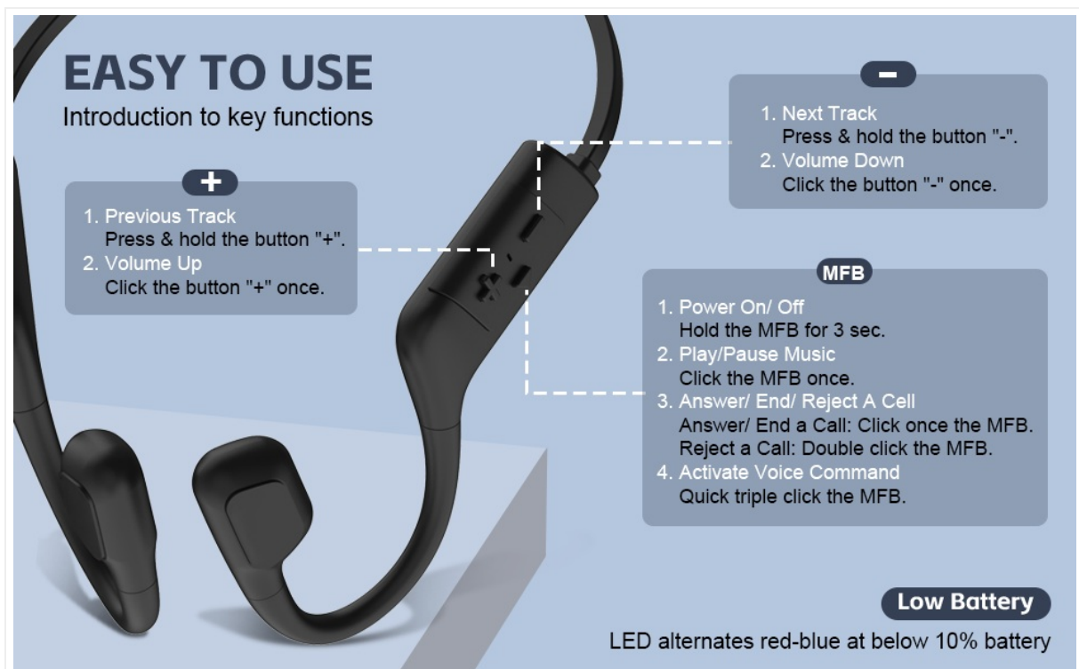
Image: Detailed diagram illustrating the button functions for the LOBKIN X7 headphones.