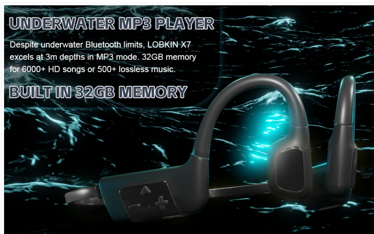
Image: The LOBKIN X7 headphones submerged in water, illustrating their use as an underwater MP3 player.

Video: Demonstration of the LOBKIN X7 headphones being used during various sports activities, including running, highlighting their comfort and stability.