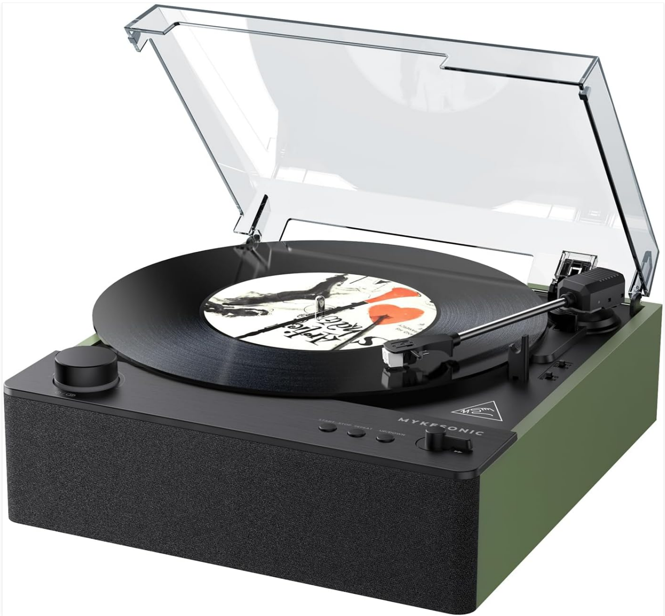
Figure 1: MYKESONIC Fully Automatic Record Player with dust cover open, showcasing the turntable and controls.