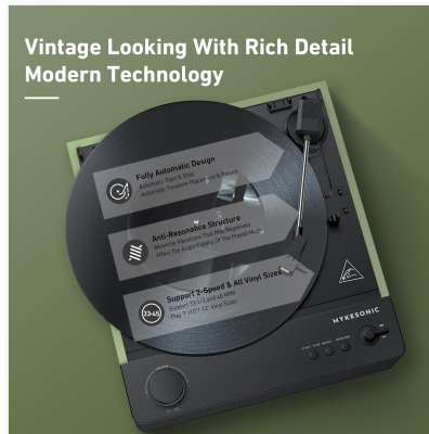
Figure 3: Automatic features and speed/size compatibility.

Enjoy hassle-free playback with the fully automatic design. Simply press start, and the belt-driven system will automatically place the needle, spin the record, and stop when finished. It supports two speeds (33 1/3 and 45 RPM) and is compatible with 7", 10", and 12" vinyl records.