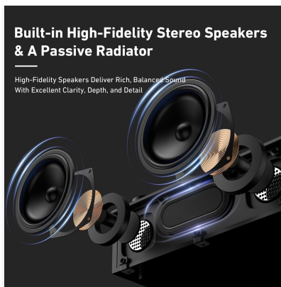
Figure 5: Internal speaker design.