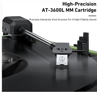
Figure 2: AT-3600L Cartridge