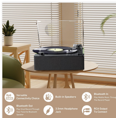
Figure 4: Connectivity options.

Beyond its built-in stereo speakers, the turntable offers multiple connection possibilities. It features an AUX-in headphone port for private listening, RCA output for connecting to external amplifiers or speaker systems, and Bluetooth functionality for both receiving music from your devices (Bluetooth In) and streaming vinyl playback to external Bluetooth speakers (Bluetooth Out).