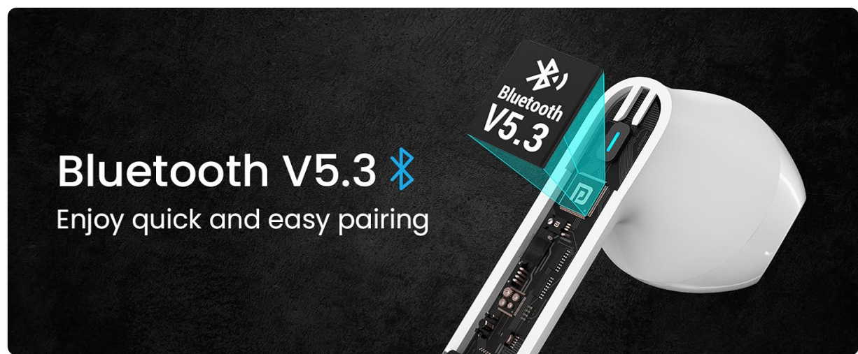
Image 3.3: The earbuds feature Bluetooth 5.3 for fast and reliable connections.

The earbuds will automatically reconnect to the last paired device when taken out of the case, provided Bluetooth is enabled on the device.