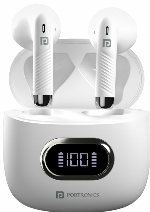
Image 1.1: Portronics Harmonics Twins S9 Earbuds and Charging Case.