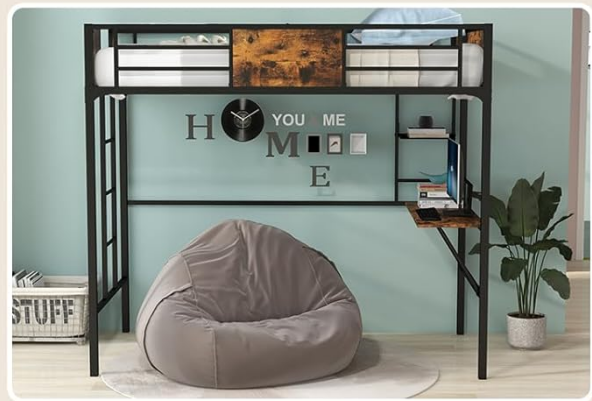
Private Entertaining Space