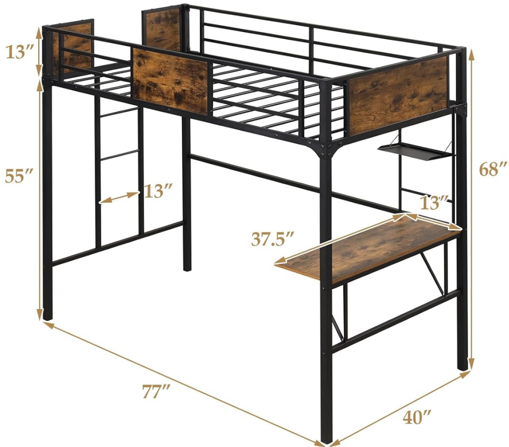
Figure 5: Product dimensions and load capacity details.