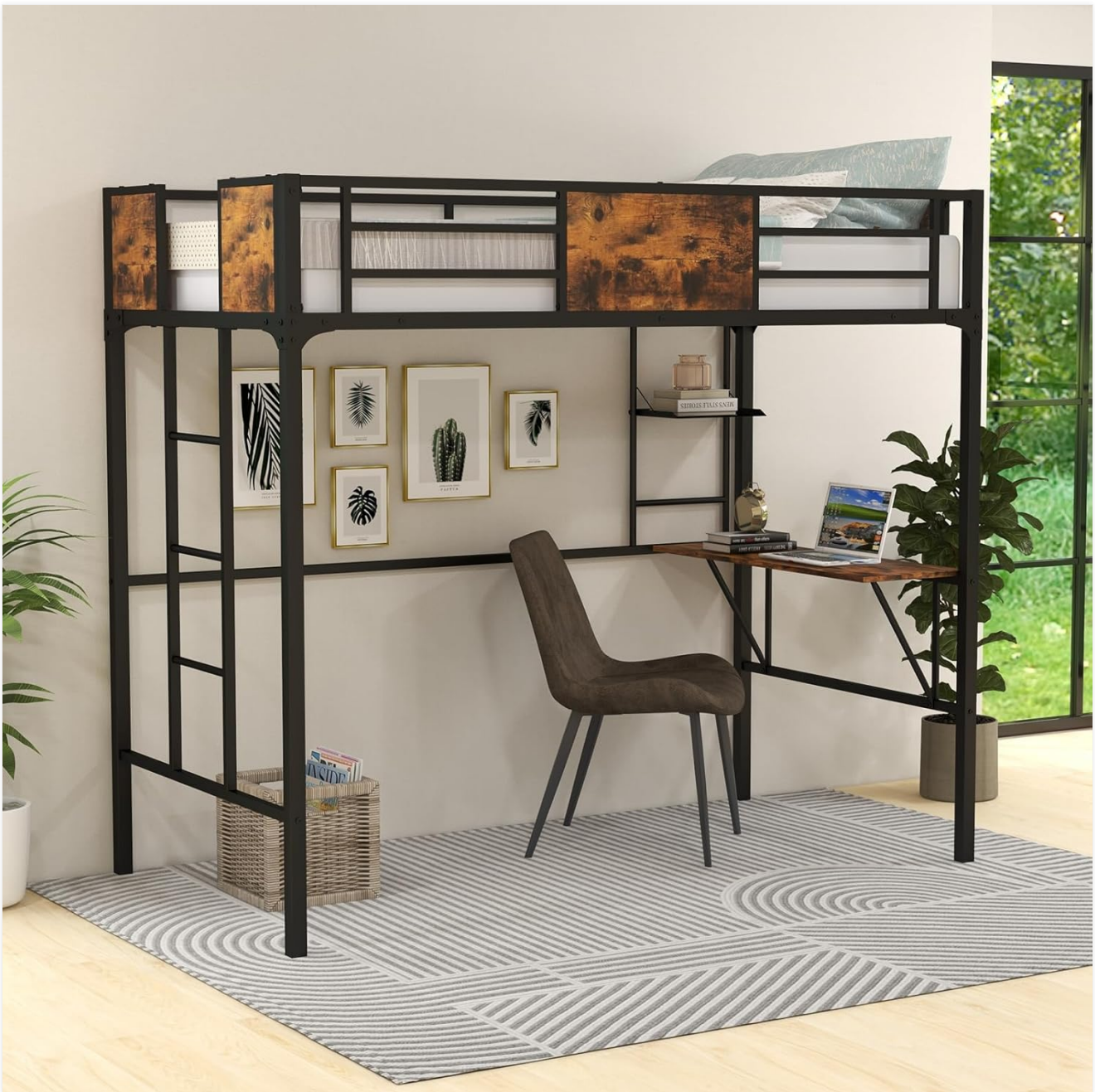
Figure 2: The assembled Giantex Metal Twin Loft Bed, ready for use.