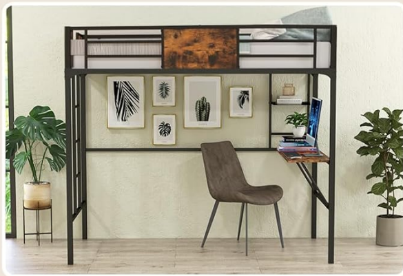
Effective Working & Studying