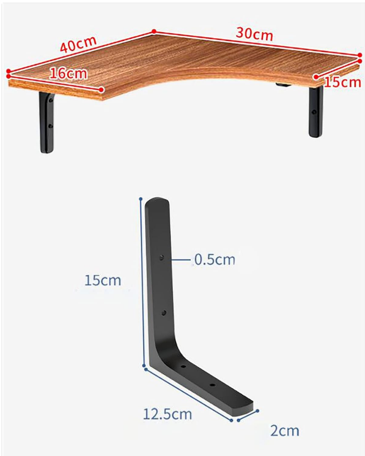
Image 2: Detailed dimensions of the L-shaped shelf board and a single metal mounting bracket. The shelf board has varying depths of 16cm and 15cm. The bracket measures 15cm in height, 12.5cm in depth, and 2cm in width, with a material thickness of 0.5cm.