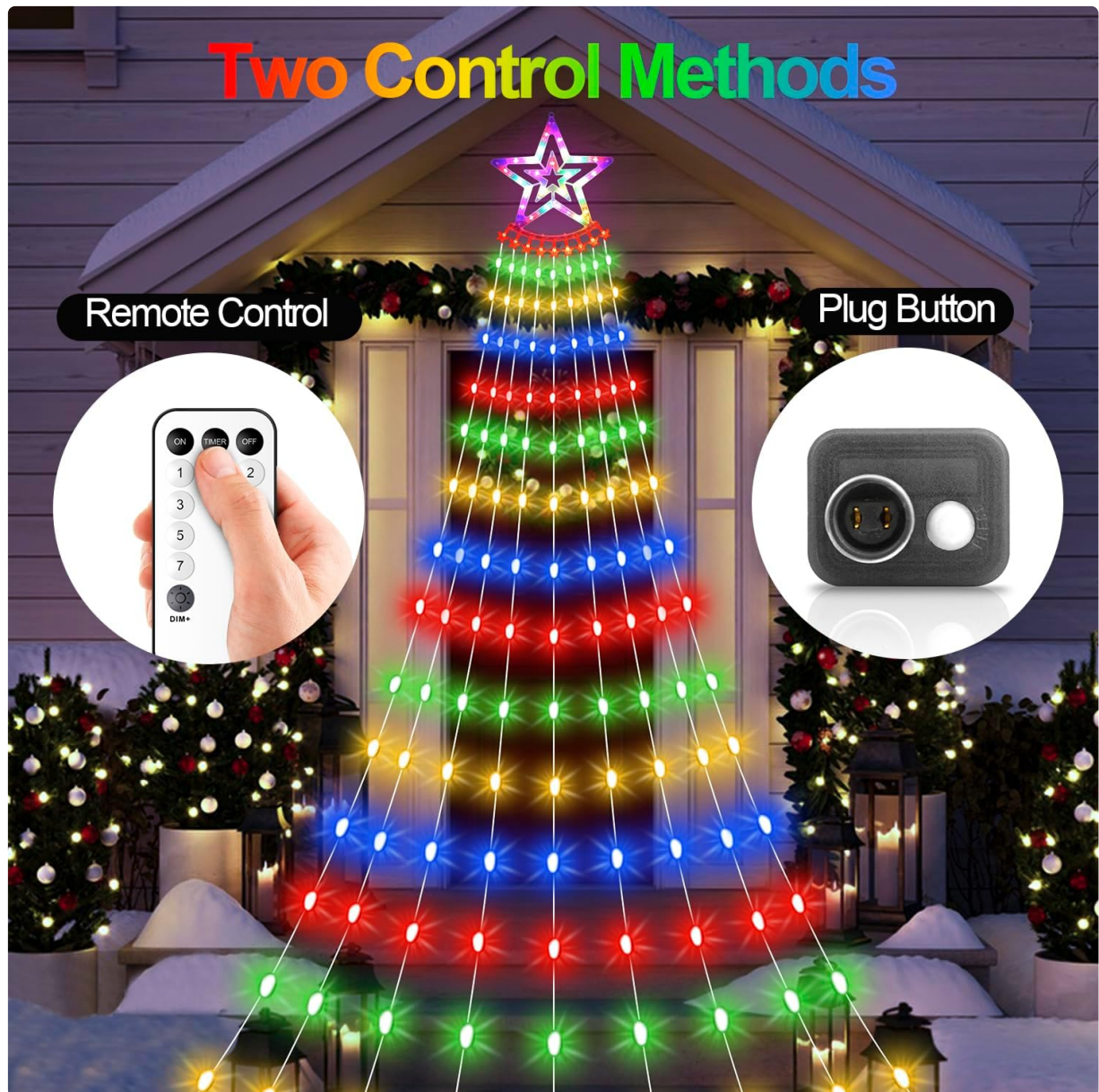
Figure 5.1: Remote control and plug button for operating the lights.