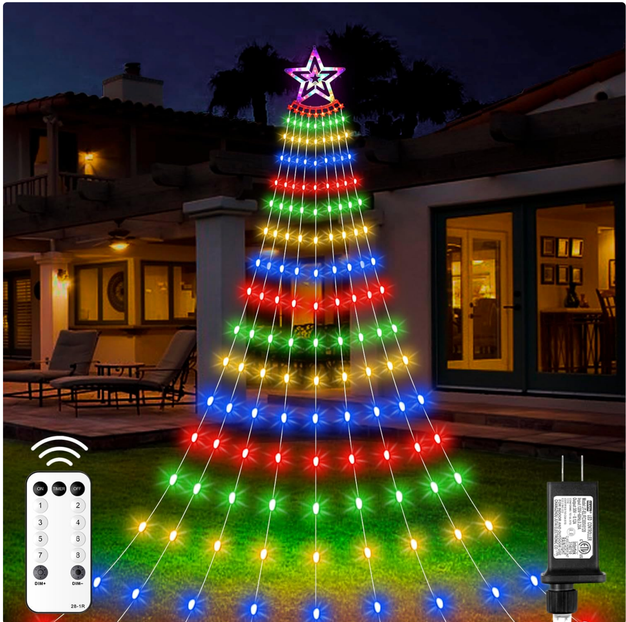
Figure 4.1: Example installation of the light set on a house exterior.

6. Connect Power: Plug the UL certified power adapter into a suitable outdoor-rated electrical outlet.