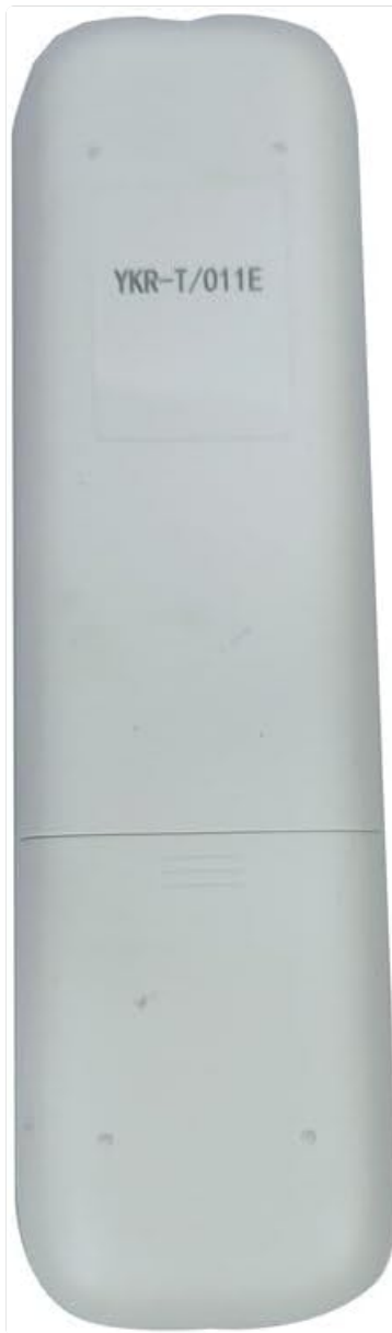
Figure 1: Back of the remote control, indicating the battery compartment and model number YKR-T/011E.