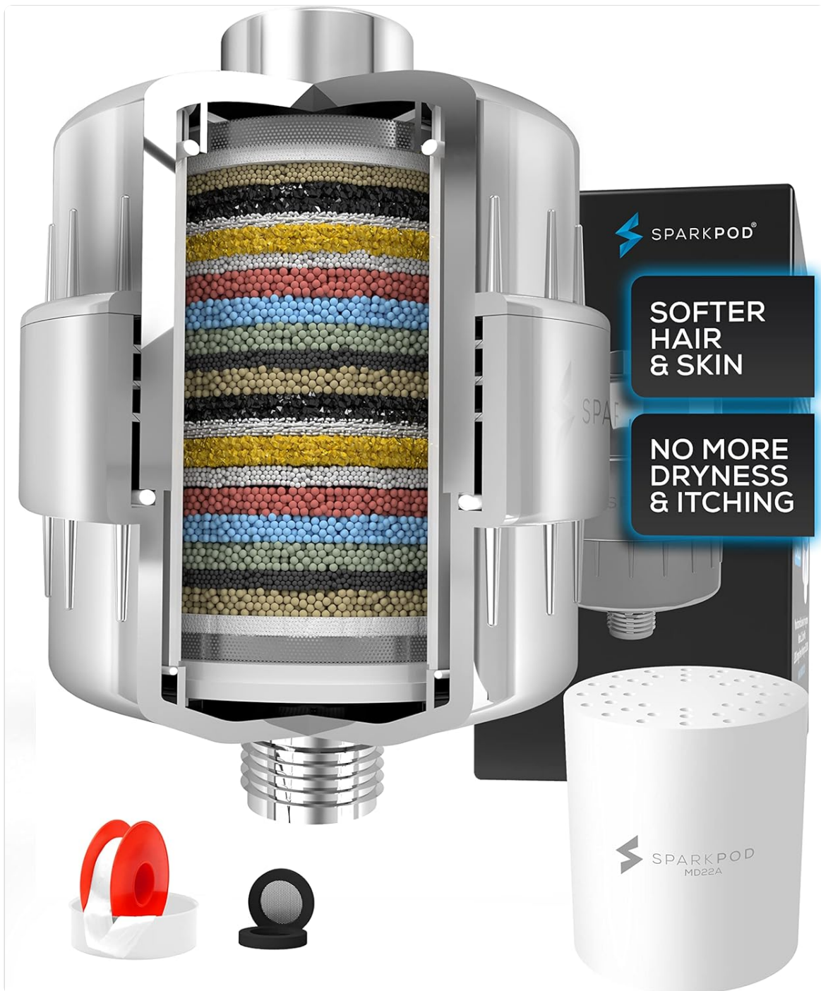
Image: A cutaway view of the SparkPod filter capsule, showing its multi-stage filtration layers designed to purify shower water.