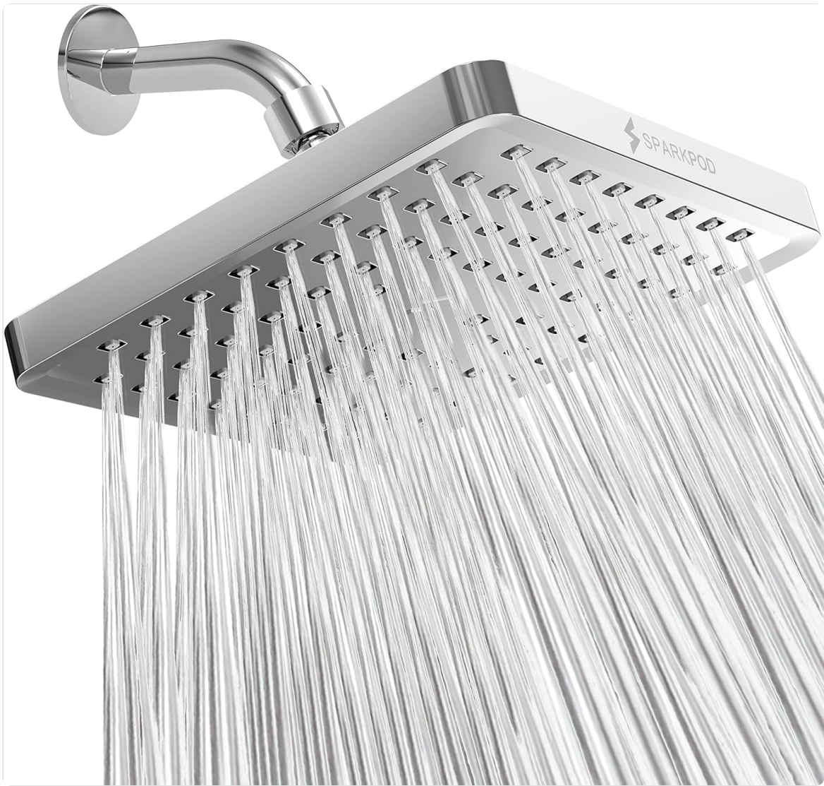
Image: The SparkPod 8-inch square rain shower head delivering a consistent, high-pressure water flow.