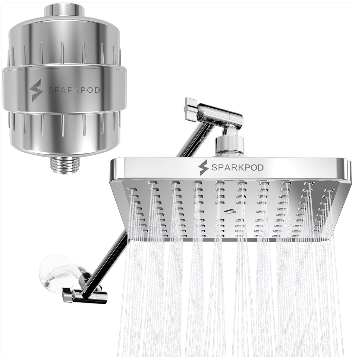
Image: The complete SparkPod shower system, featuring the 8-inch square rain shower head, the filter capsule, and the adjustable shower arm, all in a chrome finish.