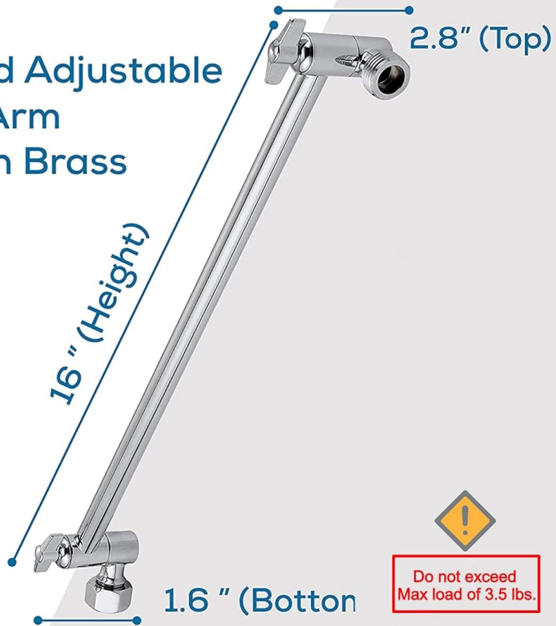
Image: Dimensional drawing of the SparkPod 16-inch adjustable shower arm, showing its height and top/bottom measurements, along with a warning about maximum load.