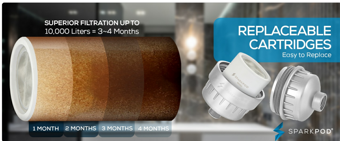
Image: A visual representation of the filter cartridge's lifespan, showing water discoloration over 1 to 4 months, and images of replacement cartridges.