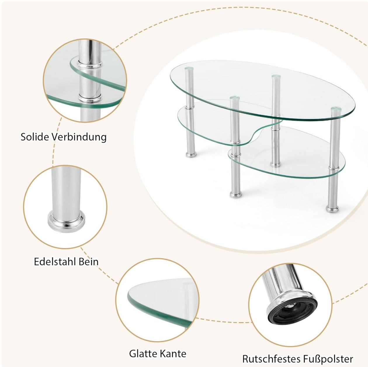
Image: Close-up view of the table's structural elements, including leg connections and foot pads, illustrating the assembly points.