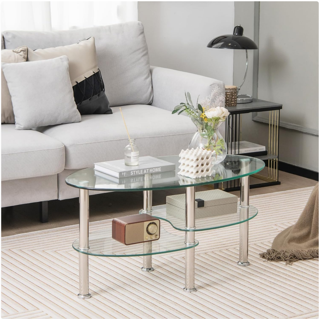
Image: The COSTWAY Oval Glass Coffee Table positioned in a modern living room, showcasing its design and functionality.