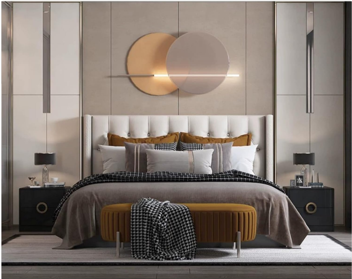
Image: Two Yclty nightstands flanking a bed in a modern bedroom. Each nightstand holds a lamp and decorative items, demonstrating their functional and aesthetic integration into a living space.