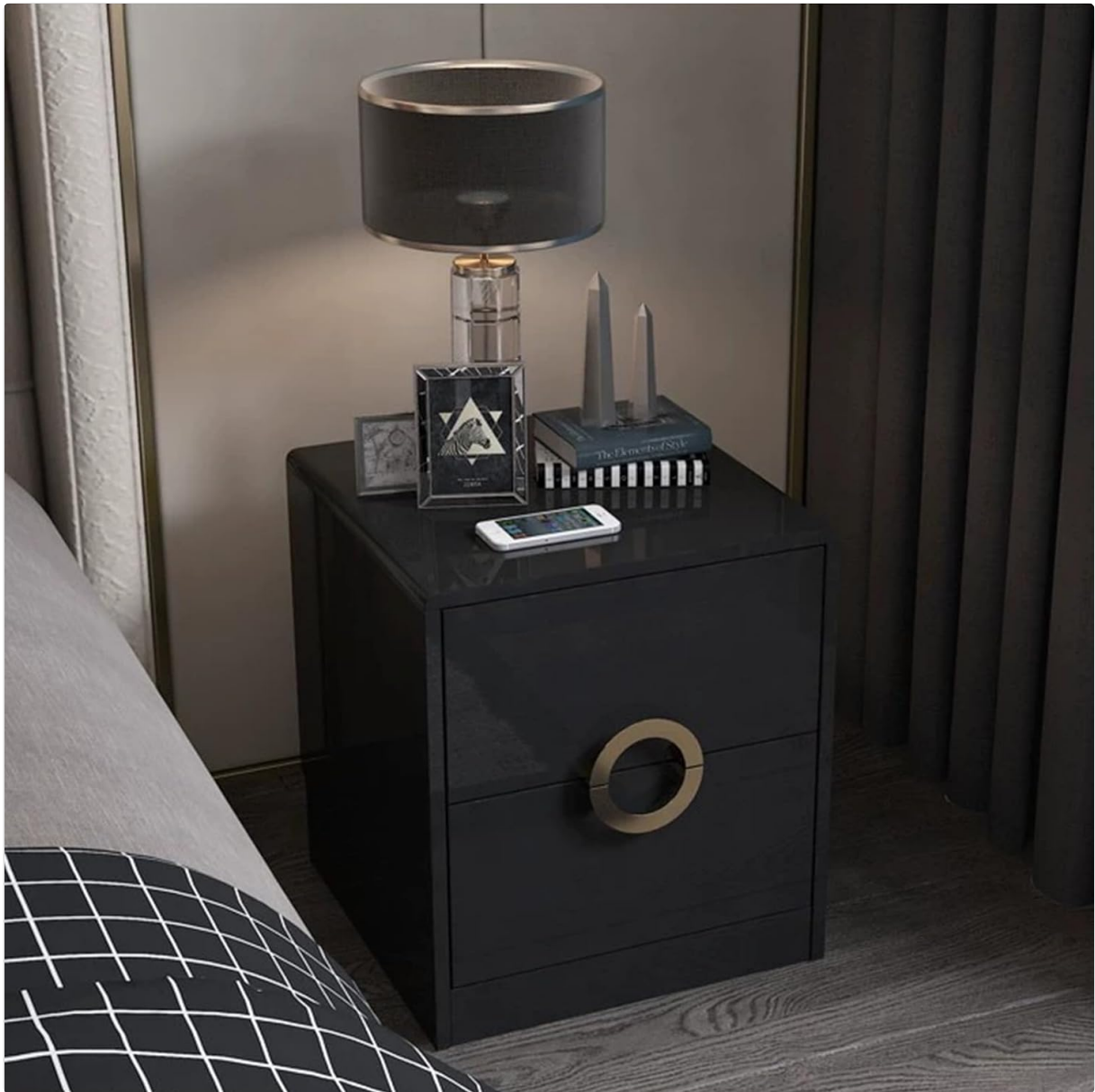
Image: A close-up view of the black Yclty nightstand next to a bed, with a smartphone placed on its glossy surface. This highlights its use as a convenient surface for everyday items.