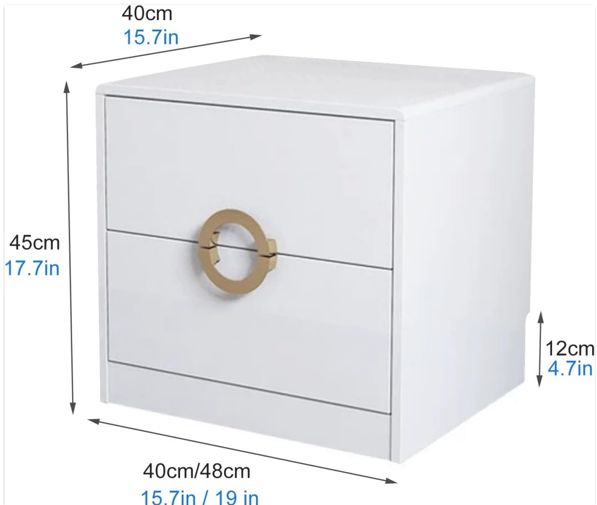
Image: A diagram illustrating the dimensions of the nightstand. The height is 45cm (17.7in), depth is 40cm (15.7in), and width is either 40cm (15.7in) or 48cm (19in), with a drawer height of 12cm (4.7in).