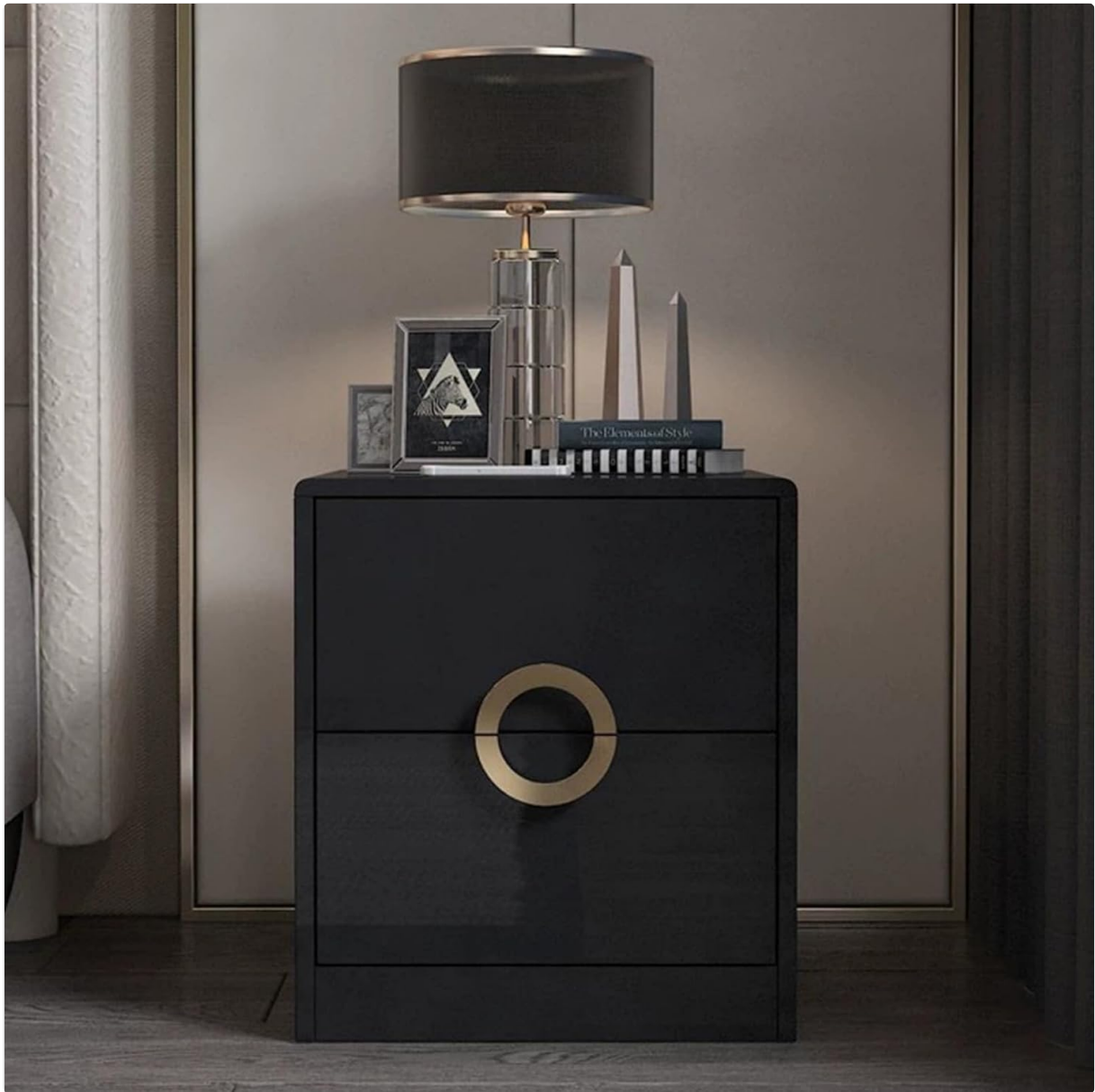
Image: The Yclty Modern Bedside Table in black, featuring a sleek design with a prominent gold ring handle on the top drawer. A lamp and decorative items are placed on top, showcasing its use as a functional and stylish piece of furniture.