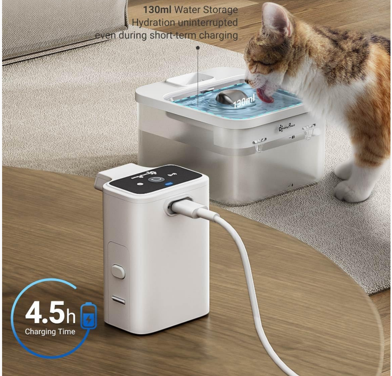
Image 2: The removable pump unit being charged separately, allowing the fountain to remain in place.

130ml Water Storage Hydration uninterrupted even during short-term charging