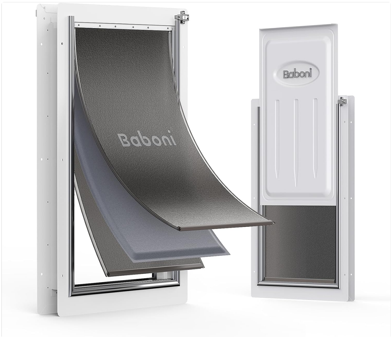
Image 5.2: The pet door shown with its standard flaps and with the additional metal closing panel inserted for security.