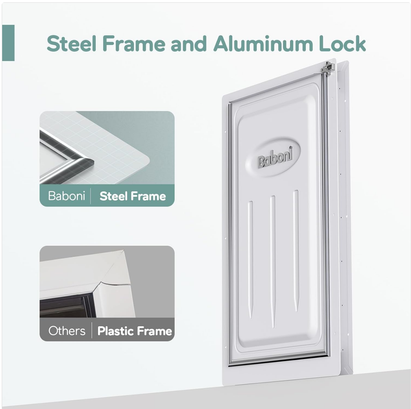
Image 2.1: Illustration highlighting the robust steel frame construction of the Baboni pet door compared to typical plastic frames.