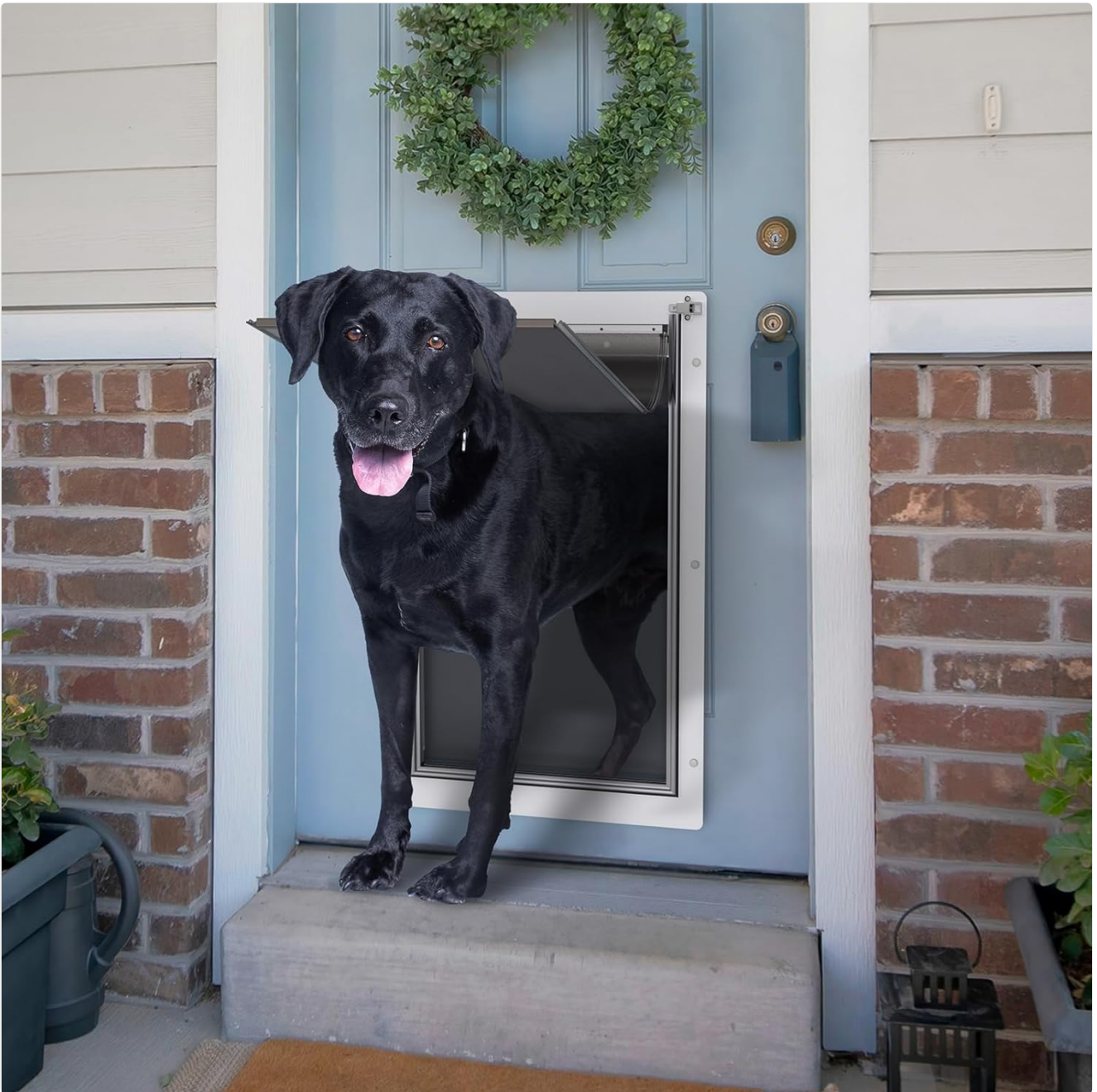
Image 5.1: A dog demonstrating the ease of use of the Baboni pet door.