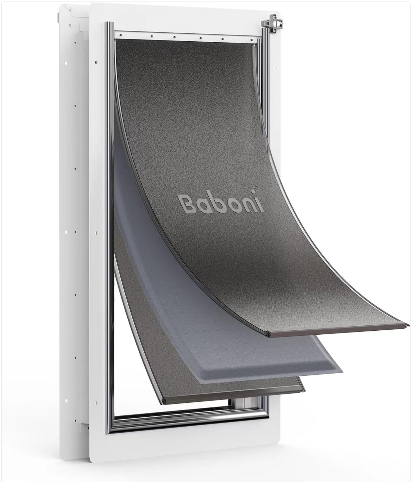
Image 1.1: The Baboni 3-Flaps Pet Door, showcasing its robust design and multiple flaps.