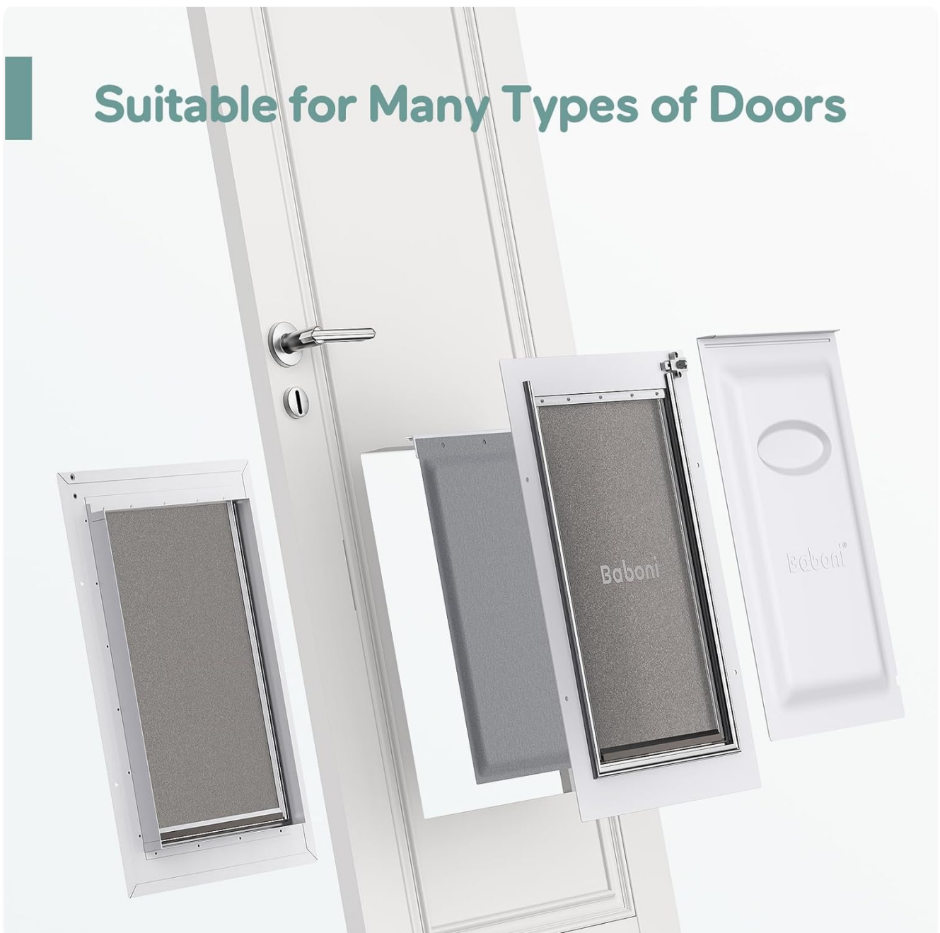
Figure 4: Pet Door Components and Door Compatibility