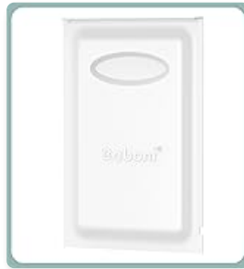
Figure 6: Wall Material Compatibility

The pet door is suitable for various exterior wall sidings including stucco, brick walls, wood, and PVC.