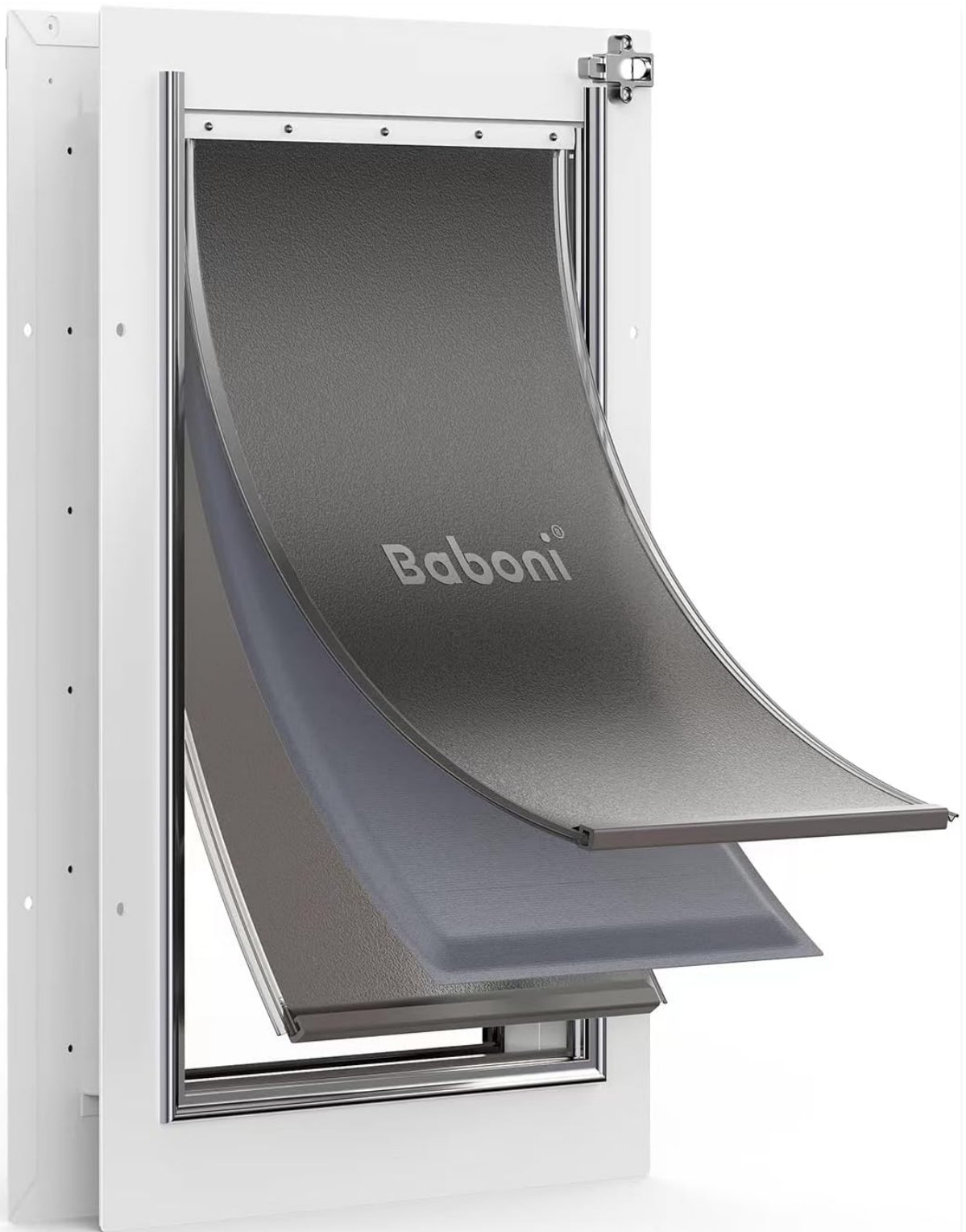
Figure 1: Baboni 3-Flaps Pet Door (Large Metal)