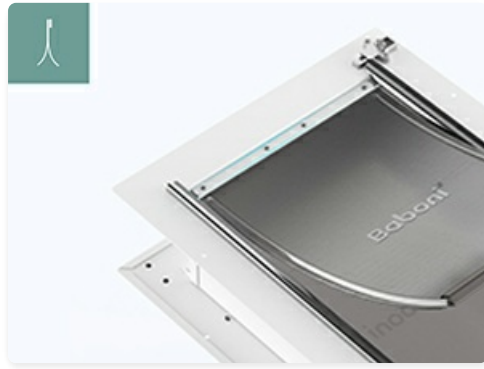
Figure 5: Installation in Progress

The pet door is suitable for various exterior wall sidings including stucco, brick walls, wood, and PVC.