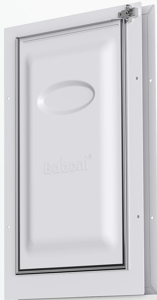
Figure 8: Steel Frame and Aluminum Lock Detail