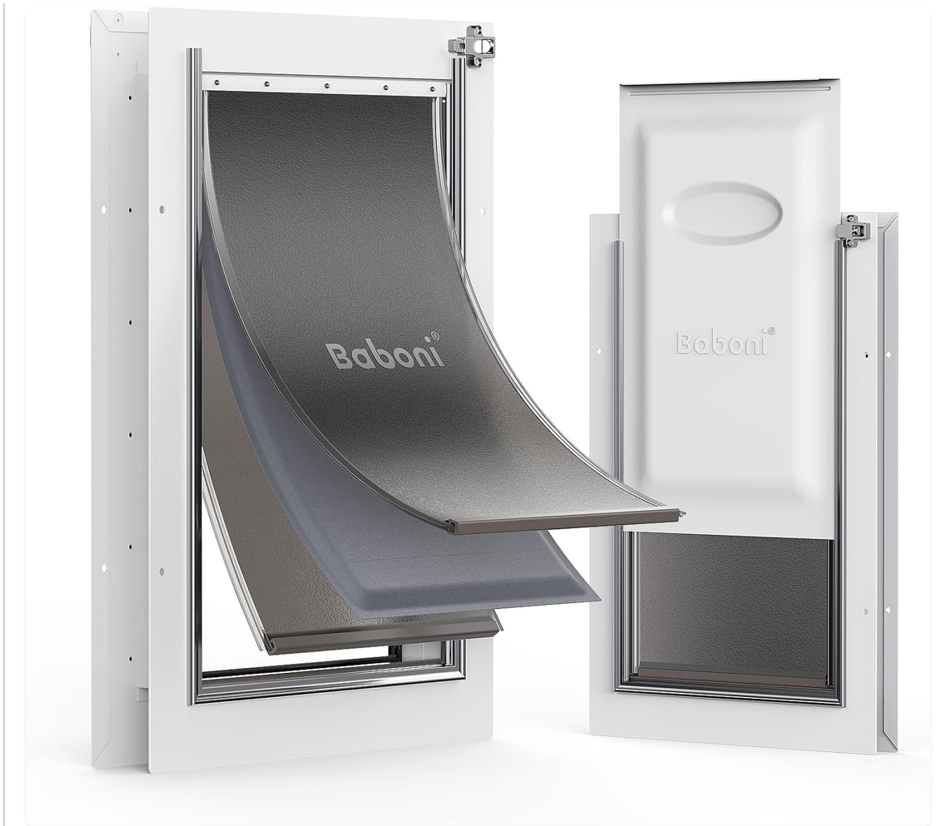
Figure 7: Pet Door with Slide-in Closing Panel