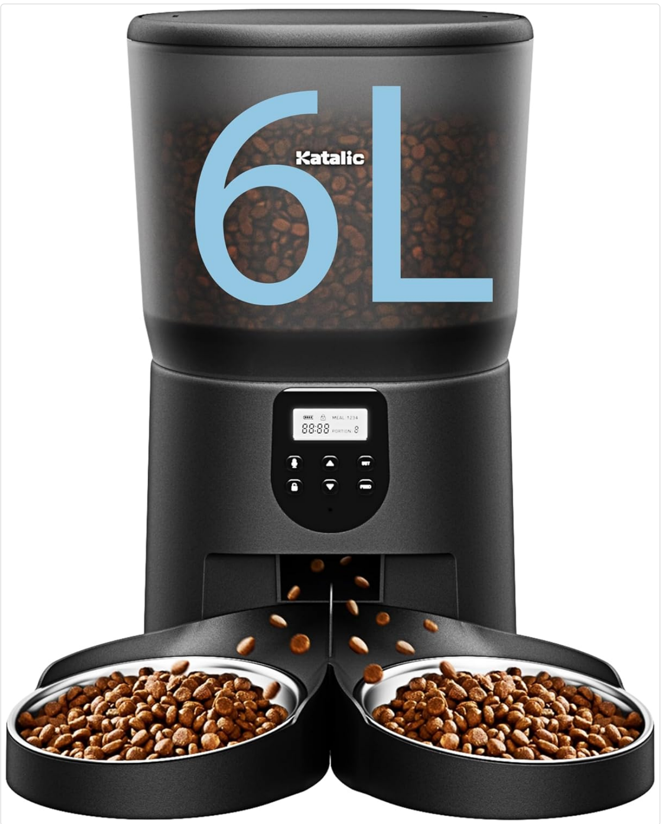
The Katalic 6L Automatic Pet Feeder, designed for two pets, features a large transparent food reservoir and dispenses dry kibble into two stainless steel bowls.