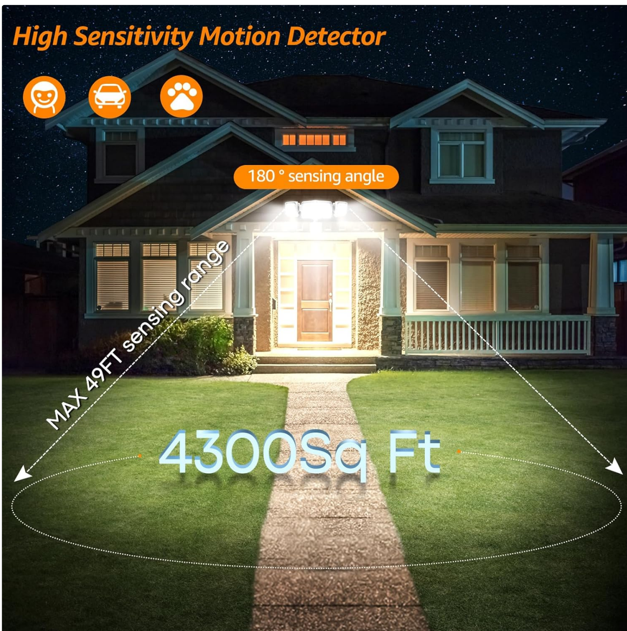
Illustration of the motion sensor's wide 180-degree sensing angle and maximum detection range of 49 feet, covering up to 4300 square feet.