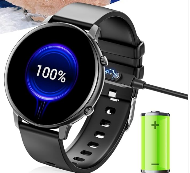
Image: The Hwagol G25 Smart Watch being charged via its magnetic cable, showing a 100% battery indicator. Also depicts the watch being worn in a swimming pool, illustrating its daily waterproofing feature.