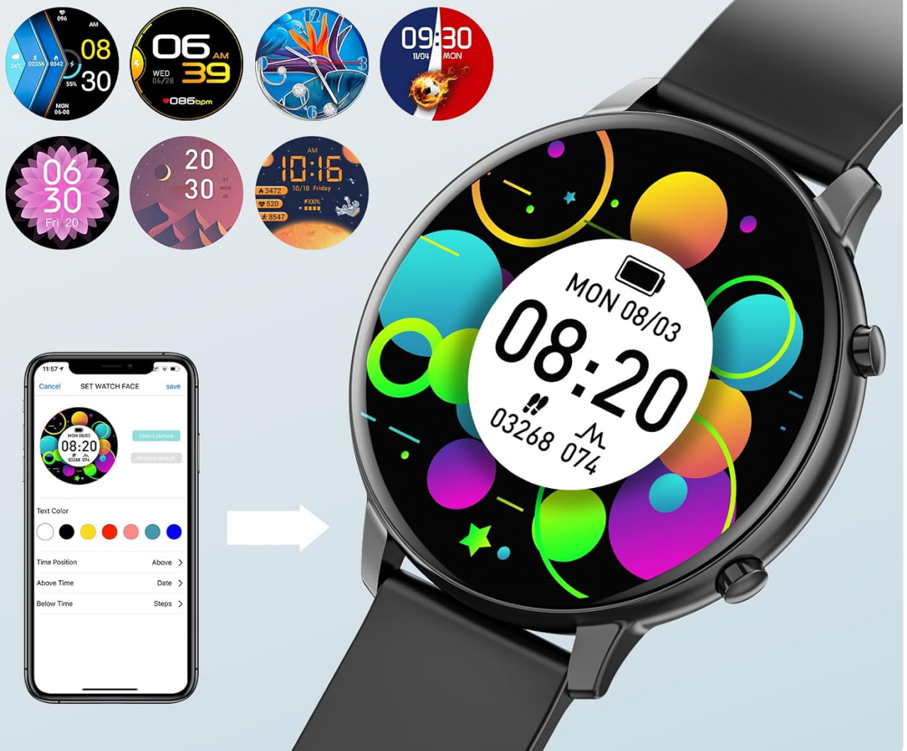
Image: The Hwagol G25 Smart Watch displaying various customizable watch faces. An adjacent smartphone screen shows the companion app interface for selecting and customizing watch faces, including options for text color and position.