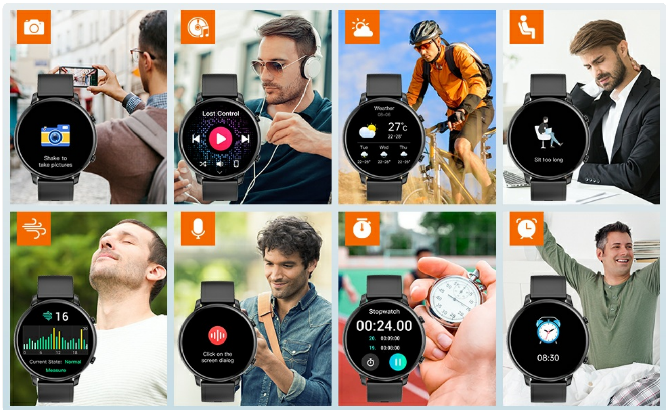
Image: A collage of images demonstrating various smart features of the Hwagol G25 Smart Watch, including remote camera control, music playback control, weather display, sedentary reminders, breathing exercises, voice assistant, stopwatch, and alarm functions.