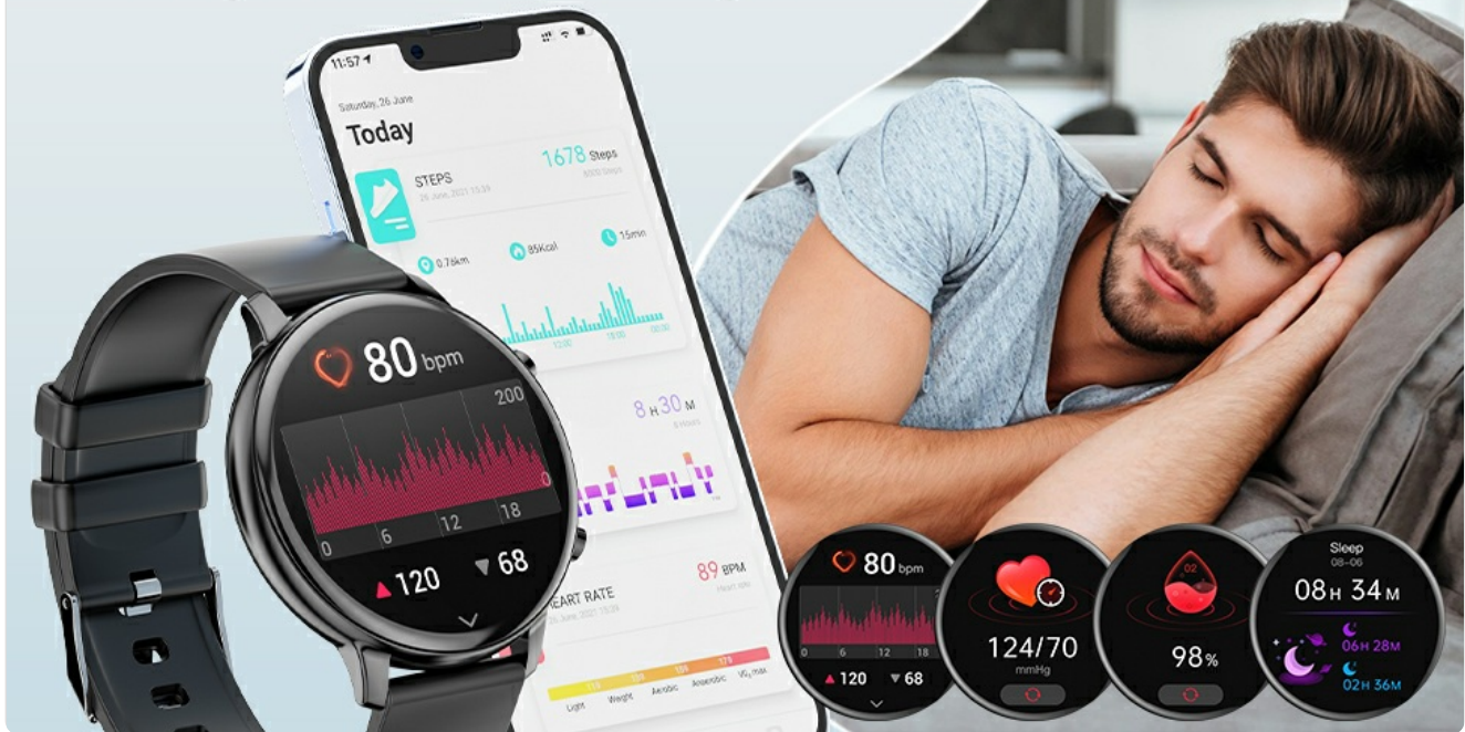
Image: A man sleeping, with the Hwagol G25 Smart Watch on his wrist. The image illustrates the watch's health assistant features, showing heart rate, blood pressure, blood oxygen, and sleep data on both the watch and a connected smartphone app.

Basato su grafici sanitari chiari, conosci meglio la tua salute