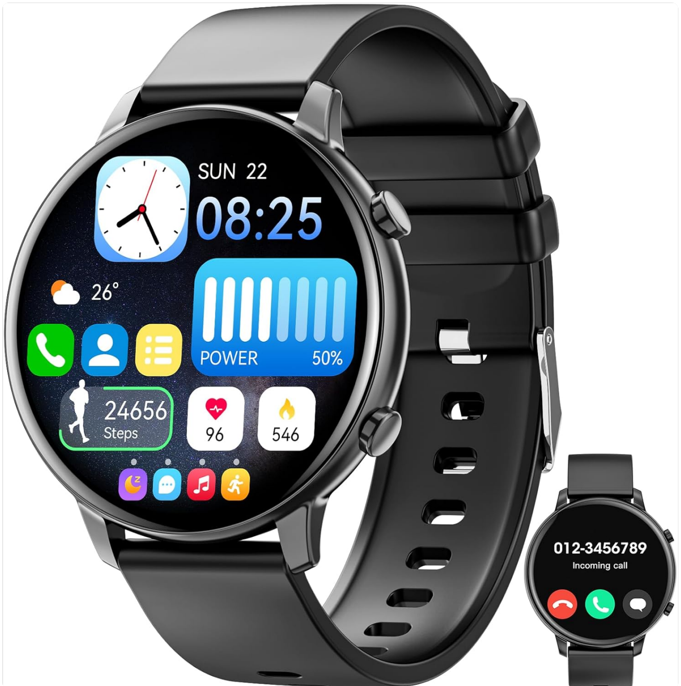
Image: Hwagol G25 Smart Watch, displaying time, date, steps, heart rate, and battery level. A smaller inset image shows an incoming call notification.