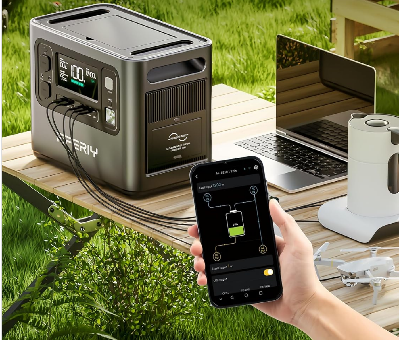
Image: A user interacting with the AFERIY P210 via a mobile application, demonstrating remote control capabilities.