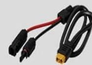
4. Câble MC4-XT90