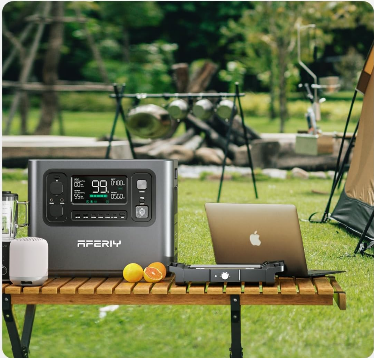
Image: The AFERIY P210 providing power to a laptop, lamp, and other devices in an outdoor camping environment, illustrating its high compatibility.