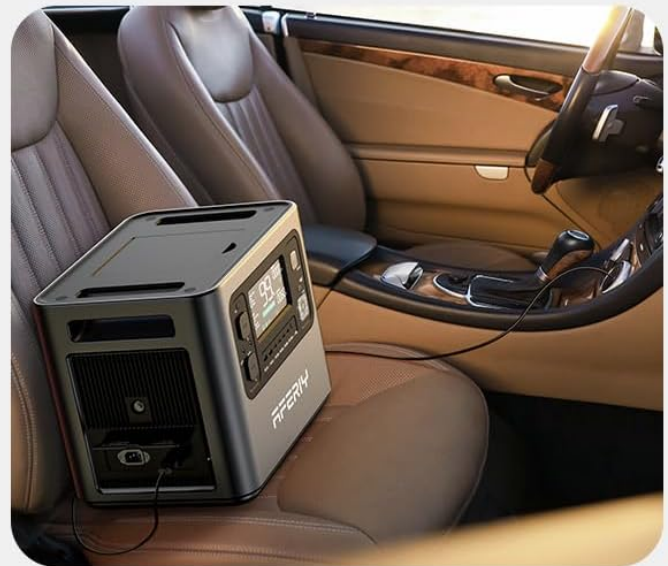
Image: Visual representation of the various charging options for the AFERIY P210, including AC, solar, and car charging, with estimated charging times.