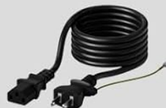
3. Cordon d'Alimentation