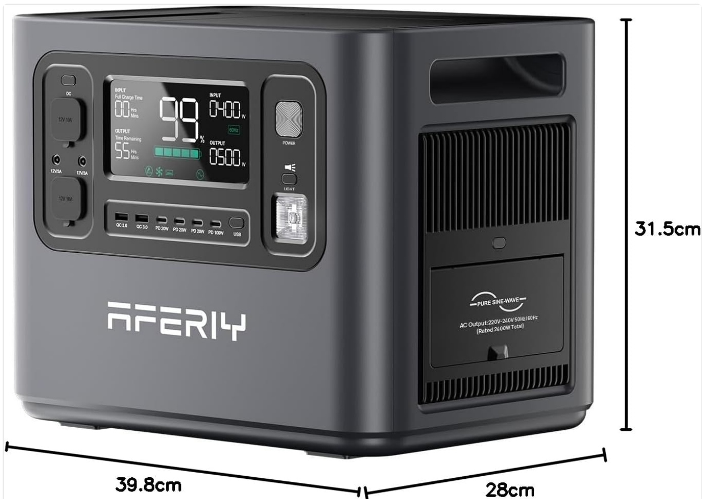
Image: The AFERIY P210 power station with its length, width, and height measurements clearly indicated.