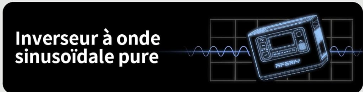
Image: Illustration of the AFERIY P210's 10ms UPS function, showing it powering a computer during an outage, and highlighting its advanced BMS and pure sine wave inverter.