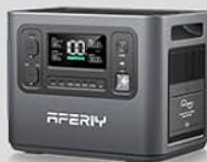
1. AF-P210 Générateur