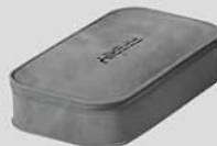
2. Sac à Outils