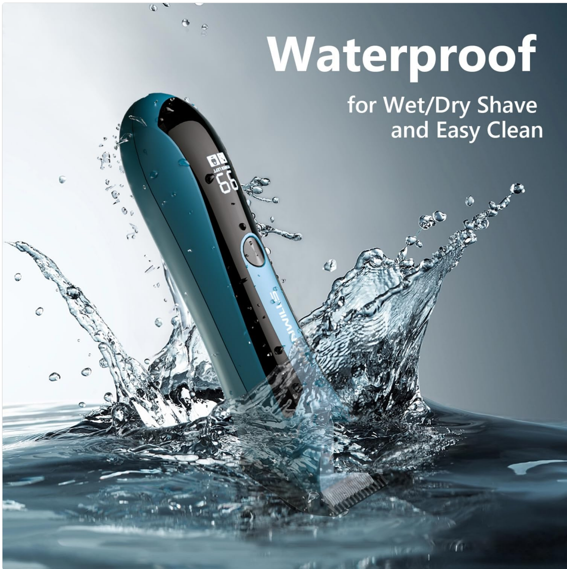
Image: Trimmer in water, highlighting waterproof feature.