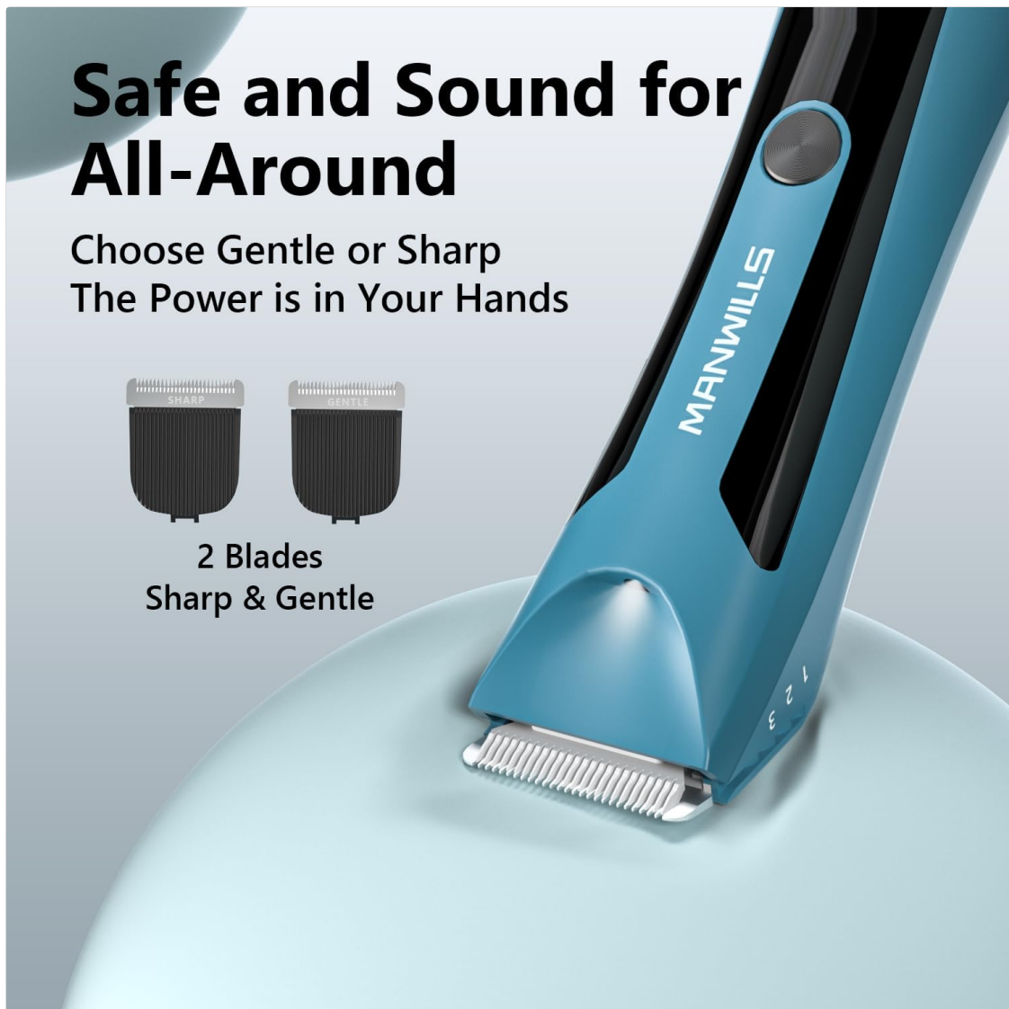
Image: Trimmer with Sharp and Gentle blades.