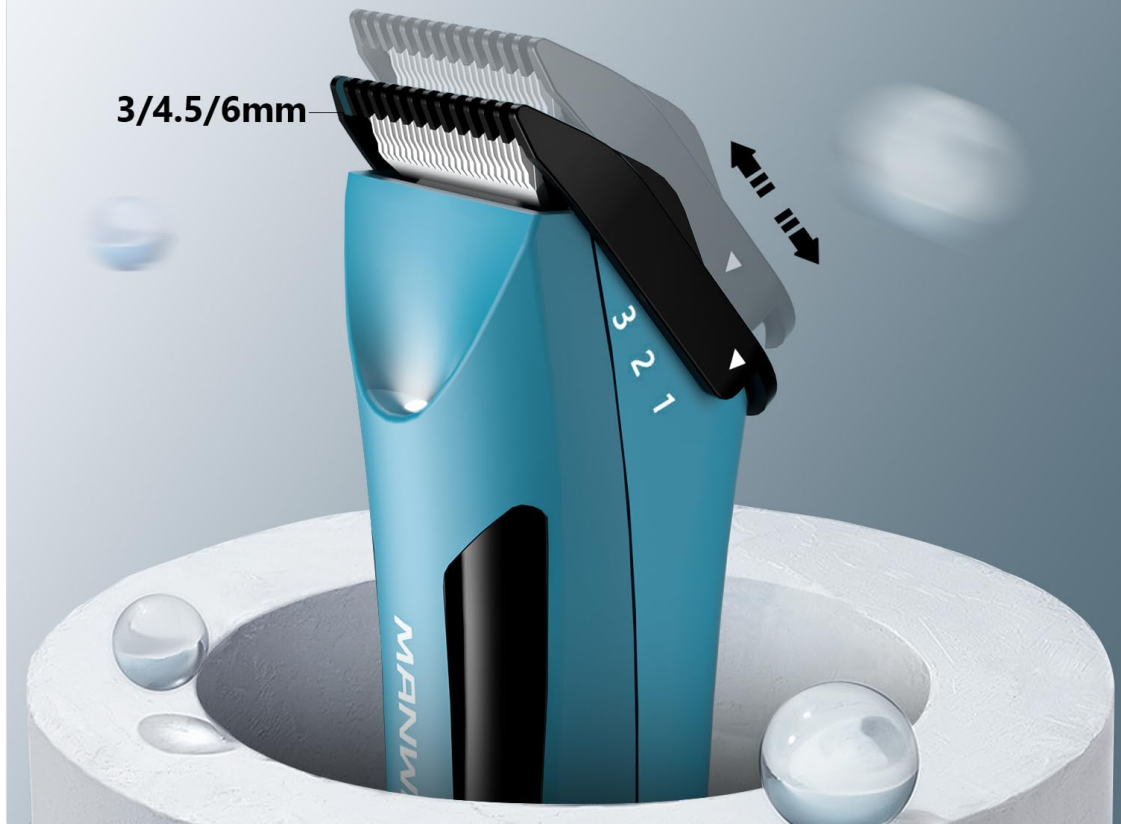
Image: Adjustable guide comb settings.

to Tailor Your TrimPerfect Grooming Every Time