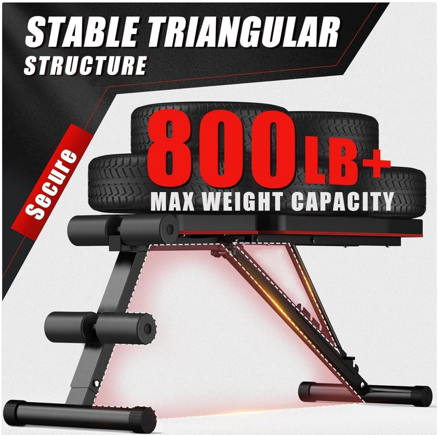
Figure 1: The Yagud Adjustable Weight Bench features a stable triangular structure, designed to support a maximum weight capacity of 800 lbs (approximately 362.9 kg), ensuring user safety during intense workouts.