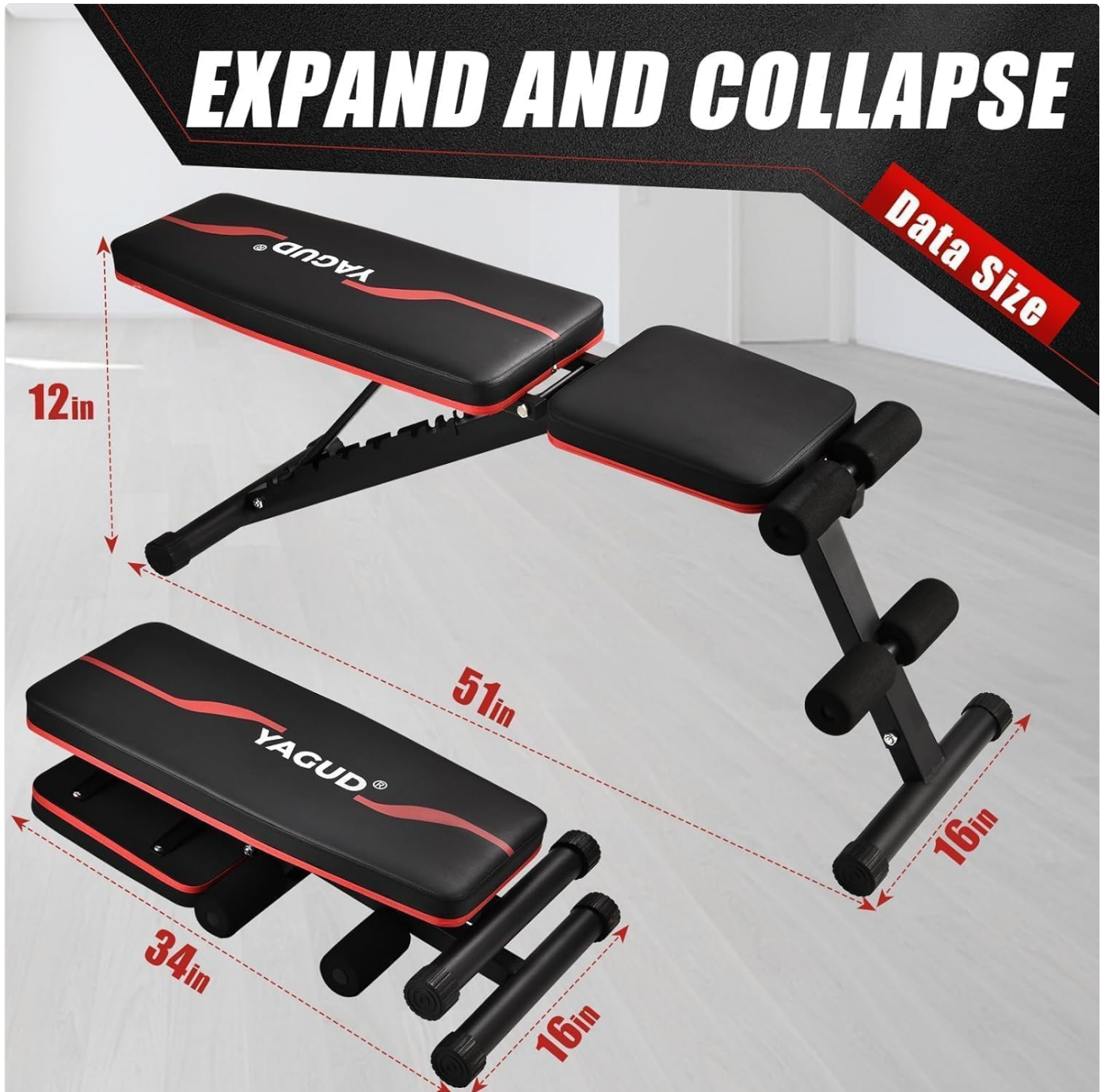
Figure 2: The Yagud Adjustable Weight Bench shown in both its expanded and collapsed configurations, highlighting its compact storage capabilities. Expanded dimensions are approximately 51 inches (length) by 16 inches (width) by 12 inches (height of seat). Collapsed dimensions are approximately 34 inches (length) by 16 inches (width).