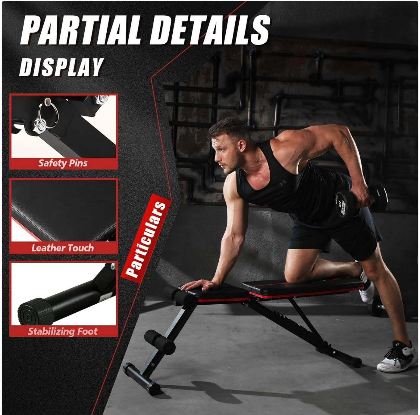
Figure 5: Detailed view of key components of the Yagud Adjustable Weight Bench, including the safety pins for secure adjustments, the durable PU leather upholstery for comfort, and the stabilizing foot for enhanced balance.