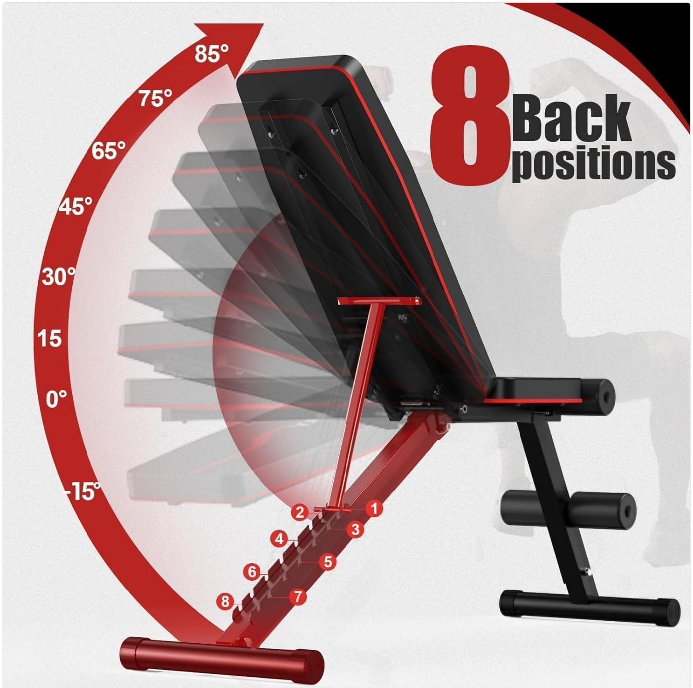
Figure 3: Illustration of the Yagud Adjustable Weight Bench's 8 backrest positions, ranging from a -15 degree decline to an 85 degree incline, allowing for a wide variety of exercises.