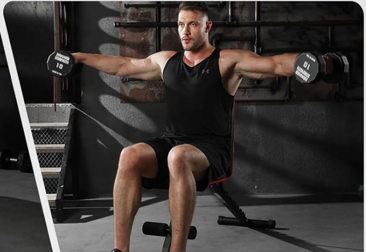
Dumbbell Flying Bird