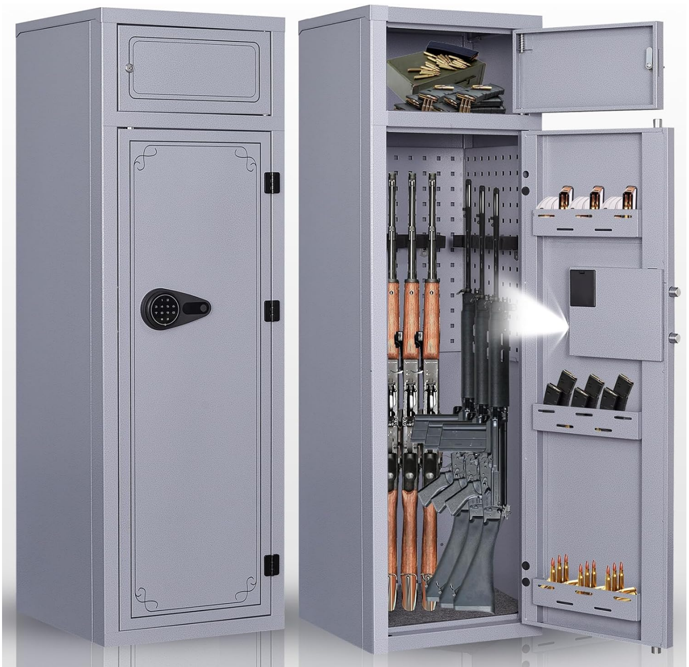
Image: The KAER 10-12 Gun Safe in grey, shown both closed and with its main door open, revealing internal storage for multiple rifles and a separate top compartment.