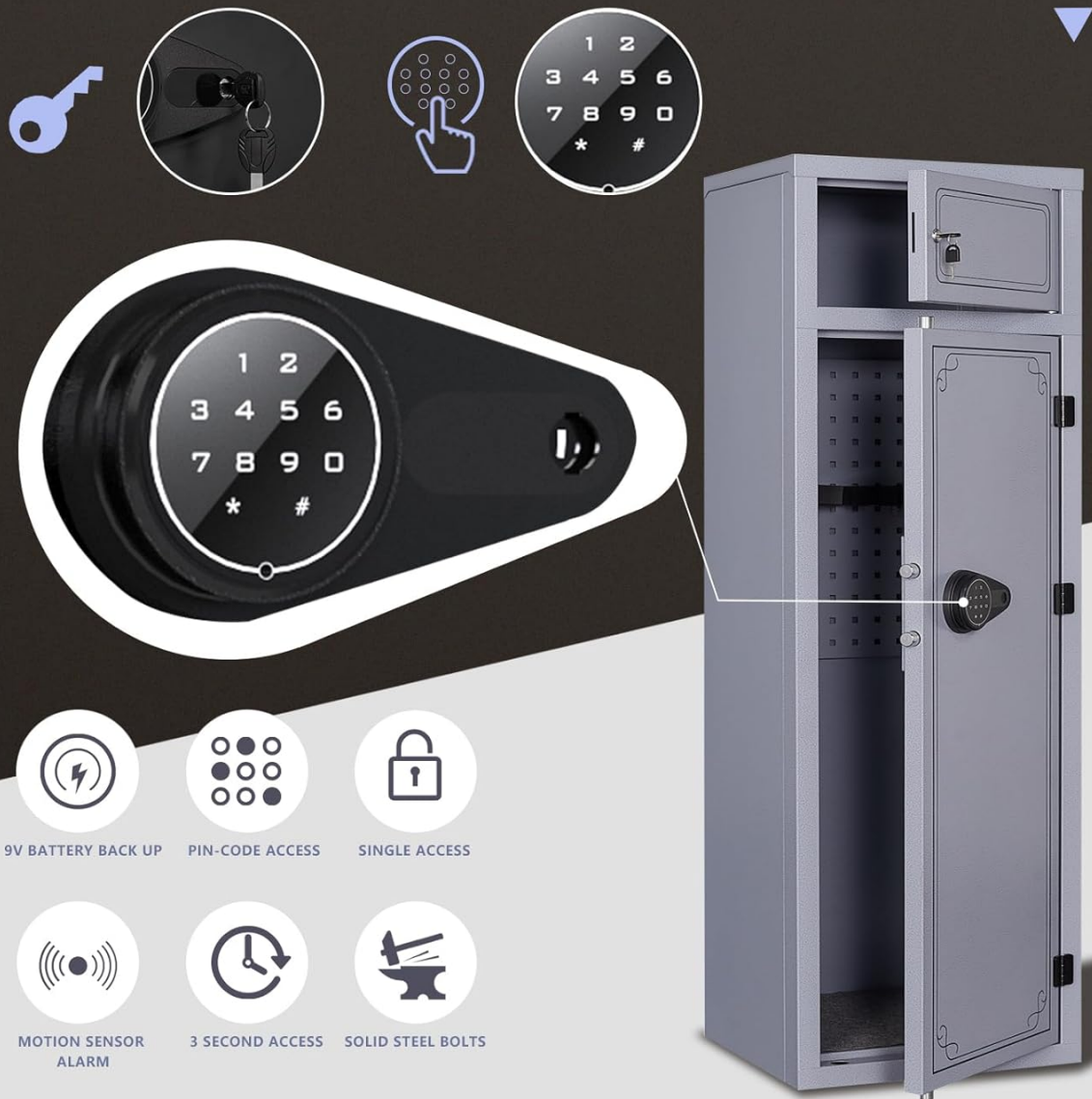
Image: A visual representation of the safe's dual-access system, showing both key and digital keypad options, along with key security features.