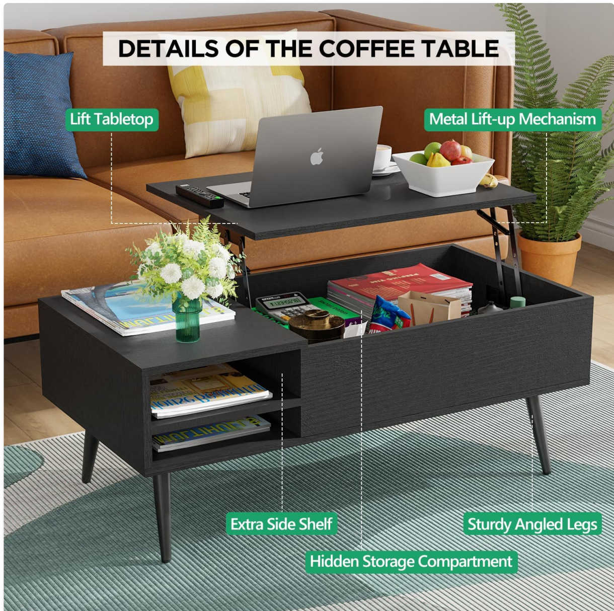
Image 3.1: Components and features of the coffee table, useful for identifying parts during assembly.