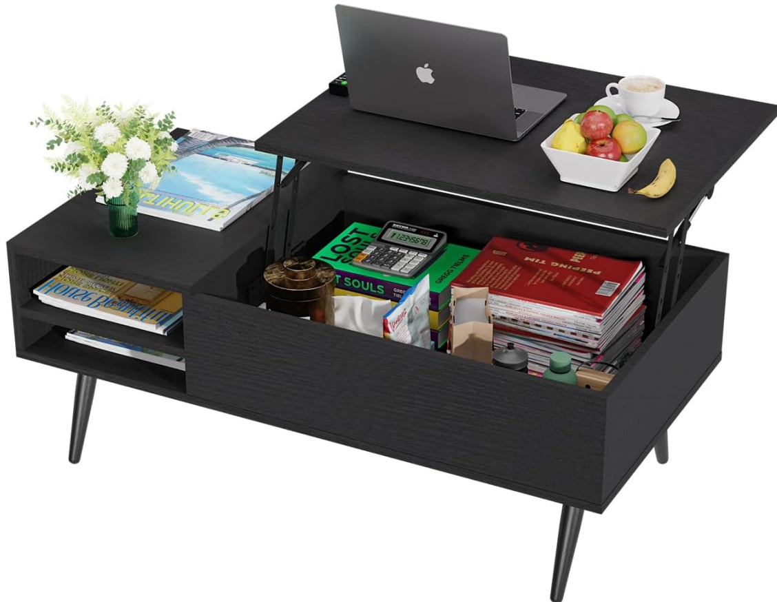
Image 5.3: Visual representation of the table's versatile storage capabilities for various household items.