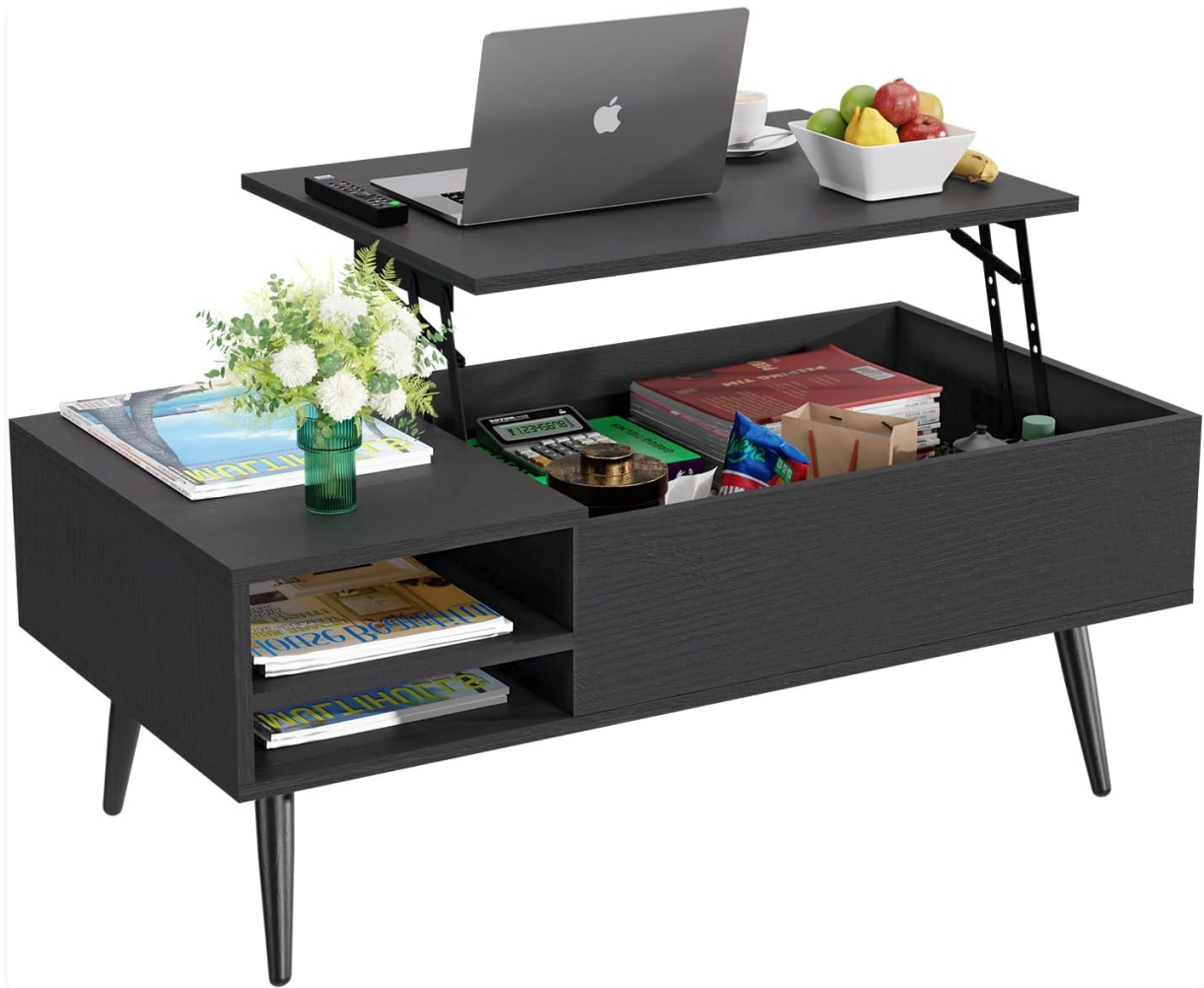
Image 1.1: The PayLessHere Lift Top Coffee Table in its elevated position, showcasing its functionality as a workstation or dining surface.