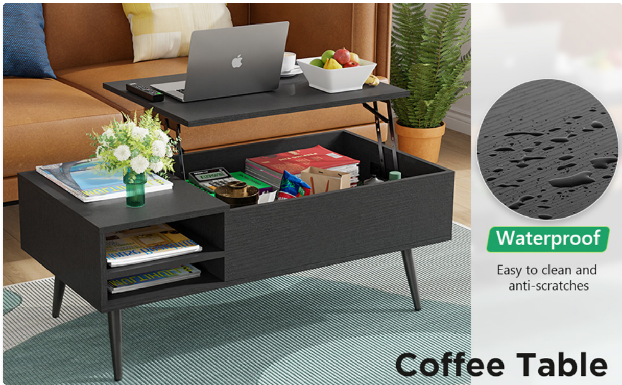
Image 6.1: The waterproof surface of the coffee table, demonstrating ease of cleaning.