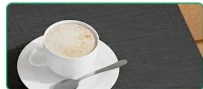
Thick MDF Wood Board