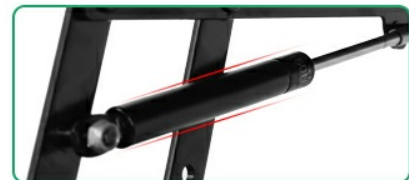
High-quality Metal Lift-up Mechanism