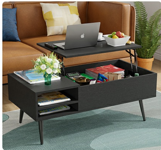
Image 6.2: The table's resistance to water and scratches, contributing to its durability.