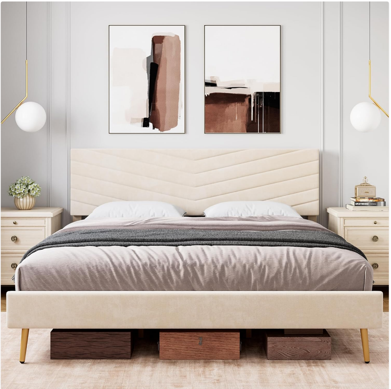
Image: The GAOMON King Size Velvet Upholstered Platform Bed Frame with a beige headboard and frame, featuring brass-tone tapered metal legs, set in a modern bedroom.