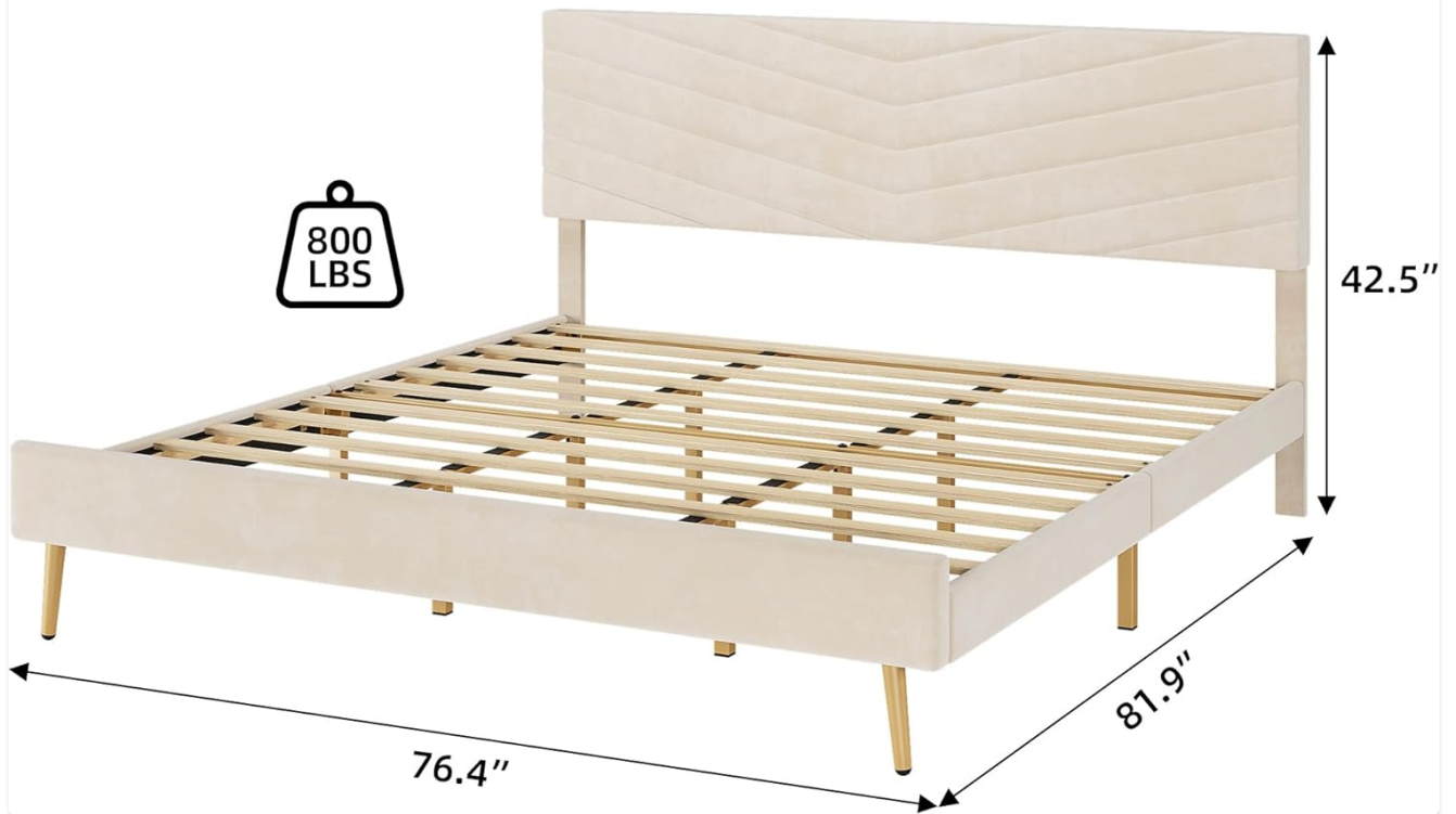
Image: A diagram illustrating the dimensions of the King Size bed frame, including length (81.9"), width (76.4"), and headboard height (42.5"). It also indicates an 800 lbs weight capacity and a 30-minute installation time.