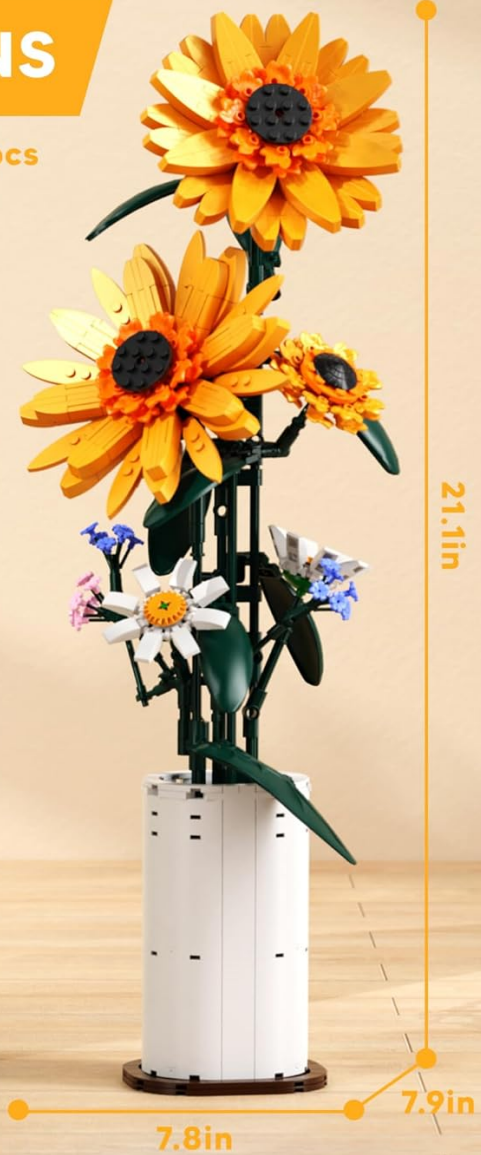
Image: A visual representation of the product dimensions, showing the approximate height and width of the assembled bouquet and vase.