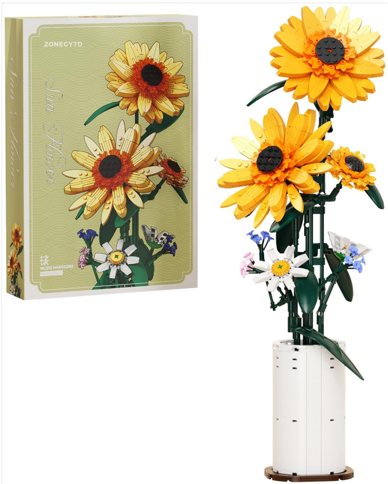
Image: The complete ZONECYTD Sunflower Building Blocks set, including the assembled flower bouquet in its vase and the product packaging.