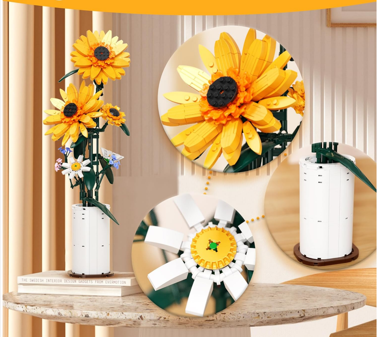
Image: A close-up view illustrating the detailed construction of the sunflower heads and the internal structure of the vase base.