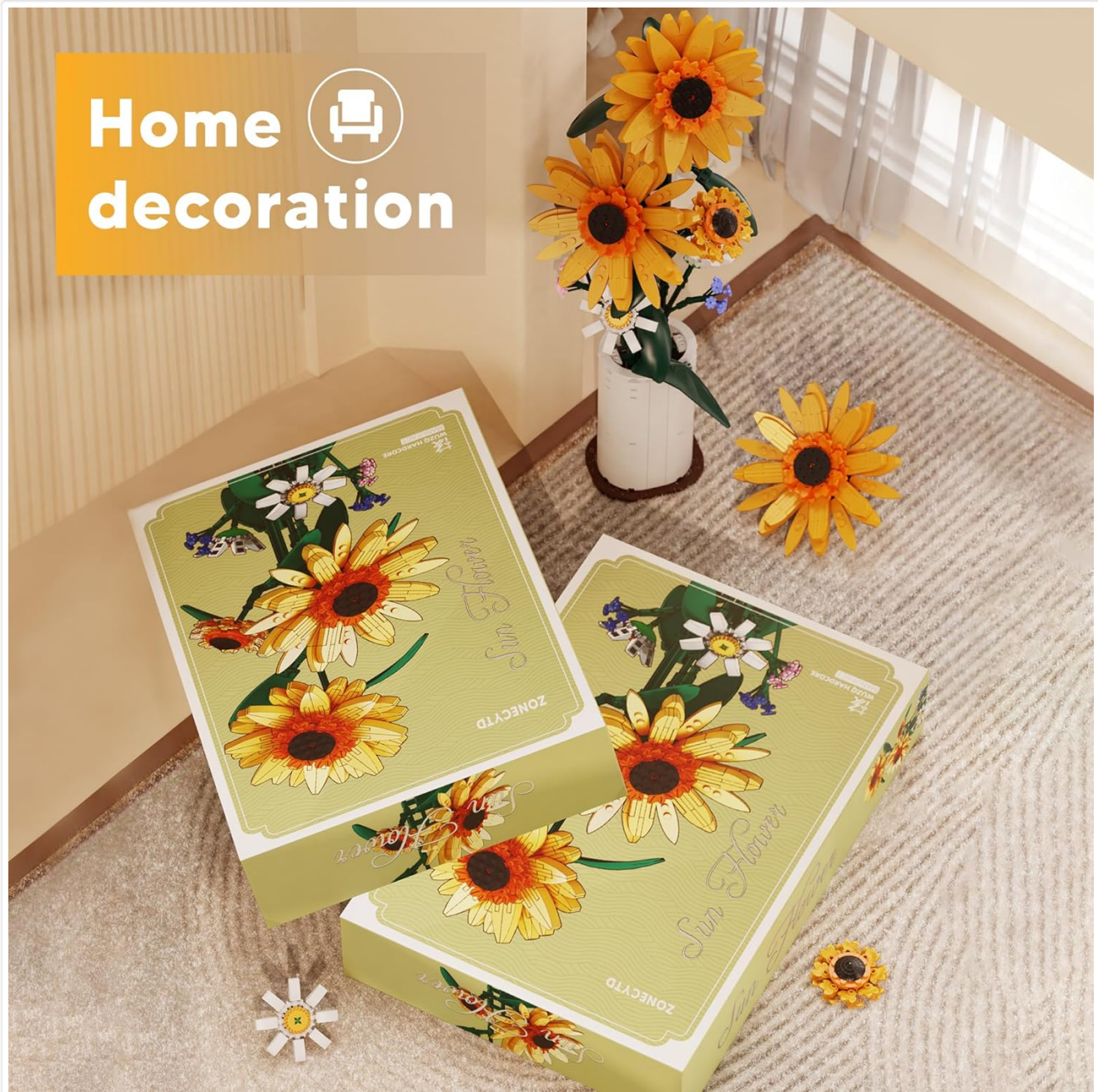
Image: The assembled ZONECYTD Sunflower Building Blocks Flower Bouquet displayed as a decorative item in a home setting.

Once assembled, your ZONECYTD Sunflower Building Blocks Flower Bouquet is ready for display. Place it on a flat, stable surface. Due to the design, the bouquet may be top-heavy. To prevent accidental tipping, especially in high-traffic areas, consider adding weight to the inside of the vase or securing the base.