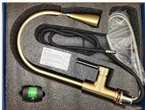
Image: Detailed view of the package contents for the pull-out tap.