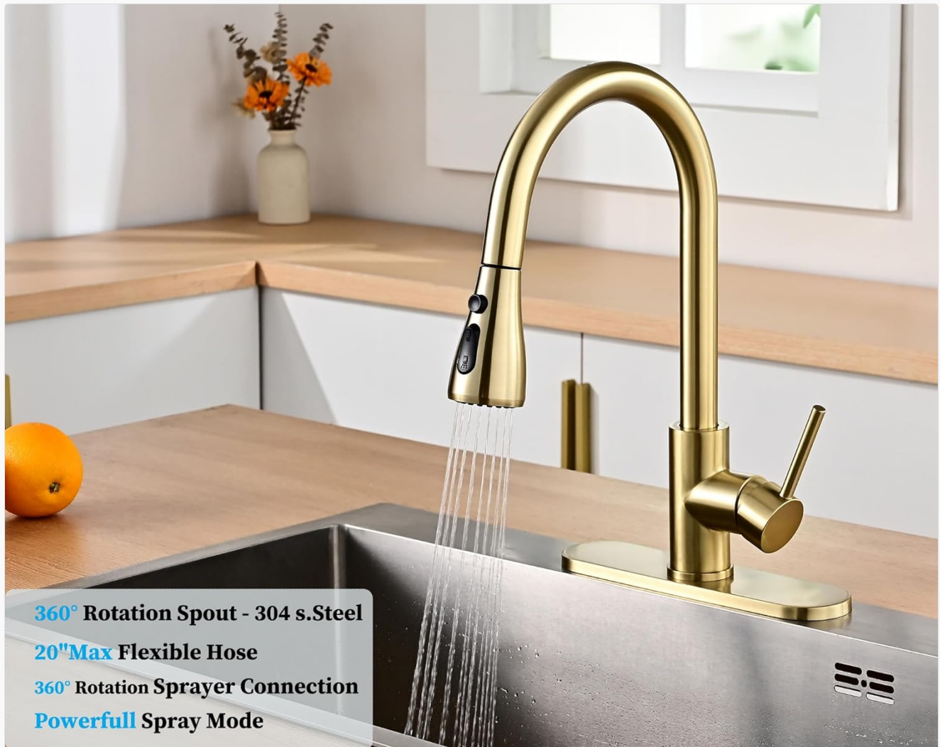
Image: Havin Gold Kitchen Faucet HV601 in operation, showing the pull-down sprayer.