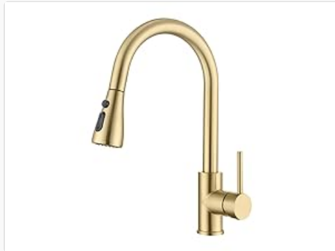
Image: Single pull-down kitchen mixer for one-hole installation.