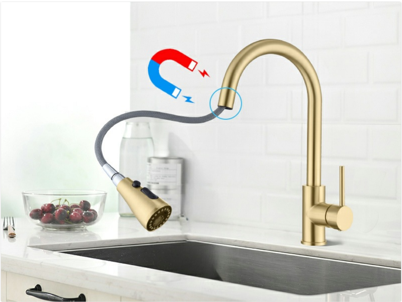
Image: Magnetic docking system for the pull-down sprayer.