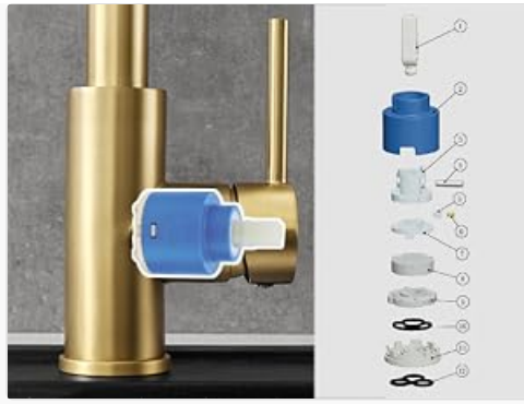
Image: High-quality ceramic disc component.