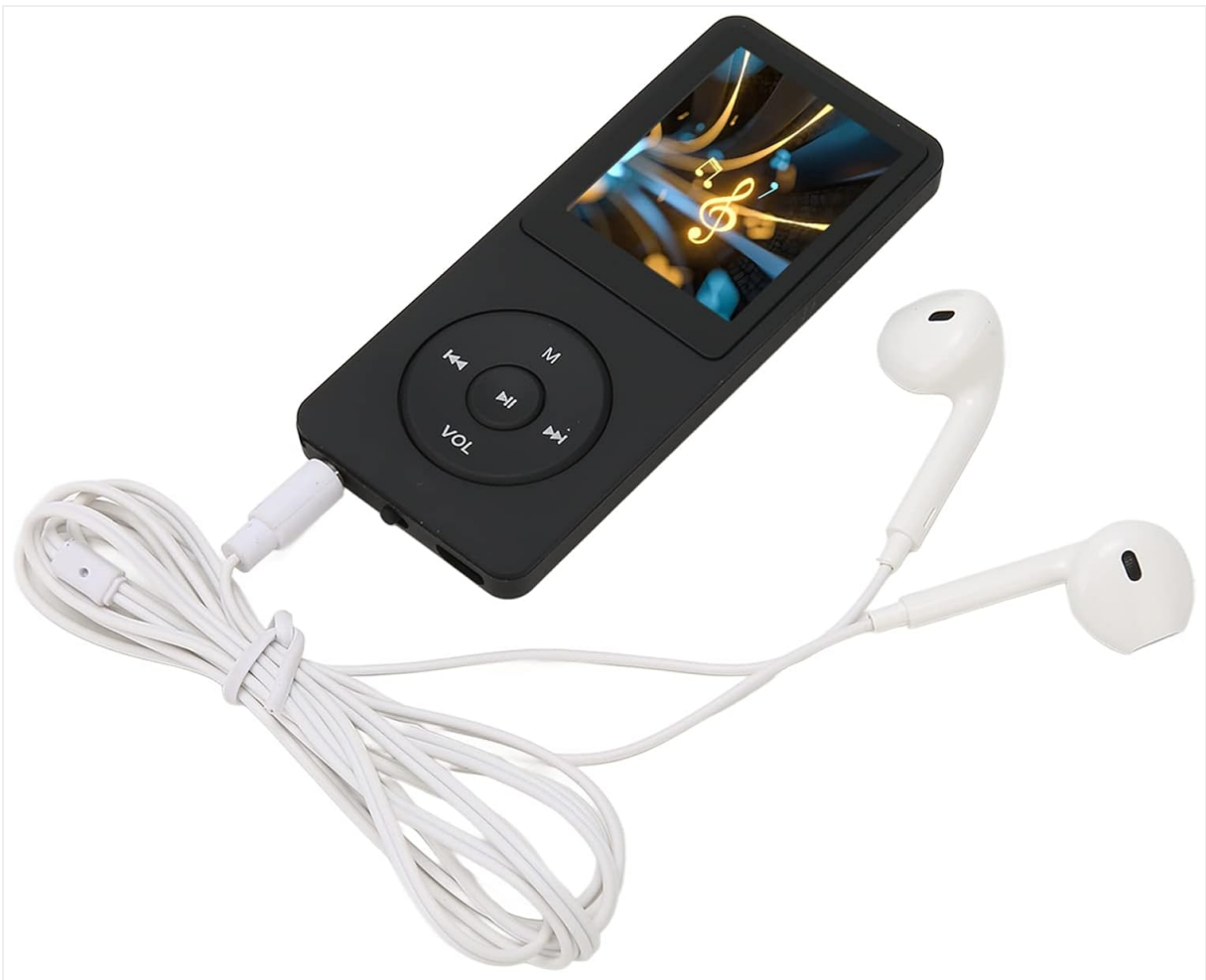
Image: The Zopsc MP3 MP4 Player shown with its included wired earphones and charging cable connected.