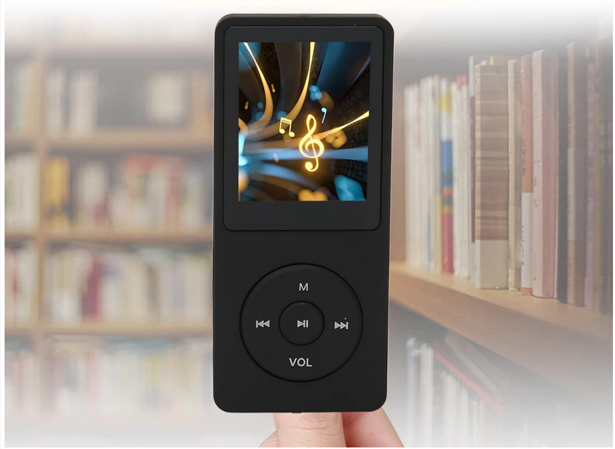
Image: The Zopsc MP3 MP4 Player showcasing its smart electronic book feature with text displayed on screen.

TXT format Automatic page turning, smart bookmark, memory reading