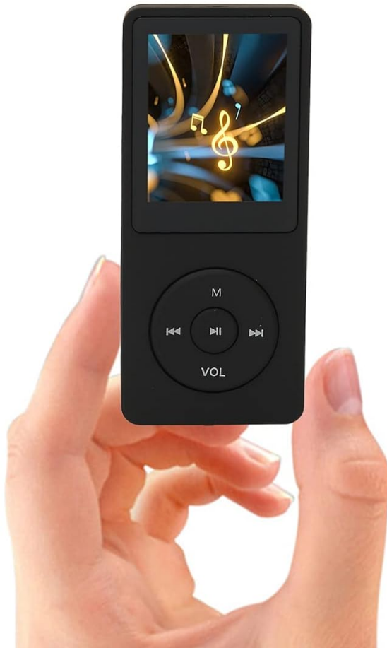
Image: The Zopsc MP3 MP4 Player showing its FM radio interface with frequency display.

Works perfectly with your car via the AUX port