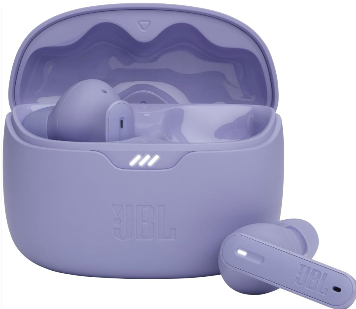
Figure 1: JBL Tune Beam True Wireless Earbuds in purple charging case with one earbud removed.

The JBL Tune Beam True Wireless Active Noise Cancelling Earbuds are designed to provide an immersive audio experience with advanced features for comfort and clarity. This manual provides essential information for setting up, operating, maintaining, and troubleshooting your earbuds.