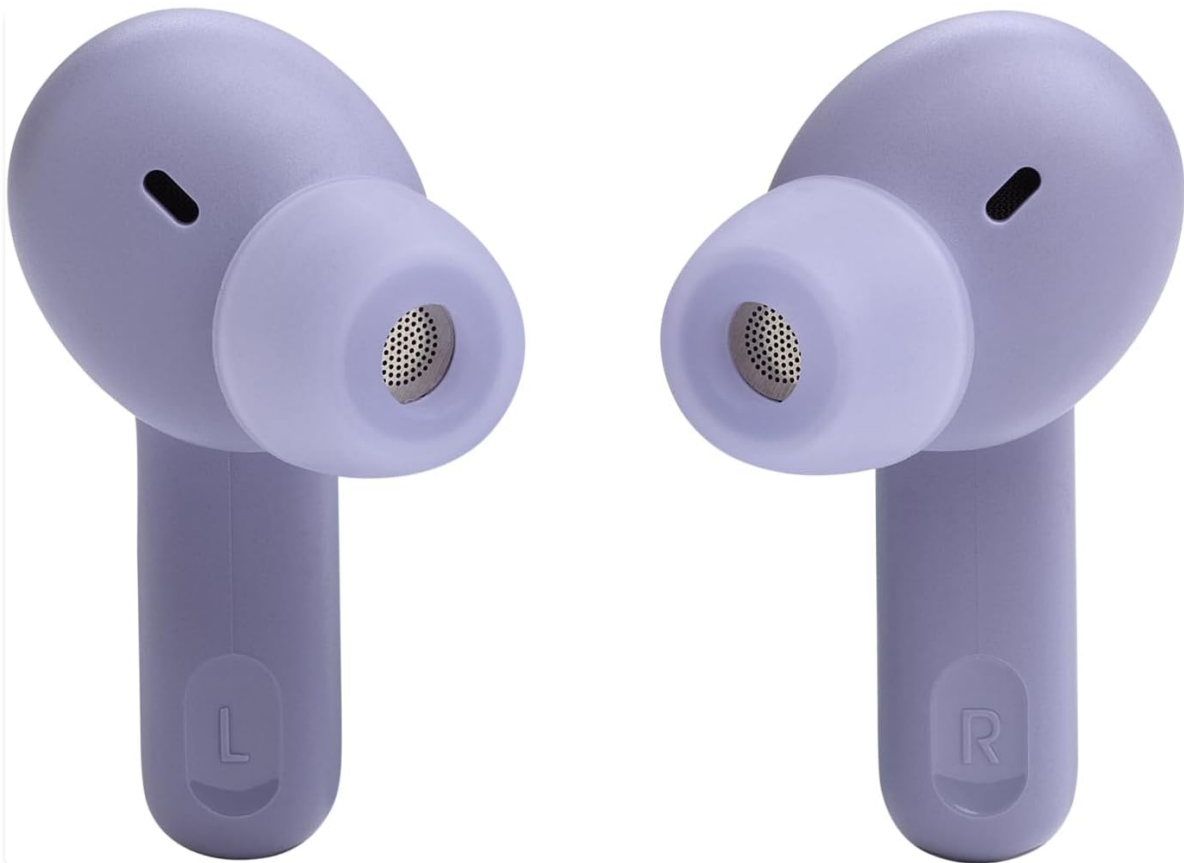
Figure 3: Close-up of the earbud tips, showing the design for a secure fit.