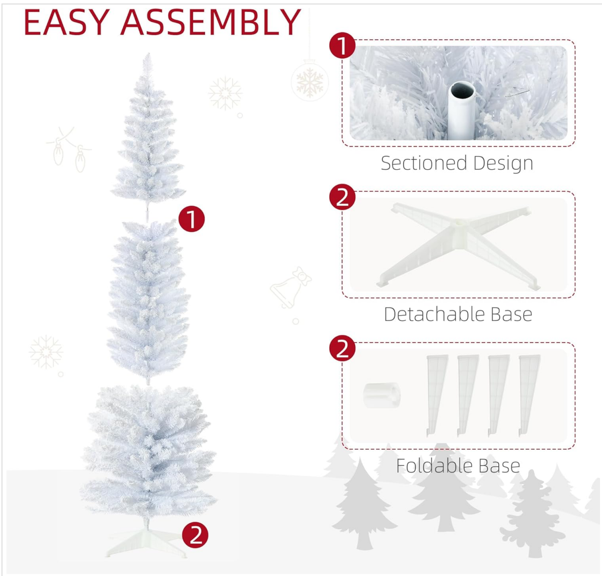
Image: Components of the HOMCOM Artificial Pencil Christmas Tree, including the sectioned tree and the detachable plastic base stand.