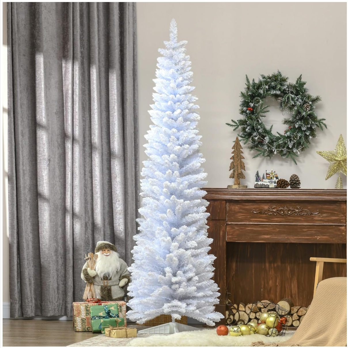
Image: The HOMCOM 7ft Snow Flocked Artificial Pencil Christmas Tree, fully assembled and decorated, standing in a room.