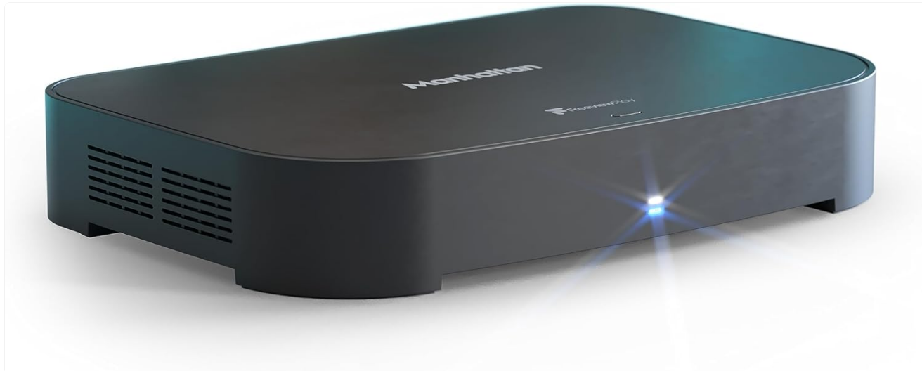
Image: The Manhattan T4-R 1TB Freeview Play 4K TV Recorder, a sleek black unit with a glowing blue indicator light, showcasing its compact design.

The Manhattan T4-R 1TB Freeview Play 4K TV Recorder is designed to enhance your television viewing experience by integrating over 100 live Freeview channels with extensive on-demand and catch-up TV content. It allows you to record, pause, and rewind live television, providing flexibility in how you consume media. With a 1TB hard drive, you can store up to 600 hours of recordings. The device supports 4K resolution and offers seamless search capabilities across live and on-demand programming.