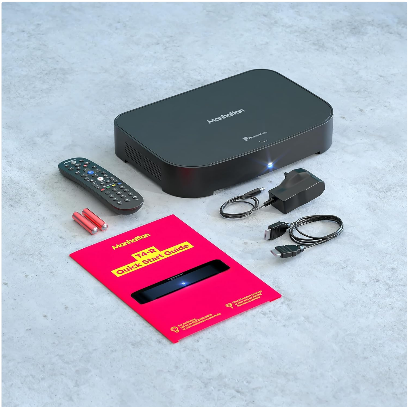
Image: The complete contents of the Manhattan T4-R box, including the recorder unit, remote control, power adapter, HDMI cable, and quick start guide.