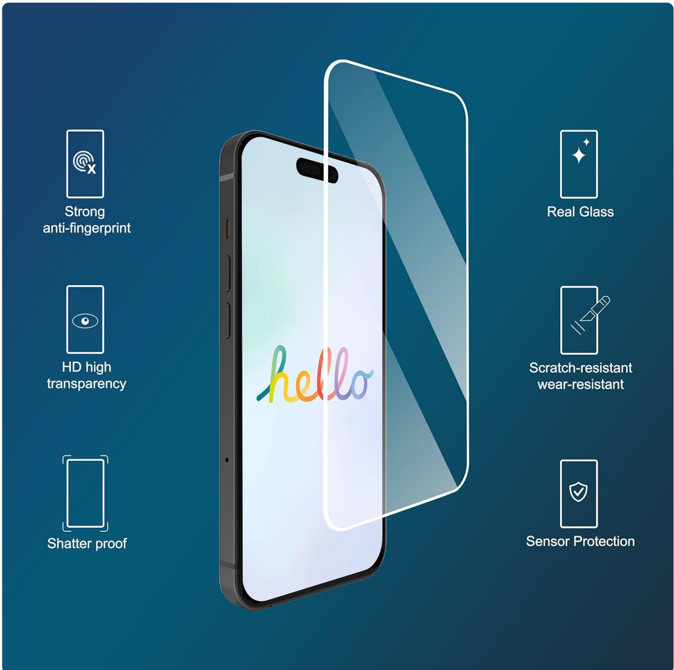
Image: Step-by-step application of the screen protector, illustrating its key features.