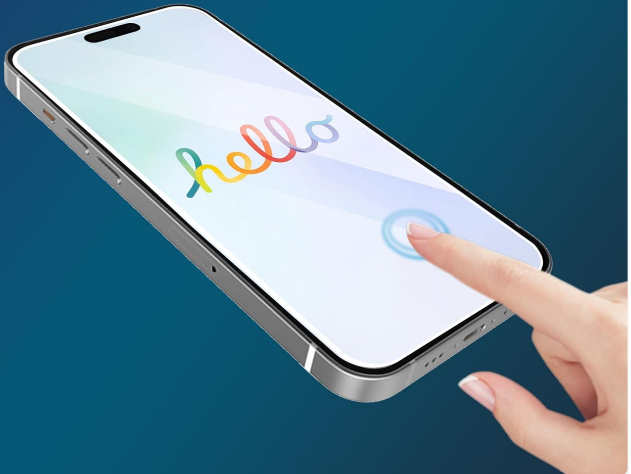
Image: The screen protector maintains strong and sensitive touch accuracy.