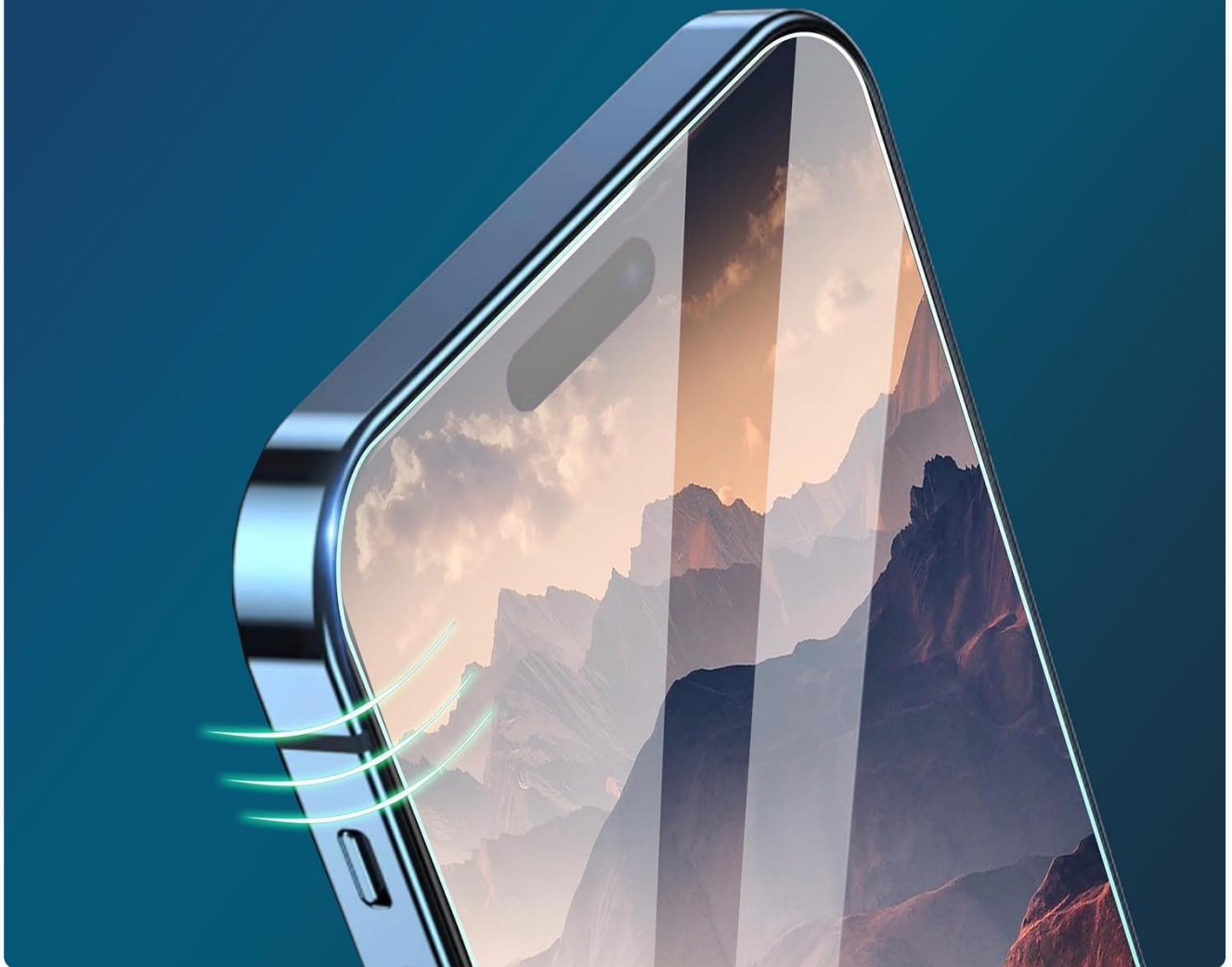
Image: The screen protector's precise fit ensures compatibility with most phone cases.