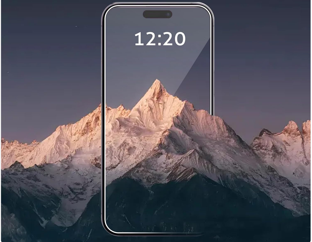
Image: The ultra-clear tempered glass ensures advanced HD clarity.