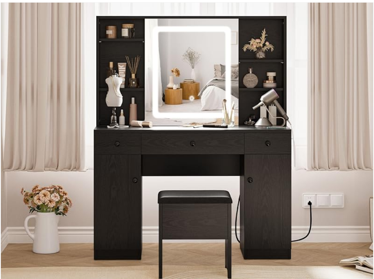
Image: The sliding LED mirror revealing hidden storage and its movement across the vanity top.