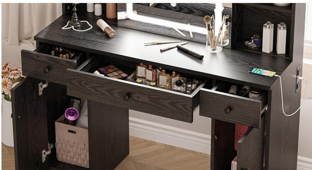
Image: The vanity desk with drawers and cabinet doors open, showcasing the internal storage capacity.