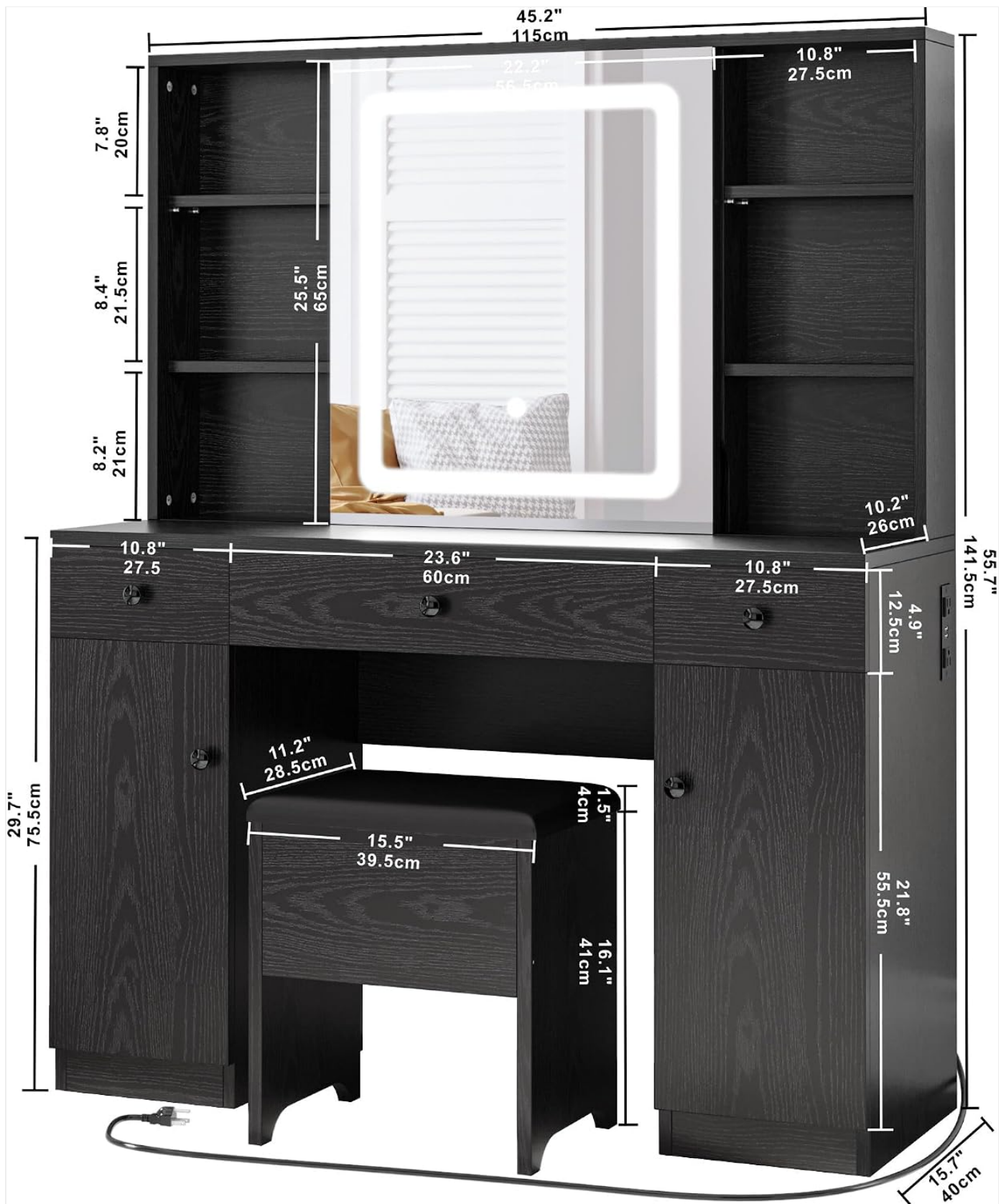
Image: Detailed dimensions of the vanity desk, including height, width, and depth of various sections.

The assembled vanity desk measures approximately 45.2"D x 55.7"W x 15.7"H.